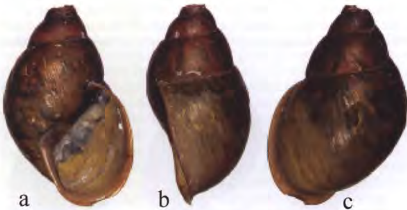
Fig. 2. Three views of Partula meyeri , n. sp., BPBM 255947.

The tip of the shell spire is broken, but other than a small hole and crack on the dorsal body whorl and a small chip off the anterior peristome, the shell is rather well preserved. Extrapolating for the broken tip of the spire, the shell measures approximately 16.5 mm in length and 10.5 mm in width.