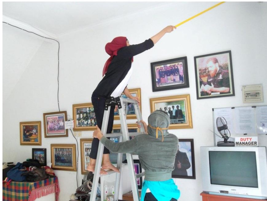
Figure 4 Decorating the Walls at Kahfi