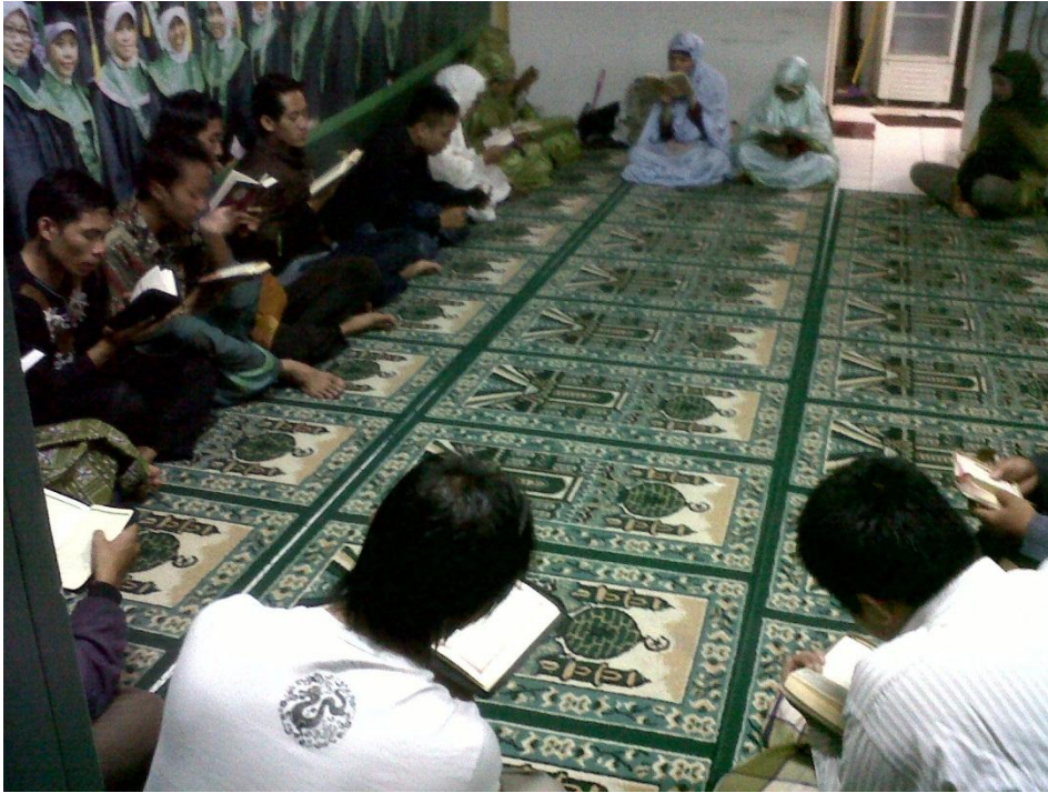
Figure 6 Rapid Recitation of the Qur'an

The performance of the itikaf at Kahfi served both rhetorical and practical functions. On a conceptual level, it elevated Kahfi to a position closer to a mosque than a school. Although no one made this claim in these terms (there are extensive juridical requirements for a space to be recognized as a mosque), the fact that a term densely associated with mosques was selected for this event lent added spiritual significance to the formerly profane environs of the ruko. On a more pragmatic level, the itikaf served to gather the students from diverse Kahfi cohorts into the newly acquired space at the same time. Most cohorts met twice a week and at different times, and thus a shared identity across cohorts was unlikely to coalesce naturally. The only other activity that would draw students from across the years was the staging of a General Class ( kuliah umum ), which was held if a special guest speaker had been booked. During the itikaf, the usual hierarchal structures of Kahfi were deemphasized, one more way to mark this moment and