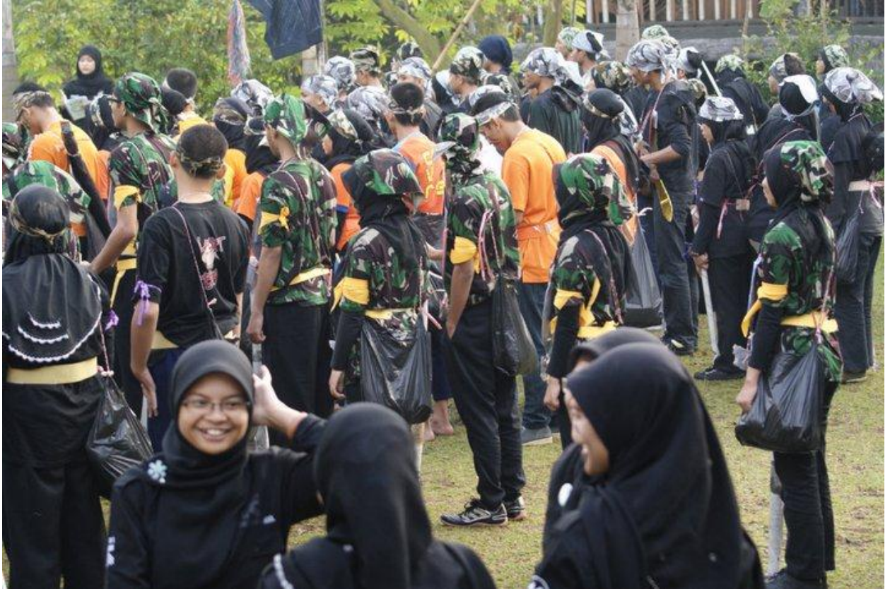
Figure 15 Recruits and Facilitators at Kahfi Ospek 13

The theme at Kahfi Osepik Angkatan 13, as it often is for ospek, was military (see Figure 15 above). Those wearing camouflage in the center of the image are the prospective students subjected to the ospek; the smiling women in the foreground are part of the team conducting the ospek . The military represents an enduringly popular visual idiom for collectivities as convened in Indonesia. The expression of this idiom can be found in myriad social settings. Uniforms are ubiquitous, whether for an in-service day at the office, spent removing litter from a public park, or for a public performance of praise songs recited by a choral group drawn from an orphanage. As Gregory Simon argues in Caged in on the Outside for Minang speakers, in terms of mannered performances and ritual speech ( basa basi ), there is a tremendous value placed on being part of a group (76-85). Simon is following an argument in Frederick Errington's Manners and Meaning ,