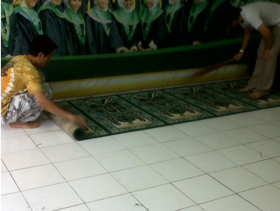
Figure 3 Rolling out the Prayer Mats at Kahfi