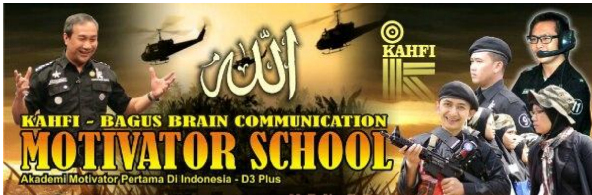
Figure 16 A Military Aesthetic at Kahfi

banner graphic. Allah , in Arabic, is central, flanked on each side by images of helicopters lifted from posters or marketing material from the film Apocalypse Now . The right side of the image is peopled with senior Kahfi figures, two from my cohort, one from the third cohort (holding the plastic model carbine) and one from the 11 th cohort, wearing a headset as if somehow coordinating the movement of troops. The “block K” Kahfi logo is visible between the student/troops and the rightmost helicopter. Beneath the large print “Motivator School,” the poster reads in Indonesian, “The First Motivator Academy in Indonesia – D3 Plus” (D3 being a 3 year associates degree). From American shores, it may be difficult to imagine the audience for this particular poster.