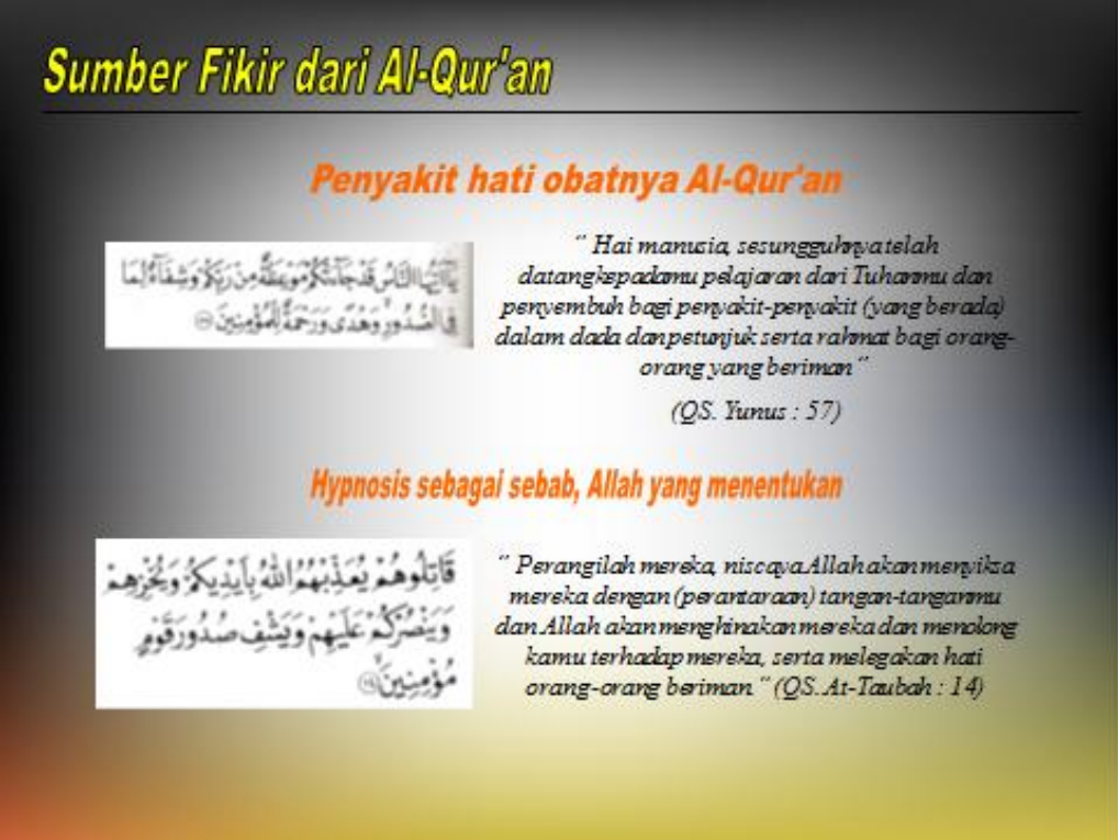
Figure 11 Sources of Thought from Al-Qur'an (3A)