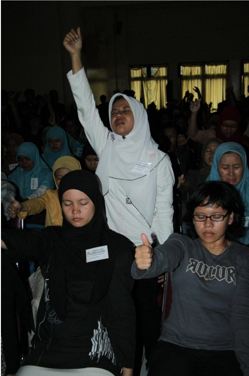
Figure 1 Mass Hypnotic Induction

This exercise is conducted not simply for the affective benefits described above, but as a sort of test – a test designed to check prospective student's “focus.” Focus is the key term for IH as practiced at Kahfi. Whereas other hypnosis literature privileges “suggestibility,” in the conceptualization of hypnosis adopted at Kahfi, the ability to be hypnotized is a mark of one's ability to focus. The higher that focus is, the easier it is to direct it to the stimuli proffered by the hypnotist and away from any other sort of sensory inputs that might challenge the hypnotic