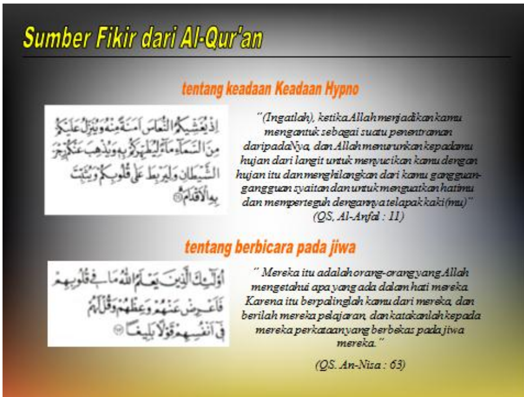
Figure 7 Sources of Thought from Al Qur'an (1A)