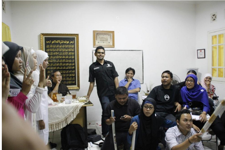
Figure 5 Planning Session Upstairs at Kahfi

Shortly after moving to the ruko, in late April, Kahfi also held what they termed an itikaf (Ar. residence). Although conventionally understood to be a temporary residence or retreat in a mosque for the purposes of drawing closer to God (and with an accompanying fast and devotional activities), in the Kahfi context itikaf was understood as a collective effort at moral purification and renewed submission to God that would bring blessings to the place of its performance . Itikaf is an allowable practice on any of the days in the Islamic calendar that permit fasting (ie, not feast days), but it is highly recommended during the final ten days of Ramadhan. Certainly Om Bagus and the vast majority of the students understood the formal definition and practice of itikaf – by transforming it here, they were using devotional energies as a tool to make something Islamic. 168 Instead of beginning before dawn (and lasting 3 days, 2 nights), the itikaf at Kahfi began after Isya , the final obligatory worship cycle of the day. It lasted until Subuh , the morning worship, of the following day. The intervening hours included a khatam al-Qur'an – a