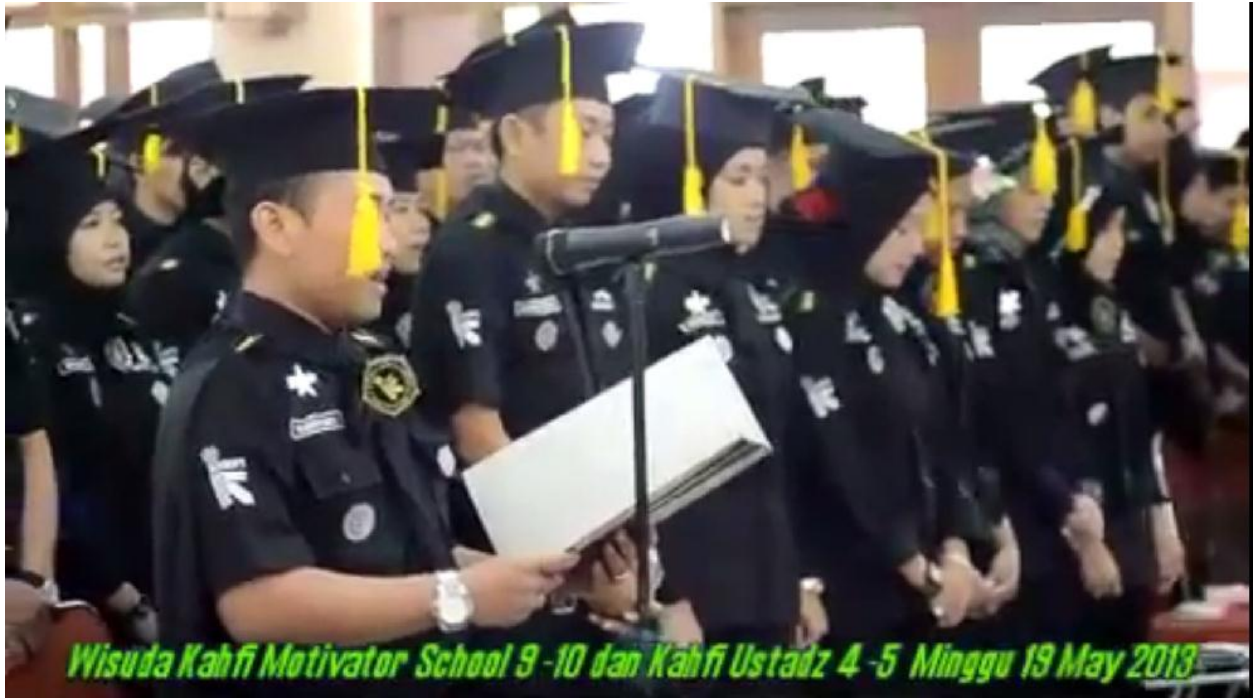
Figure 17 Kahfi Motivator School Graduation for Cohorts 9-10

nation, beneath the protection of Allah Subhanahu wa ta'ala [all Glory to God the Most High]. 211