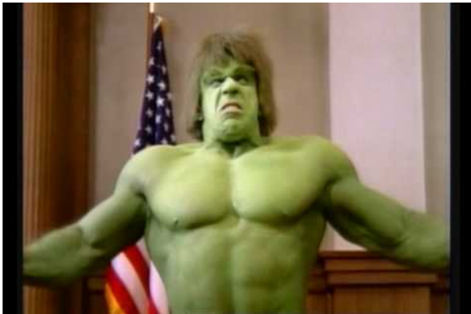
Figure 13 The Incredible Hulk .

Furthermore, during the long 1980s, Italians spent a higher percentage of their family budget on individualized recreational activities, such as physical training, toys, and vacations. The emphasis on appearances affected also the booming market of gyms, the new habit of jogging, and a higher interest in physical activity in general. 67 Apart from commercials featuring in-shape actors, the constant and coherent television broadcasting of Hollywood blockbuster films starring Sylvester Stallone and Arnold Schwarzenegger (the Rambo , Rocky and Terminator sagas), acclaimed television series such as L'incredibile Hulk ( The Incredible Hulk , U.S., 1978-1982), fitness classes in morning and evening shows such as Buongiorno Italia and Italia Sera , and the presence of exercise machines as prizes in game shows such as OK, Il prezzo è giusto! contributed