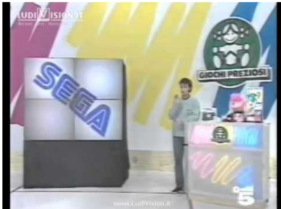
Figure 14 Bim Bum Bam (1992).

Additionally, there was increased spending on other individualized recreational products, such as toys. 68 For instance, the popular children and teens' program Bim, Bum, Bam alternated cartoons and sketches with commercial messages targeting young viewers. The advertisements often depicted merchandising connected to the same cartoons being shown. This strategy undoubtedly influenced the impulse to purchase and consequent spending on toys, as kids could materially buy their favorite cartoons' toy replicas at the numerous specialized stores booming throughout the country. 69