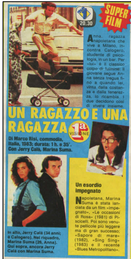
Figure 5 Superfilm 's promotional poster in Tv Sorrisi e Canzoni 49 (1985), 131.

In order to serialize the appointment with cinema without utilizing emotions or classic categories, Raiuno loosely followed the example of Canale 5 Pomeriggio con sentimento , and programmed Pomeriggio al cinema (Afternoon at the cinema) with mainly 1950s and 1960s Italian comedies ( Una di quelle – One of Those , 1953; Il diavolo – The Devil , 1963) in September of 1986. That year, Canale 5 launched XX Secolo (20 th Century) with journalist Guglielmo Zucconi. The cycle modeled the same formulas as Film Dossier , though programming more American films as Incontri ravvicinati del terzo tipo ( Close Encounters of the Third Kind , 1977) and Sindrome cinese ( The China Syndrome , 1979). In 1988 Italia 1, replicating Raiuno, introduced Lunedì Film , featuring