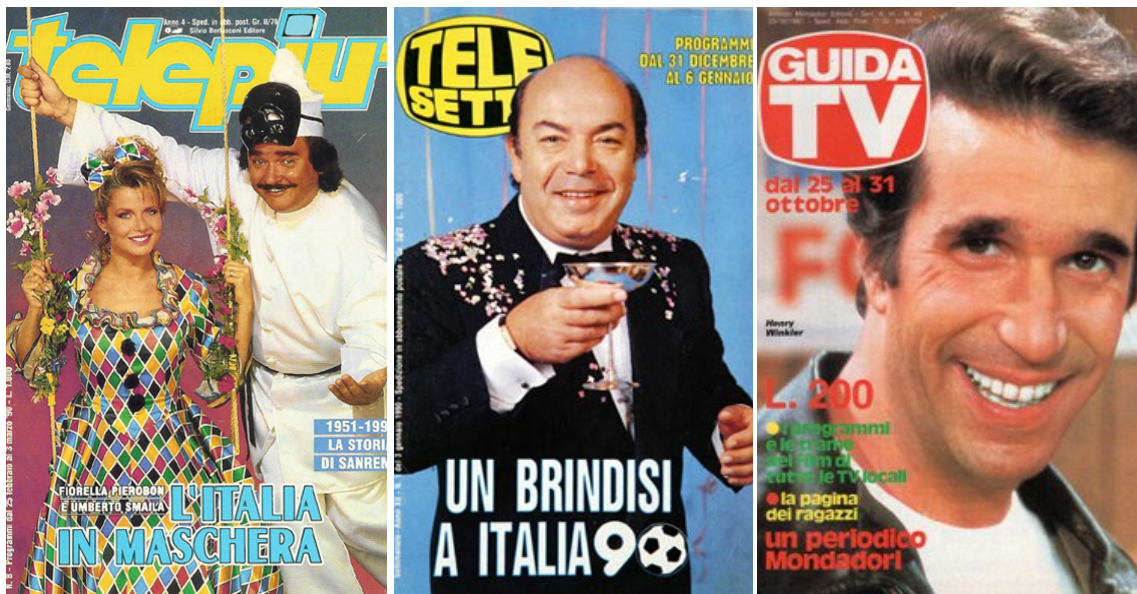
Figure 15 On the left Telepiù 8 (1990), in the middle Telesette 1 (1990), and on the right Guida TV 43 (1981).

The prominence of television programming also affected the surge of cultural expenses, more specifically the purchase of TV listing magazines. According to Ads (Accertamenti diffusione stampa), the most popular magazine in Italy during the long 1980s was one focusing on television: Tv Sorrisi e Canzoni . 81 Data from ISPI (Istituto per gli Studi di Politica Internazionale) and Ads estimate that at the beginning of the 1990s