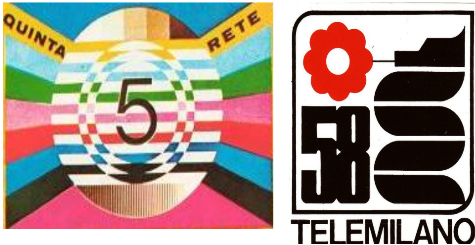
Figure 3 Quinta Rete's (left) and Telemilano 58's (right) logos. © 1976 by Quinta Rete, © 1978 by Telemilano 58 1978.