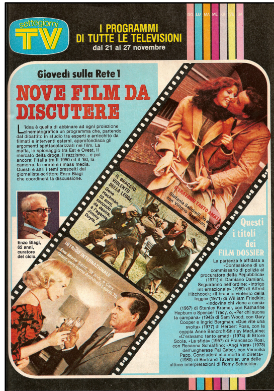
Figure 4 Film Dossier's promotional poster in Tv Sorrisi e Canzoni 47 (1982), 103.

screened a Monday evening appointment with popular and American films, such as the numerous installments of the Rocky saga. As the title conveys, Raiuno decided to reinforce the weekly appointment with cinema through a specific cycle founded on an enduring viewing habit and expectation.