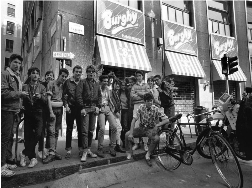
Figure 12 Paninari in Milan (1985).

chi i soldi ce li ha, ma anche di chi non ce li ha.” 66 The relevance of the presentation of the self was therefore widespread to almost all parts of Italian society during the long 1980s.