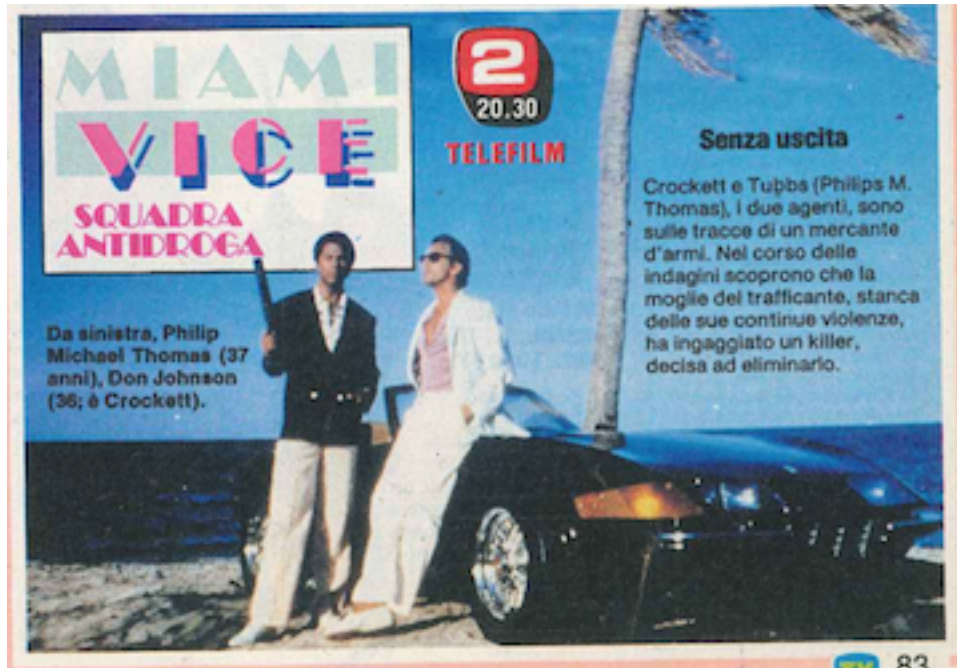
Figure 16 Miami Vice 's promotional poster in Tv Sorrisi e Canzoni 38 (1986), 83.

individualized characteristic increasingly trendy in the 1980s. The attraction for this car among young Italians was also due to commercials specifically targeting this segment. For instance, the advertisements starred popular television personalities from the youth-oriented channel Italia 1. In this way, the commercial seductively featured program hosts, thus combining advertisements with key elements of various programs. In the case of Autobianchi Y10, Italia 1's showman Gerry Scotti was the protagonist of a 1989 commercial. The purchase of cars then became more individualized during the long 1980s, also thanks to the allures of television programming.