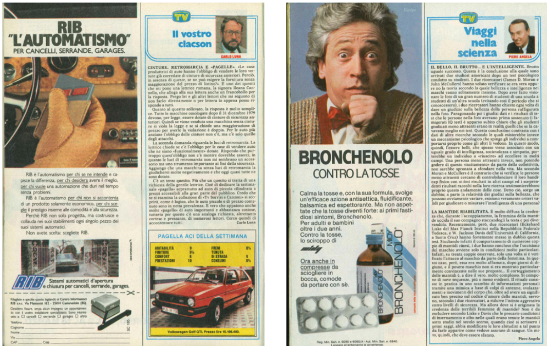
Figure 20 Examples of the arrangement of columns and relevant advertisements in Tv Sorrisi e Canzoni 8 (1985), 14, 16.

the advertisement message's effectiveness by juxtaposing it to the same potential reader of a column or separate article.