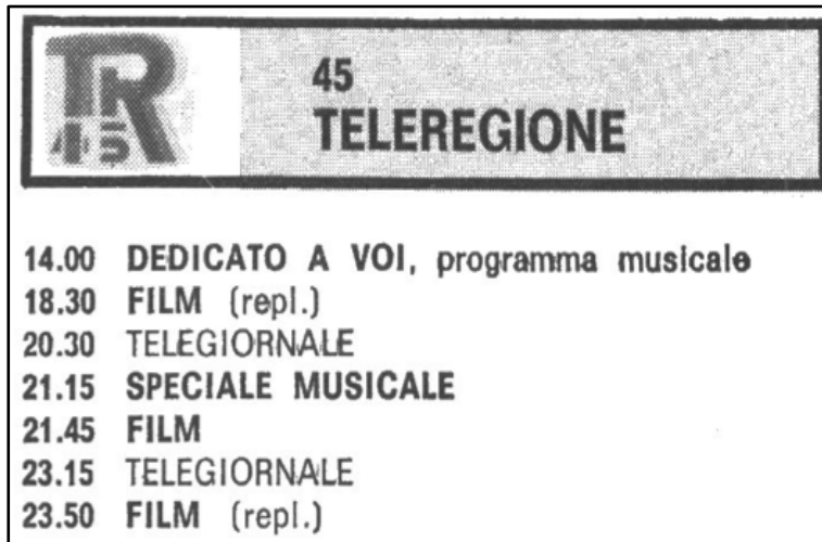
Figure 2 Teleregione's schedule on Tuesday, November 22, 1977 (Rome). Teleregione failed to communicate film titles to magazines and often repeated the same films throughout the day.