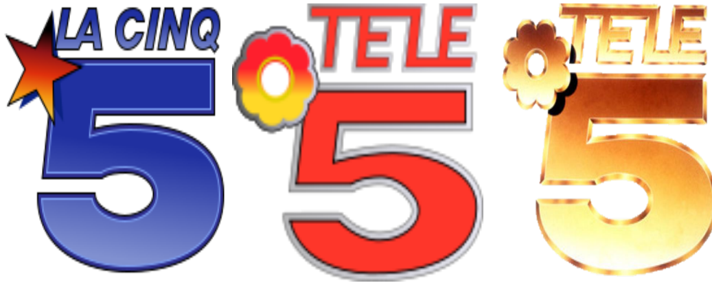
Figure 1 La Cinq’s (left) Telefun’s (center), and Telecinco’s (right) logos. © 1986, 1988, 1990 by Fininvest.

effectively competing for advertising revenues against the U.S. As Berlusconi himself contended: