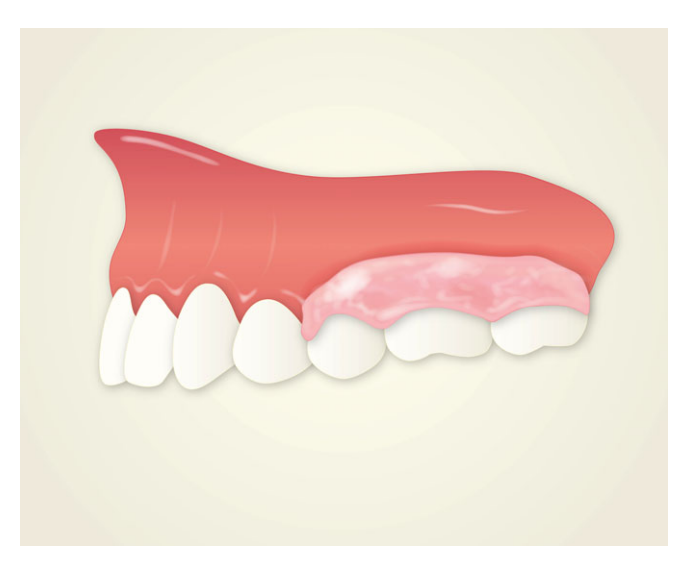
Fig. 2. Illustration of periodontal dressing placed after non-surgical therapy.

Scaling and root planing represents the most common and widely accepted procedure for the treatment of periodontitis (31). Recently, the use of dressing has been advocated to