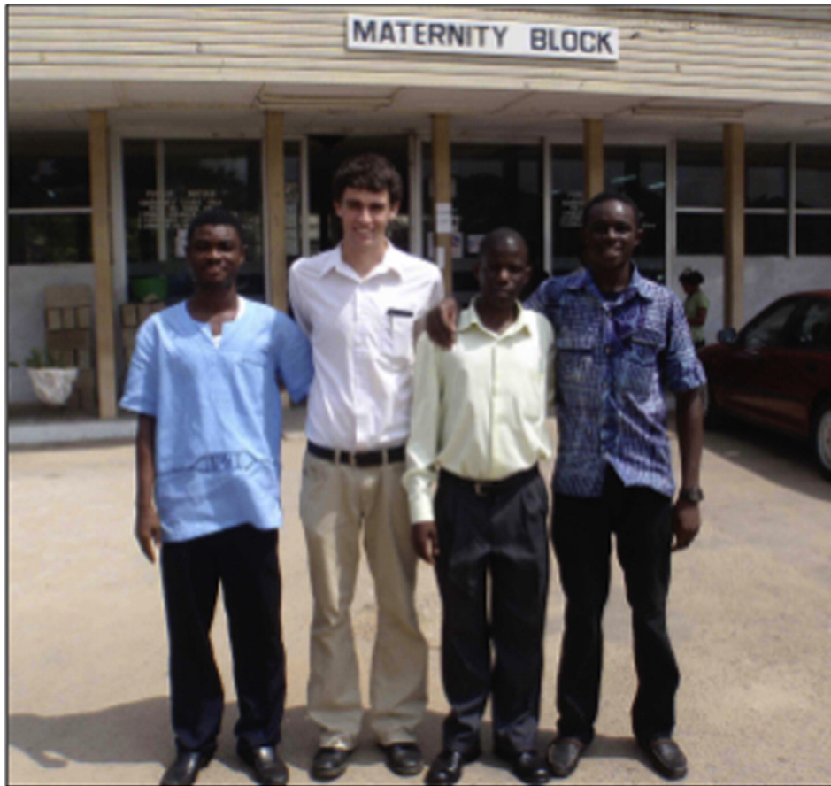
Fig. 1. Multinational clinical immersion team at Korle Bu Teaching Hospital, Accra, Ghana. Participants included students from the University of Ghana (Ghana), University of Michigan (USA), and Makerere University (Uganda).

making (8), organizational (15), sanitary (7), and supportive (10). Following the development and application of rubrics to identify and rank priorities, four distinct design project topics were selected in consultation with the department head and engineering faculty. Student projects stemming from the clinical immersion experience included a blood-warming device, assisted obstetric delivery device, adjustable labor and delivery bed, and a portable and attachable newborn cot.