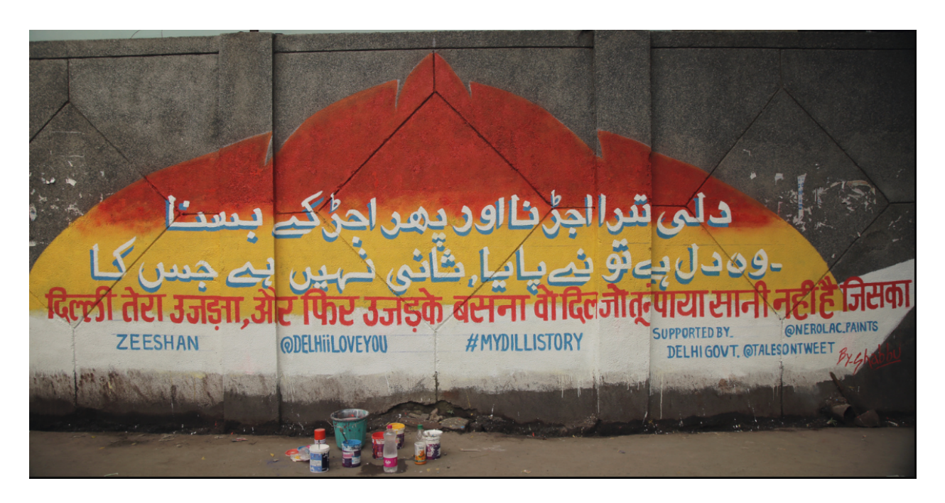
Figure 1: The completed rendering of Zeeshan Amjad's Twitter verse celebrating Delhi's history of ruin and rebirth.

artists' release. Two months later, Mishra sponsored a "wall painting event," including music, dance, and community-led wall painting, to commemorate the completion of the mural and demonstrate support for the city's linguistic, cultural, and religious diversity.<sup>4</sup>