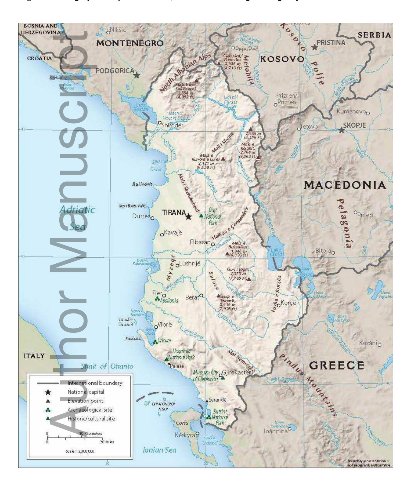
Figure 1: Geographic map of Albania (U.S. Central Intelligence Agency n.d.)