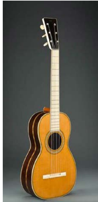
Left, Traditional Viennese guitar built by martin c.1834. Right, 1864 Martin Parlor Guitar.

The utility inherent in Martin's design, combined with the moral compass of early folk music, made it the instrument of choice for the early blues musician. The origins of the blues are relatively poorly documented due to the transitory nature and oppression of its performers. The moment that is anecdotally thought of as the birth of the blues is recorded by prolific black composer W.C. Handy: