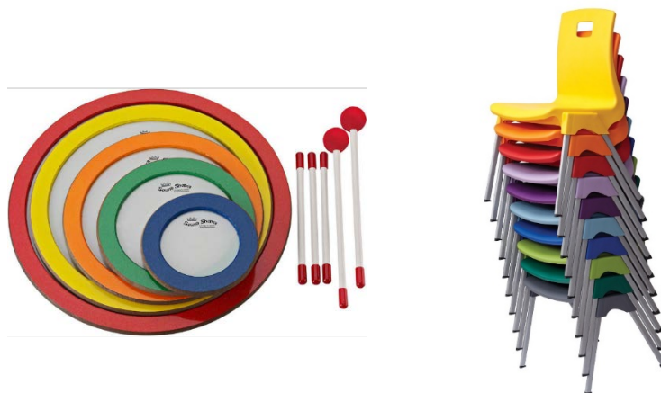
Left, Remo Sound Shape Circle Pack. Right, Gresswell ST Chairs.