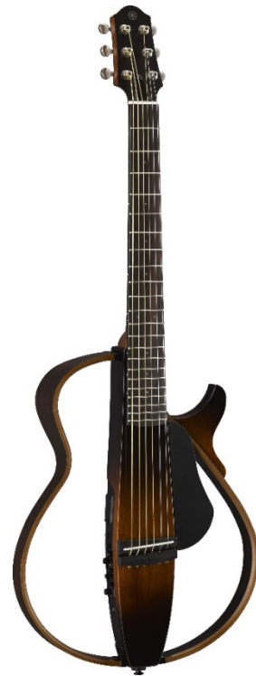
Left, Artiphon Instrument 1 Right, Yamaha Silent Guitar