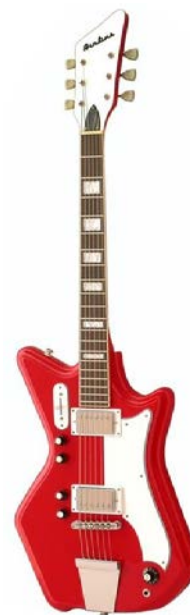
Left, Sears and Roebuck Silvertone Guitar Ad c.1960 Source: www.searsarchives.com . Right, 1965 Airline JB Hutto source: www.guitarplayer.com

They frequently boast low prices, generally between forty and sixty dollars including equipment. The instruments were sold with simple equipment to alleviate the struggle of purchasing accessories. The design principles of these mid-century oddballs still live today in many low-cost student instruments, as well as many practice instruments. The category of student instruments, outside of classical music, mainly consist of tambourines, drums, and recorders. These instruments have become popular because they are engaging to pick up and play, because they are obvious candidates for mass production, and because they are easily stored. Instruments of this size and shape naturally work well in groups, they are lightweight, durable, and once made from plastic, extremely cheap, occasionally also becoming stackable or nestable. At this point these instruments are really more similarly related to a set of cheap plastic stacking chairs than they are to their wooden ancestors.