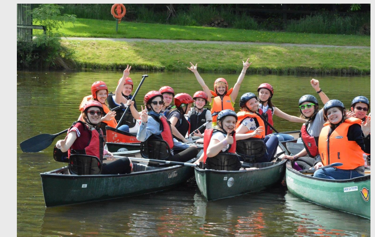
Kayaking with my Activity Group