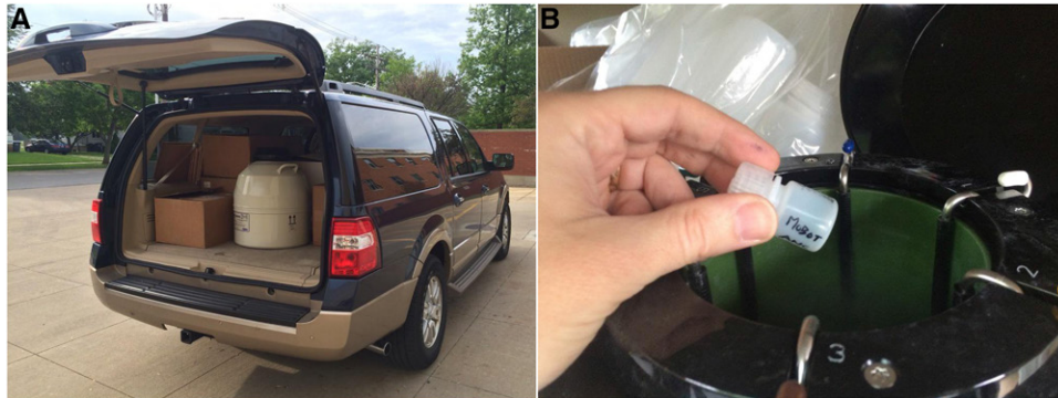
Fig. A2-1. (A) Field collection setup, with the trunk of the field vehicle doubling as a wind-blocking, sample processing workbench. (B) Placing sample bottles directly into the liquid nitrogen tank for the duration of the trip.

The field collection setup uses the trunk of the field vehicle as storage and as a wind-blocking, sample processing workbench (Fig. A2-1A).