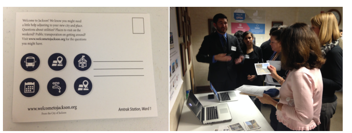
Figure 2: Postcard and Logo of The Welcome to The City Team (Left). Volunteer Technologists and Community Members Discuss the Postcards (Right).

Postcards . Many teams (Welcome to the City, Historic Museum, and Distressed Property) designed postcards inspired by their community partners as a low-cost, easy to maintain, and engaging method. Historic Museum team volunteer technologists used postcards as cultural probes for the museum archive by asking citizens to write their reflections on the postcard and mail it to the museum, and to archive the stories on Pinterest. Postcards printed with the community pictures, infographics of city information, and website URLs were also easy to distribute through local community organizations. For instance, the Welcome to the City team collaborated with many community organizations like the City Water Department to deliver the postcards to new residents when they registered for water bills (Figure 2).