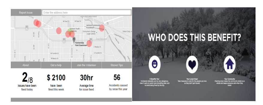
Figure 3: The Design of the Snow Removal Project Before (Left) and After (Right) Discussion of a Positive Community Image.

to the fear that the name "crime watch" indicated a negative impression of high-crime rate in the community.