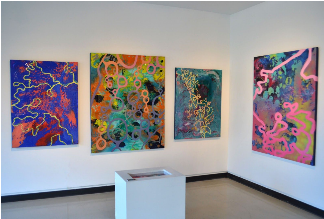
The Installation at the Stamps Gallery.

All of the pieces in the gallery together with the interactive sculpture created a saturated and surreal environment inviting the viewers to dive into the depth of the painting and explore the details created by the experimental processes.