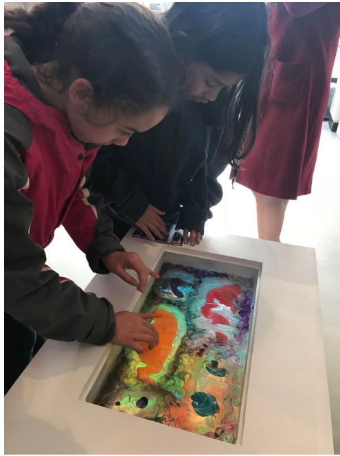
Young artists interacting with the sculpture at the show opening.

experimental bottom layers from the top hand painted linework. The painted line serves as a guide in which to view the painting, floating on top of the, it plays with being detached and connected with the experimental chaotic layers underneath. The resin also acts as a liquefier, making the paintings feel as though they are still fluid and in motion, almost frozen in time.