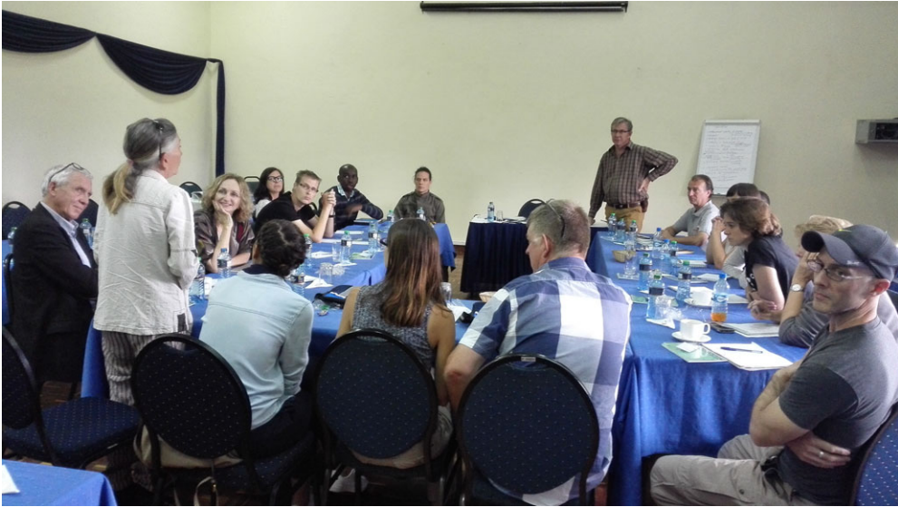
Plate 1. Directors of sanctuaries and wildlife centres that are members of the Pan African Sanctuary Alliance have a meeting at The Strategic Development Conference in Nairobi, Kenya, in December 2015.

months at the sanctuaries to train all the animal-care staff. The specific topics covered, duration of the training and teaching methods are customized for the needs and resources of each sanctuary. Since the start of the Program in early 2017, more than 300 staff who work directly with animals have received comprehensive training. The instructors, who have often gained their own experience by working in zoos, teach animal-care staff to follow internationally recognized best-practice guidelines and work to high standards. In addition to training animal-care staff directly, the instructors will teach the management how to educate new staff. Printed materials are left at the institution to reinforce lessons learned and help new staff to catch up with their more-experienced colleagues. The ability of member wildlife centres to train their own staff will provide sustainability and reduce dependence on PASA.