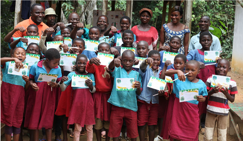
Plate 2. Children display their certificates of achievement upon completing the Cameroon Conservation Education Program. Sanaga-Yong Chimpanzee Rescue, 2017.

education programme to reach thousands more Cameroonian youth in 2017 and are obtaining similar results (Plate 2).