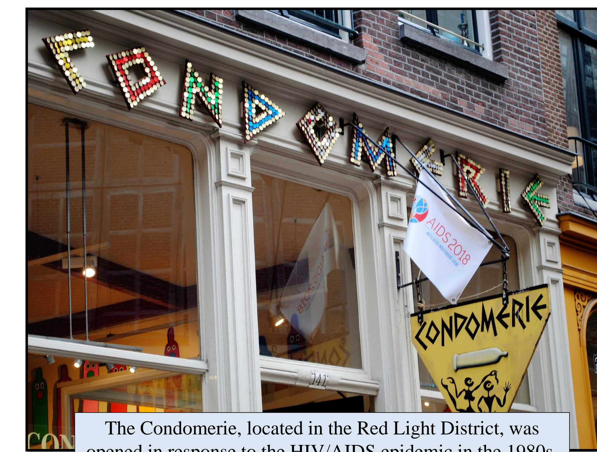
The Condomerie, located in the Red Light District, was opened in response to the HIV/AIDS epidemic in the 1980s.