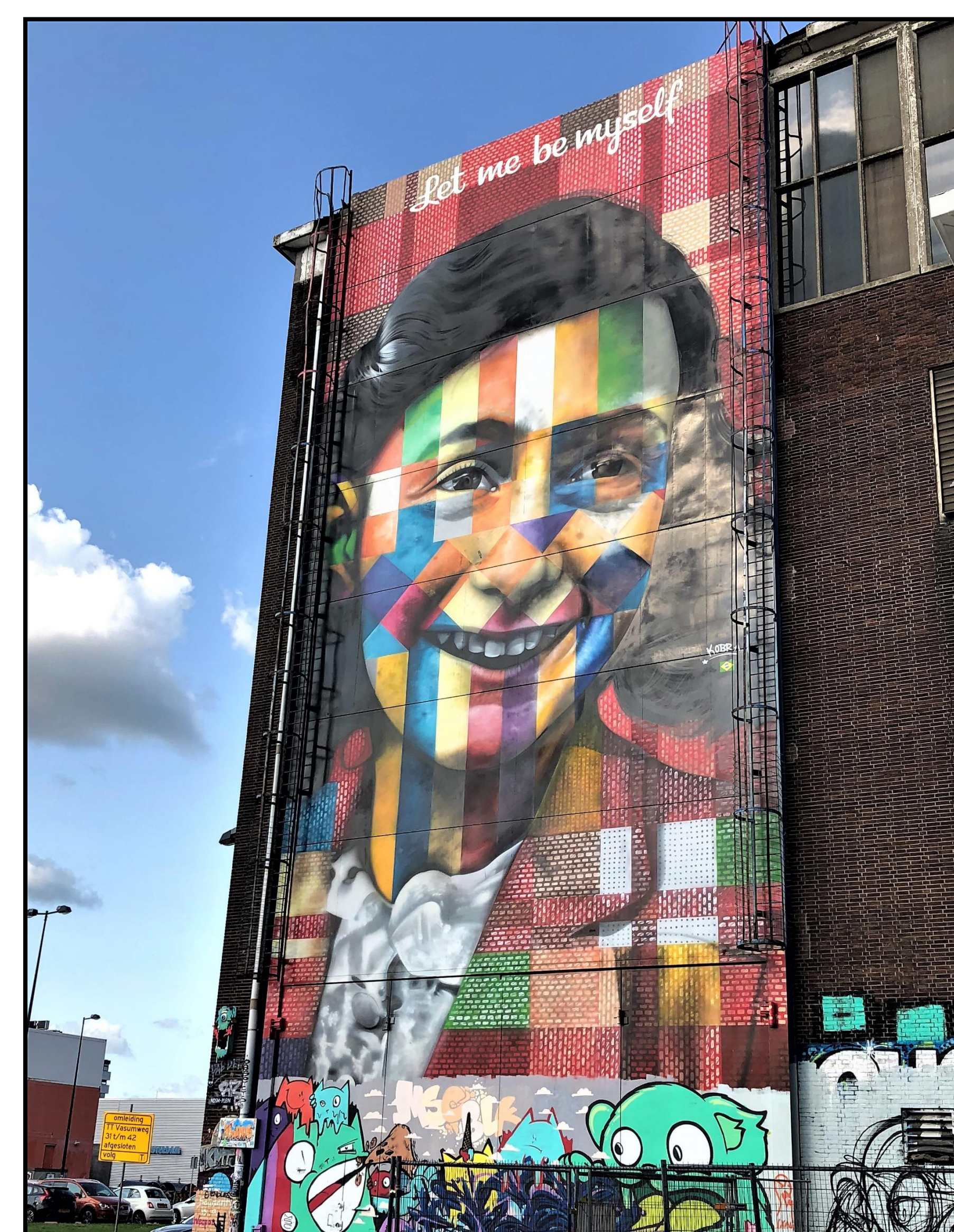
The NDSM neighborhood in Amsterdam Noord is known for its artsy vibe, evidenced by murals like the one above, titled "Let me be myself."