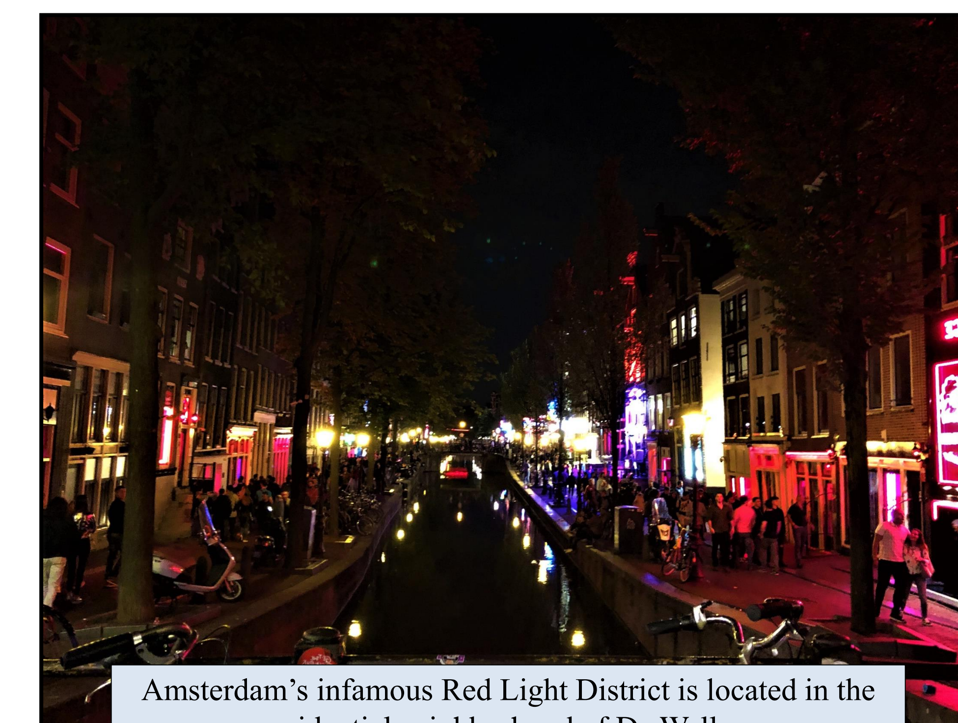
Amsterdam's infamous Red Light District is located in the residential neighborhood of De Wallen.

My passion for empowering women and girls who have experienced gender-based violence fueled my decision to obtain my Master of Social Work degree. Through this project, I gained valuable insight into the issue of sex trafficking and learned about sustainable intervention methods. I hope to continue working in community development upon graduation and I believe this global experience will supplement the work I've already done in this field.