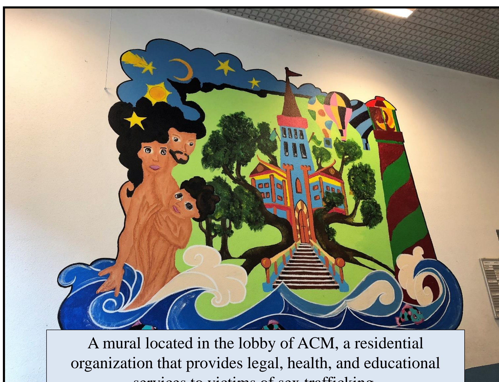
A mural located in the lobby of ACM, a residential organization that provides legal, health, and educational services to victims of sex trafficking.