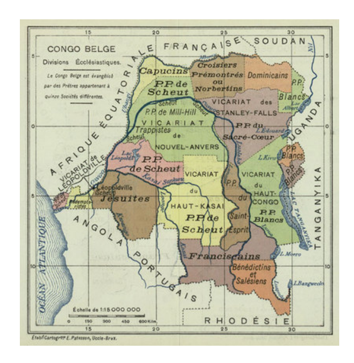
Fig 1. 2 "Belgian Congo Ecclesiastical Map" [The Dominican domain is in the top right quadrant of the image. It extended from the Uele River to south to the border of Sudan to north; and from 27^{0} to 30^{0} west.]

moral pedagogy the employed in the decades of their monopoly of children in both class and prison cell. In Niangara this critical gaze fell upon the work of the Dominican Order.