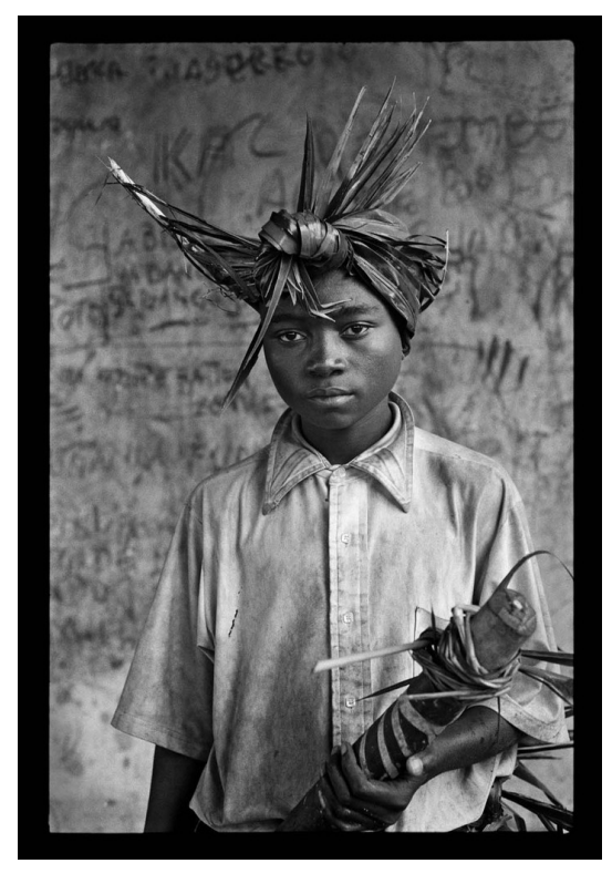
Figure 1.1 "Mai Mai Training Camp" Guy Tillim's portraits of mai-mai in a "training camp" in Beni in 2003. Tillim photographed at least thirty-one militia members in Beni. He posed these figures either staring directly at the camera or in three-quarters address. One print in the series is now in the permanent collection of the Museum of Modern Art (MoMA) in New York city.

From itineraries and provocations spurred by my memories and accounts and renditions like those described above, this dissertation sketches a deep history of links between power and vulnerability in eastern Congo for over one hundred years. It examines the recurrent emergence of mai-mai- like figures and movements throughout the 20<sup>th</sup> century in the eastern Great Lakes region. It connects the events of 1964 with those occurring in places like Beni at the turn of the 21<sup>st</sup> century, and in earlier periods, by grounding the analysis in interpretations of the mai medicine and its "therapeutic procedures," as well as the debates mai indexed, notably contestations over obligation, reciprocity, class, and intergenerational conflict. It questions