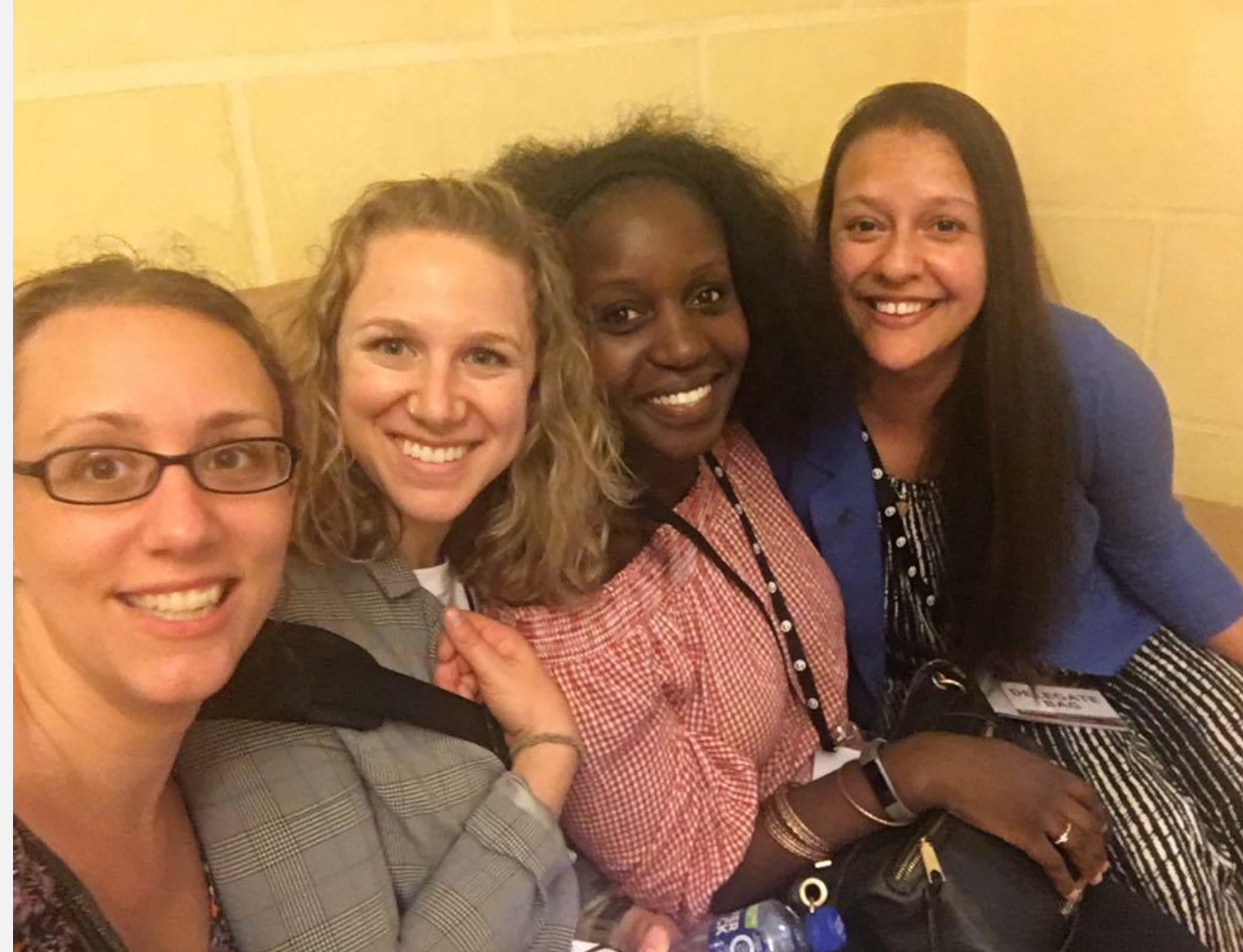
The photos here feature fellow UM SSW doctoral students at the conference and on a day trip to the Cliffs of Moher.