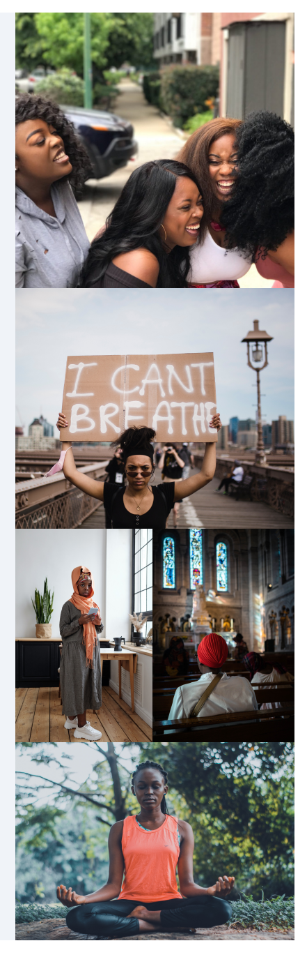
Figure 4. Recruitment Flyer

Please contact: urbanspiritualactivists@ gmail.com