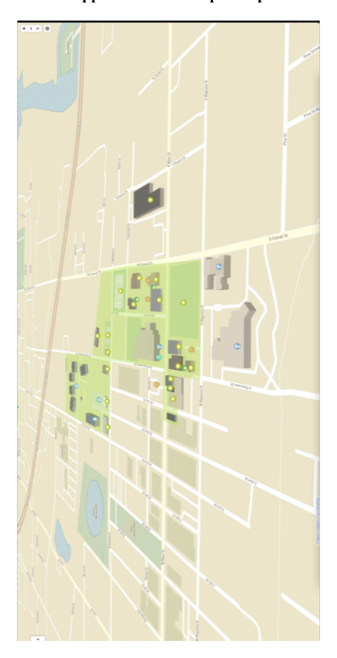
Figure 3. Example Map for Study 3