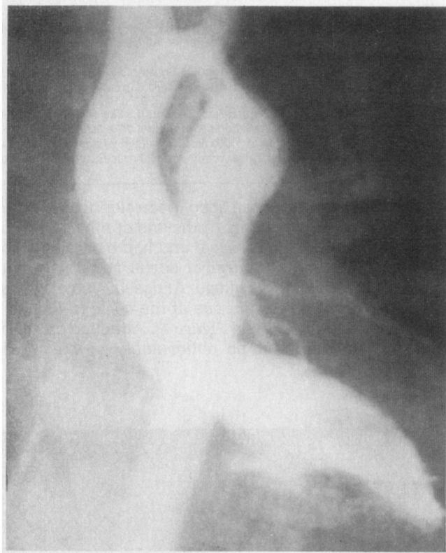
FIGURE 2. Anteroposterior left ventricular angiogram demonstrating an aortic aneurysm in a 3-year-old girl who underwent left subclavian angioplasty 21 months earlier (case 2).

A = anterior; CXR = chest x-ray; DS = descending; L = lateral; M = medial; P = posterior.