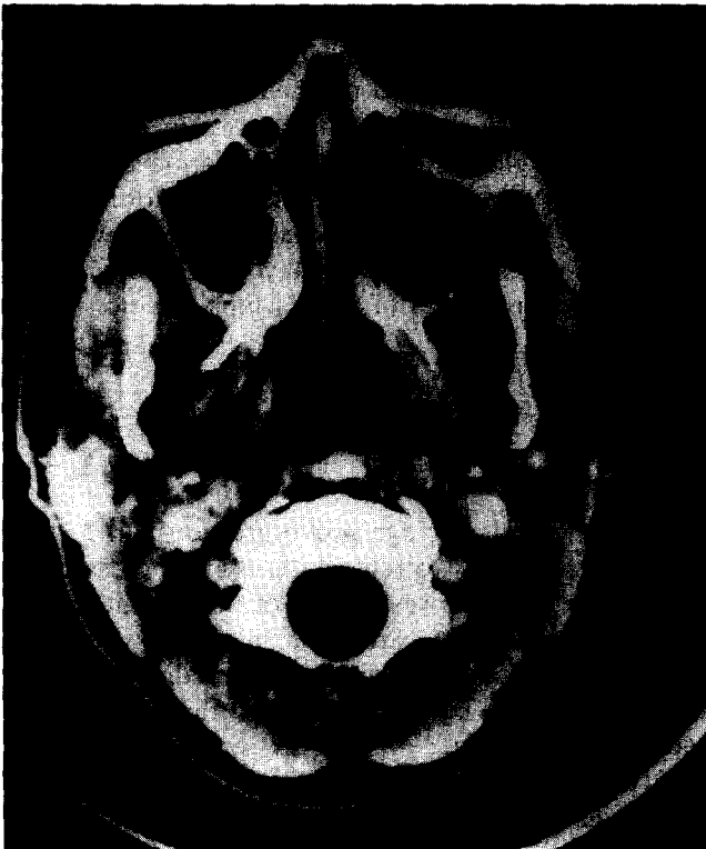
Fig. 1. A CAT scan of the parotid gland showed a zone of moderately increased attenuation in the lateral aspect of the superficial lobe of the right parotid gland which has poorly defined margins. There did not appear to be deep lobe involvement.

At the time of parotidectomy, the superficial lobe was noted to contain a 2 × 2 cm lesion, microscopically confirmed to be low grade mucoepidermoid carcinoma