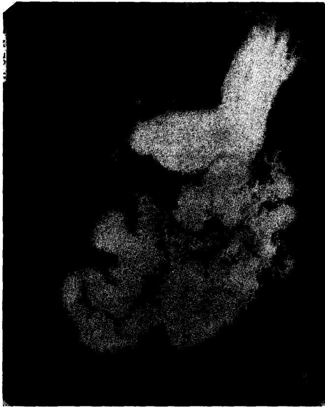
FIG. 1. Case XI. Roentgenogram showing the communication between the stomach and the transverse colon. Film was taken about ten minutes after ingestion of barium. Note the extensive filling of the small bowel. At fluoroscopy a loop of jejunum was easily visualized between the stomach and the colon.

these two operations. That is, by using the above methods to divert the secretions which neutralize gastric juice, they con-