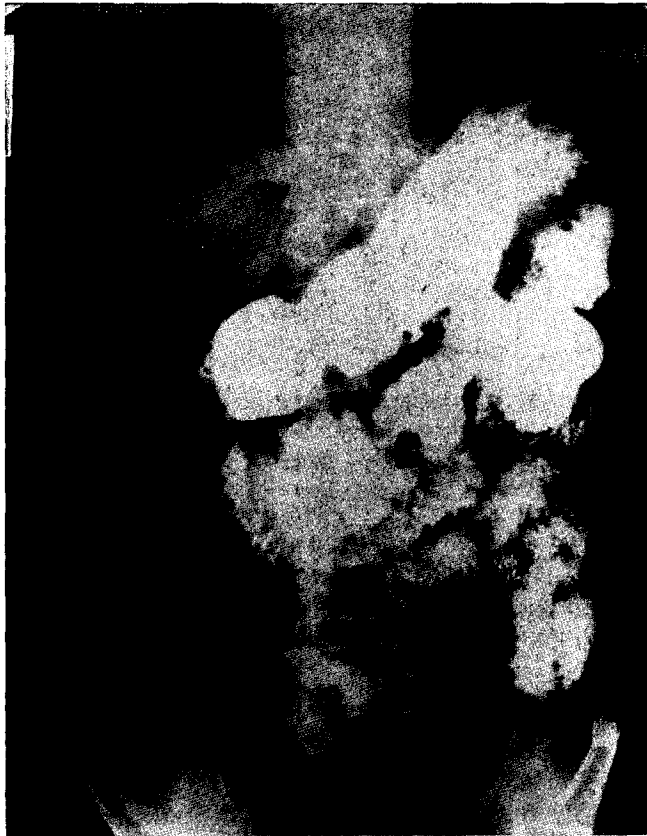
FIG. 3. Case XIV. Film taken immediately after the ingestion of barium. The gastrojejunal fistula is clearly shown. Note the extensive filling of the transverse colon.

of jejunal ulcer at autopsy. There were only three jejunal ulcers in a group of forty-one patients who had died from ten than anterior, gastroenterostomy. This is unfortunate from the technical standpoint, for with the short loop used in the posterior