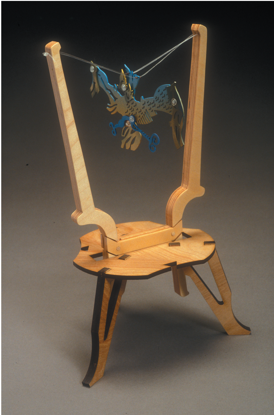
Fig. 8 - Transpinner : Owl | Mixed Media | 15" x 7" x 7" | 2005