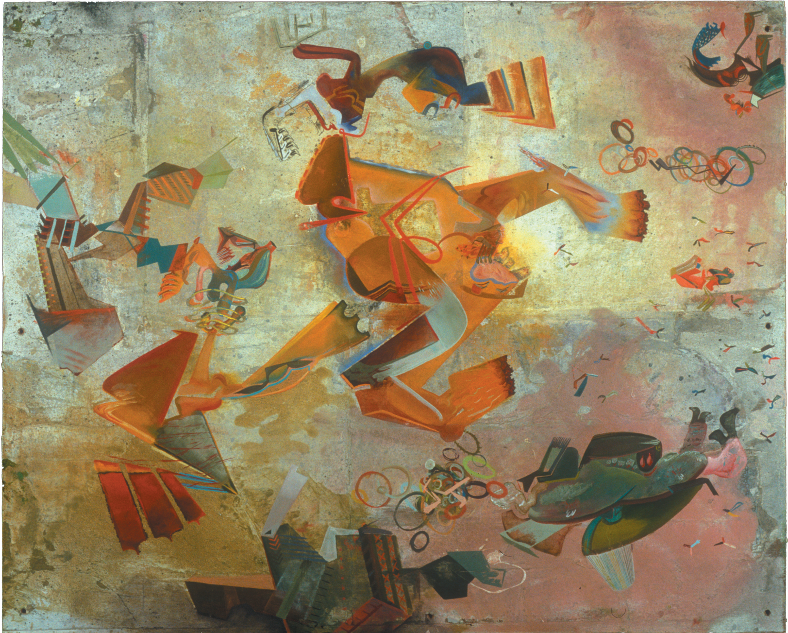
Fig. 22 - To Save The Crystal Warrior I | Oil on Paper on Panel | 35" x 43" | 2004