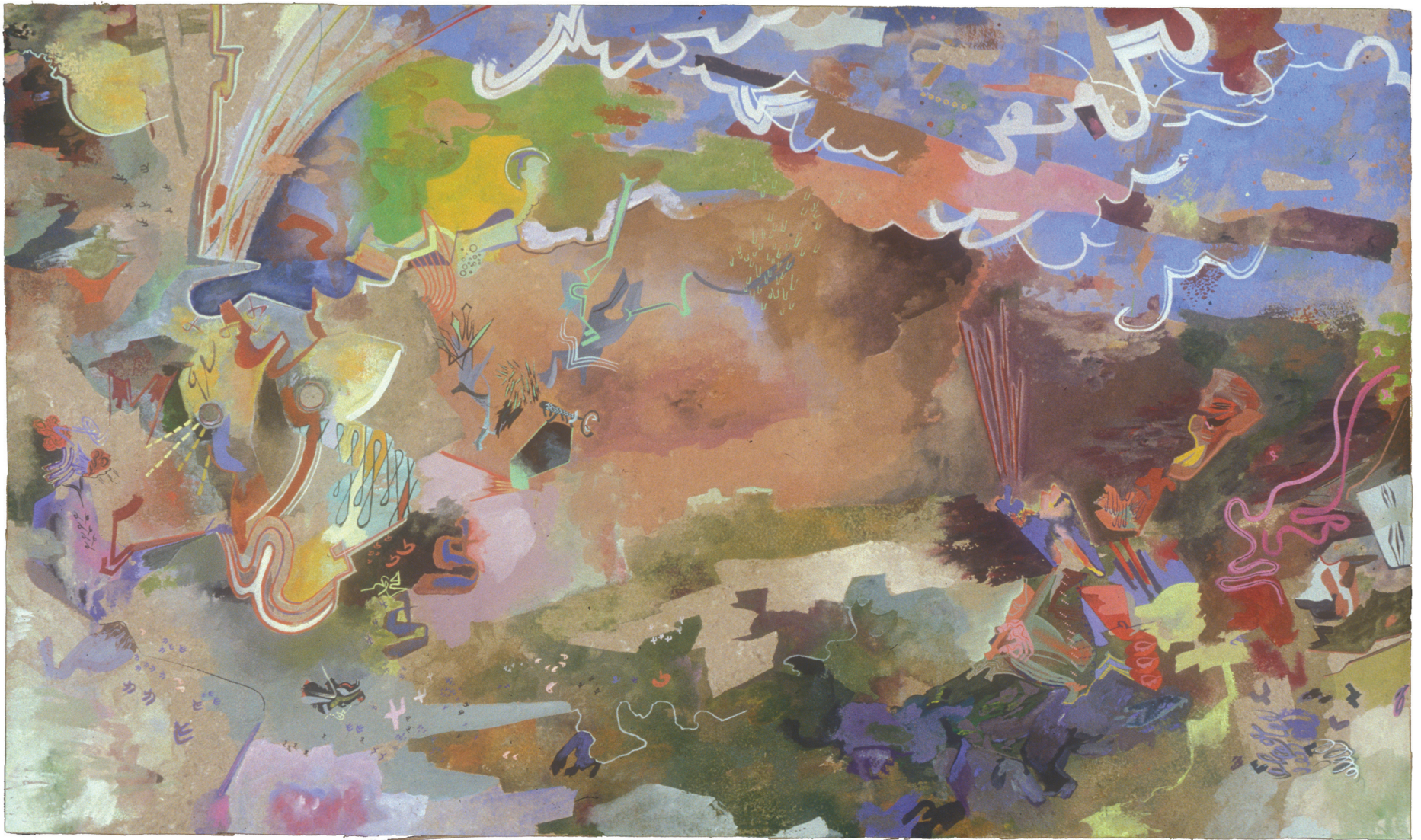
Fig. 27 - The Selroc Cycle II | Casein on Paper on Panel | 22" x 37" | 2006