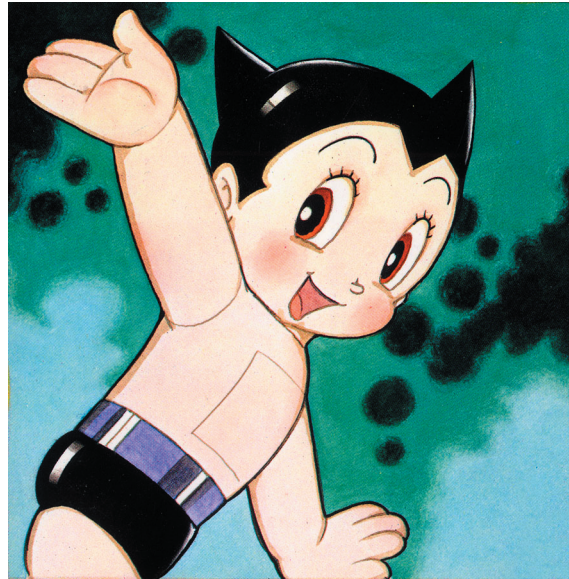
Fig. 14 - Astro Boy , by Osamu Tezuka