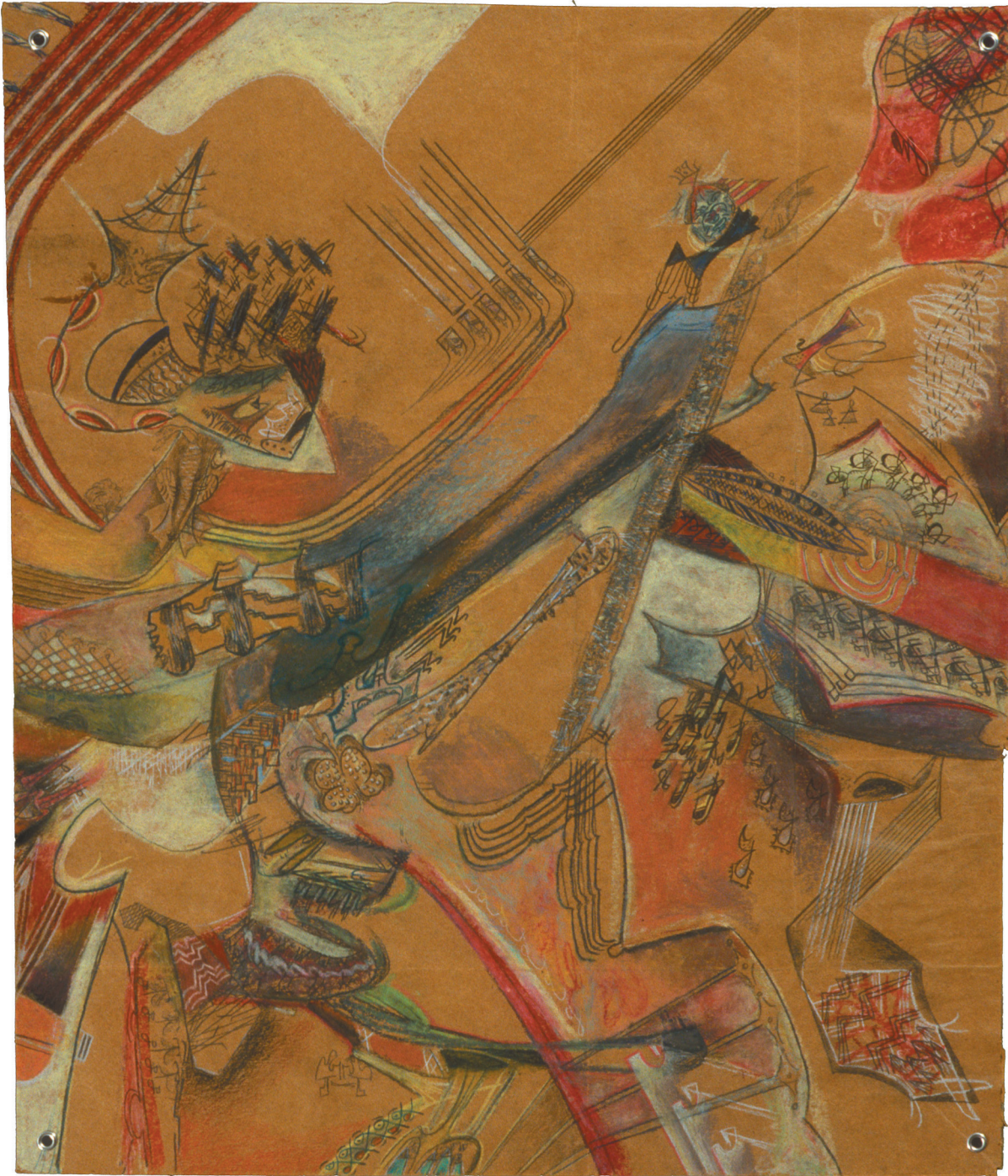
Fig. 18 - Dead Reckoning I | Mixed Media | 19" x 16" | 2003