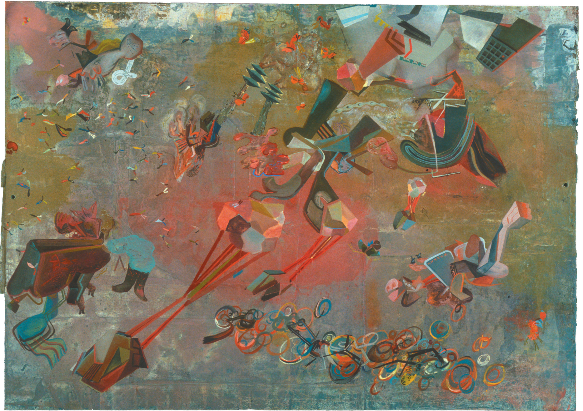
Fig. 24 - To Save The Crystal Warrior III | Oil on Paper on Panel | 35" x 48" | 2004