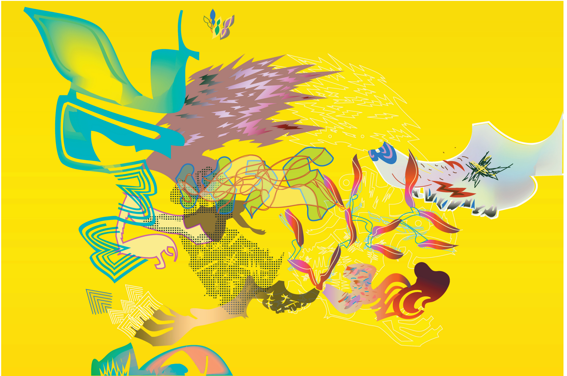
Fig. 2 - TransSkunk | Digital Drawing | Dimensions Variable | 2005