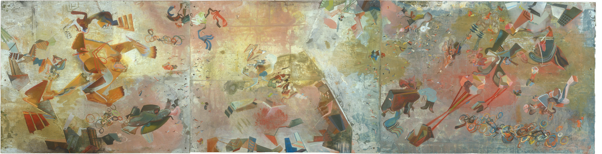
Fig. 21 - To Save The Crystal Warrior | Oil on Paper on Panel | 35" x 133" | 2004