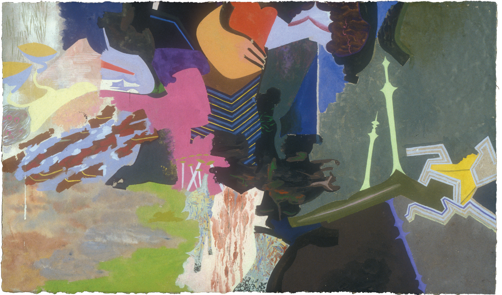
Fig. 34 - The Selroc Cycle IX | Casein on Paper on Panel | 22" x 37" | 2006