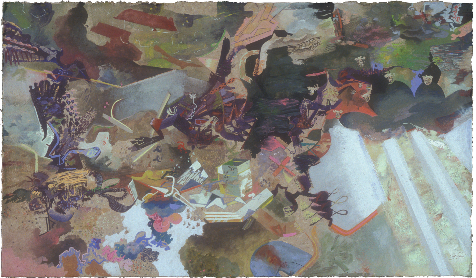
Fig. 26 - The Selroc Cycle I | Casein on Paper on Panel | 22" x 37" | 2006