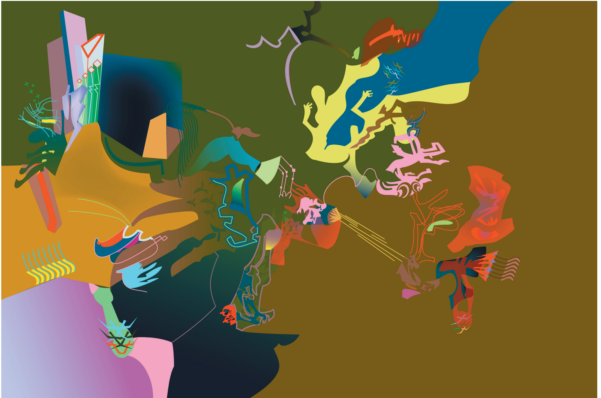
Fig. 3 - TransBlacksnake | Digital Drawing | Dimensions Variable | 2005