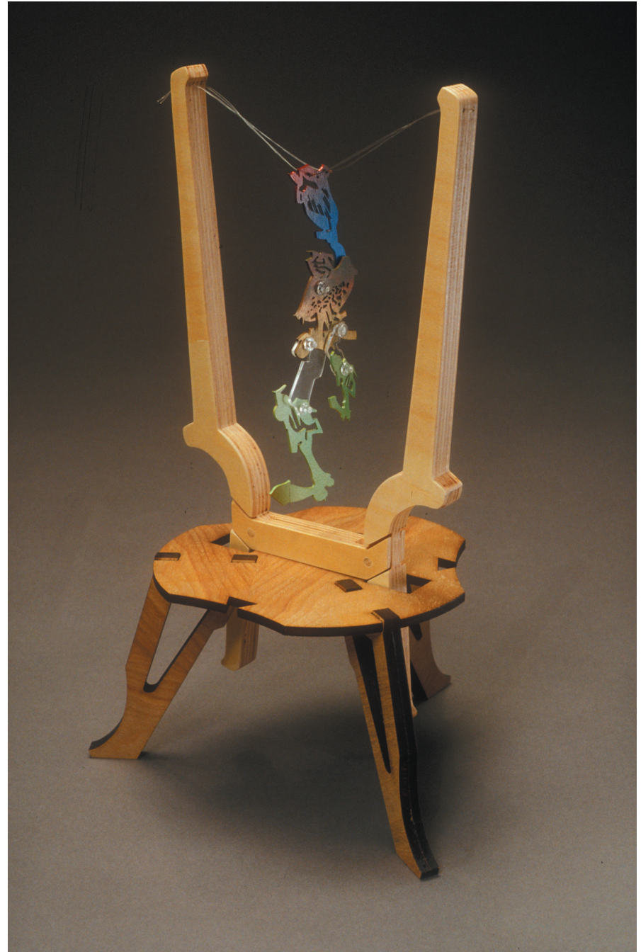
Fig. 9 - Transpinner : Selroc II | Mixed Media | 15" x 7" x 7" | 2005