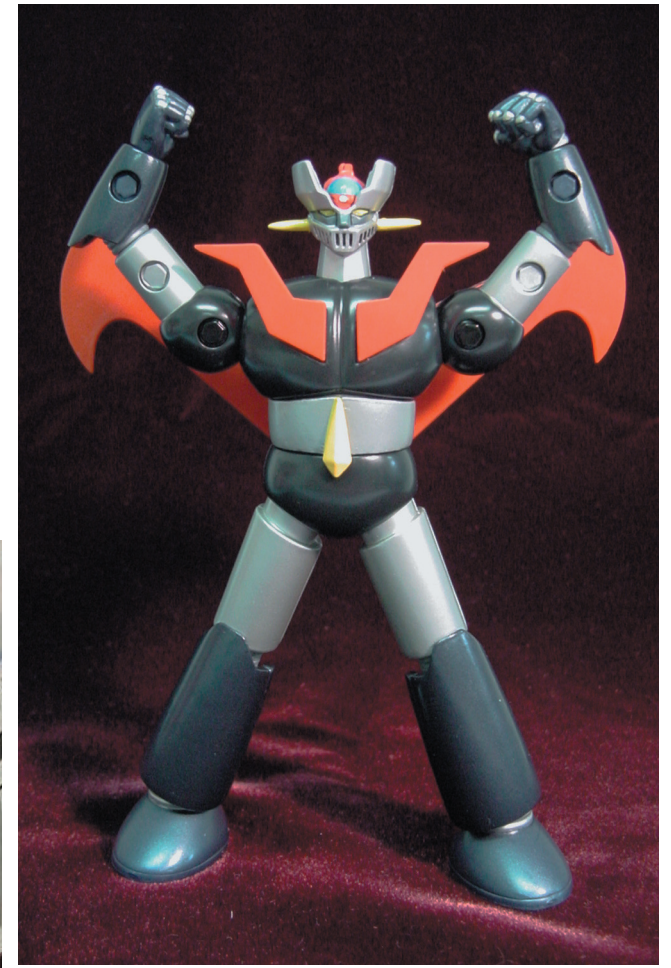
Fig. 16 - Mazinger-Z , by Go Nagai