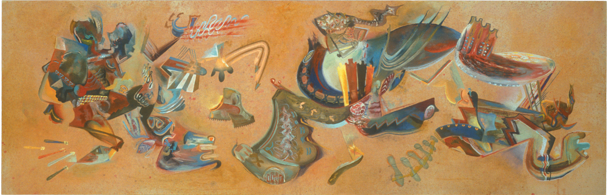
Fig. 17 - The Kentuckian | Oil on Panel | 15" x 49" | 2004