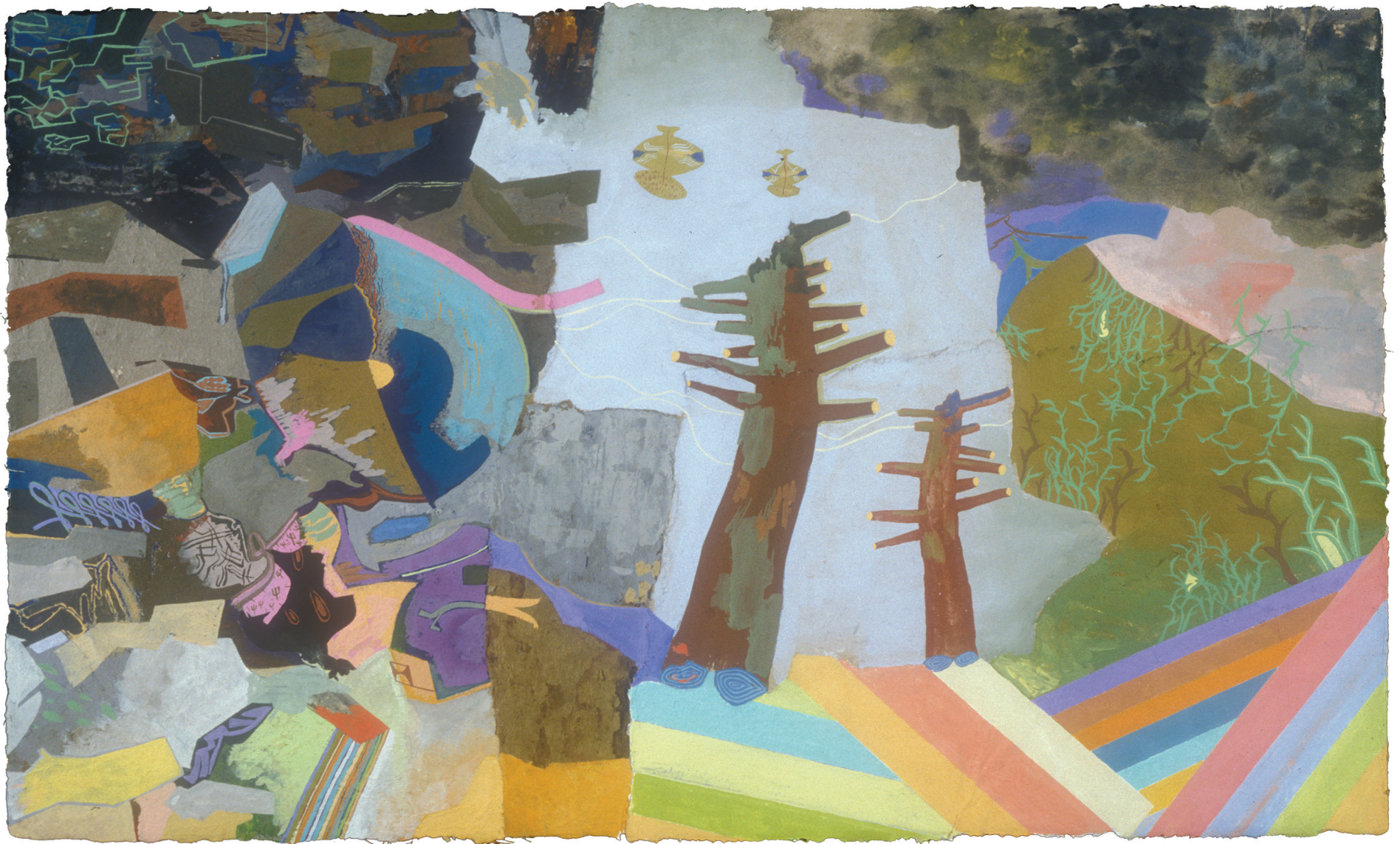
Fig. 32 - The Selroc Cycle VII | Casein on Paper on Panel | 22" x 37" | 2006