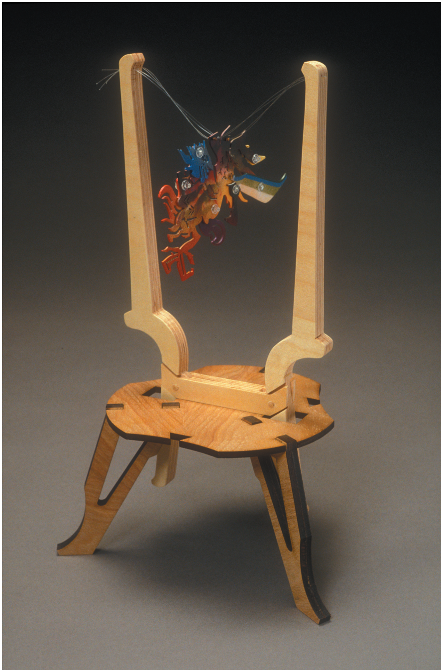
Fig. 10 - Transpinner : Rooster | Mixed Media | 15" x 7" x 7" | 2005