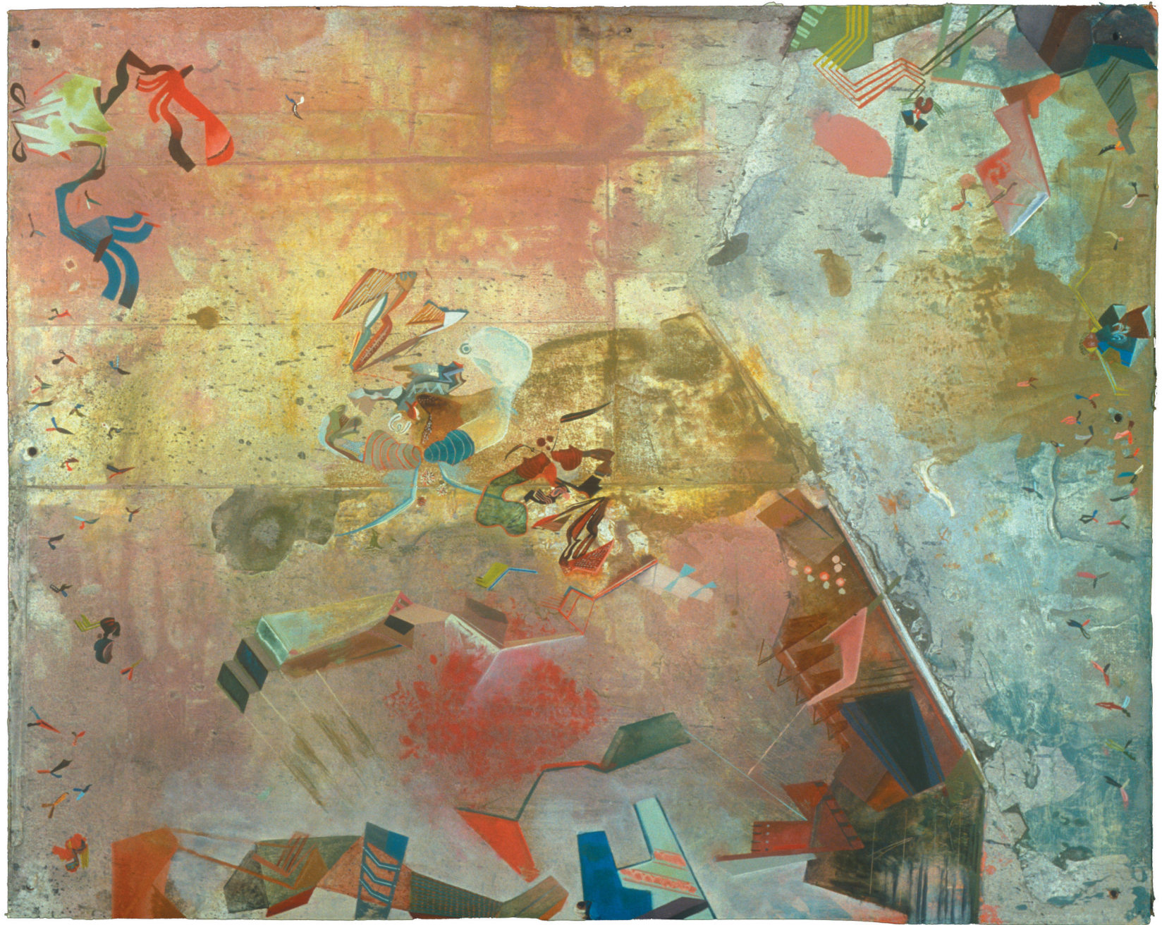
Fig. 23 - To Save The Crystal Warrior II | Oil on Paper on Panel | 35" x 42" | 2004