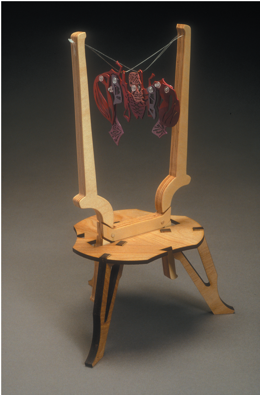
Fig. 6 - Transpinner : Bat | Mixed Media | 15" x 7" x 7" | 2005