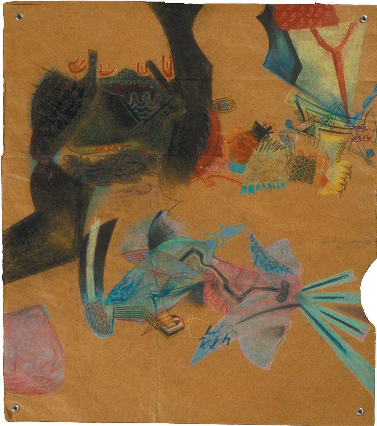
Fig. 20 - Dead Reckoning III | Mixed Media | 19" x 16" | 2003