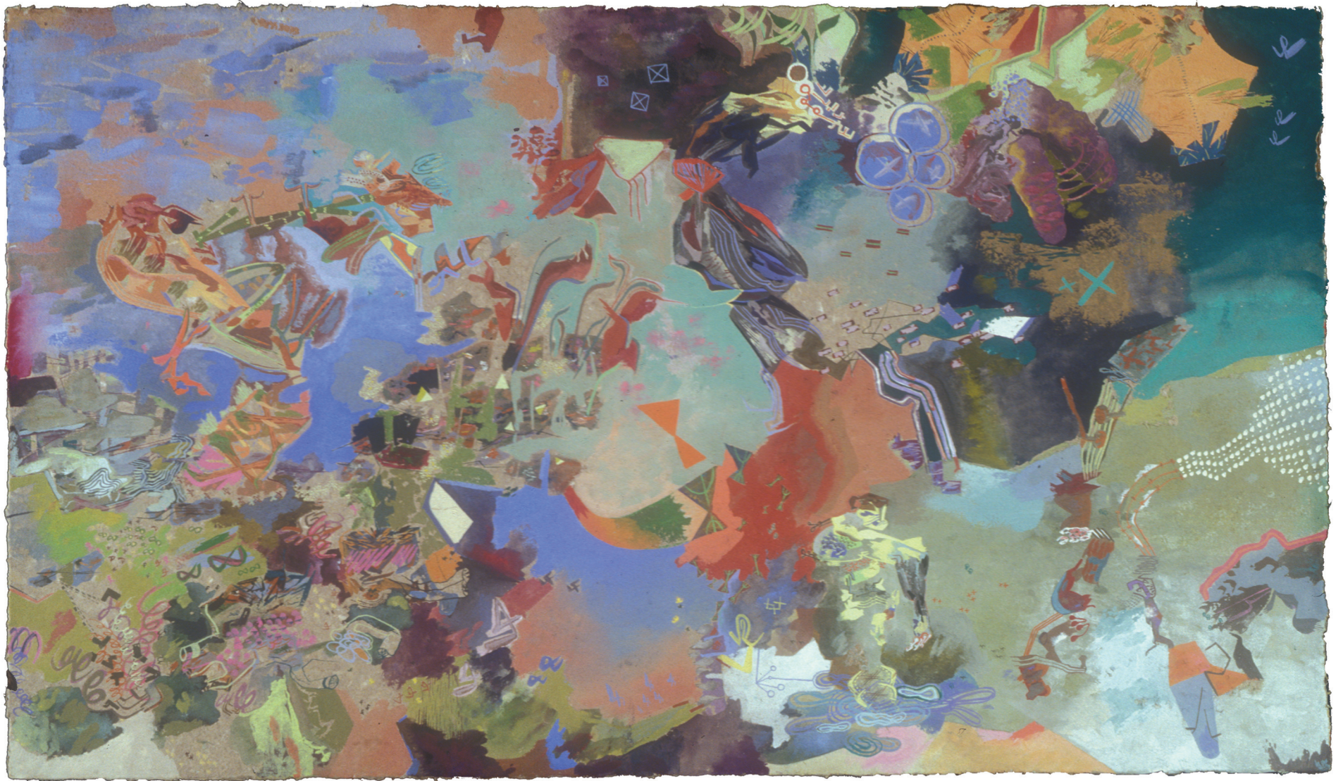
Fig. 28 - The Selroc Cycle III | Casein on Paper on Panel | 22" x 37" | 2006