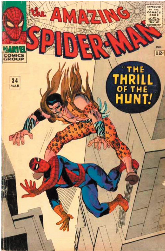
Fig. 13 - Spider-Man , by Steve Ditko and Stan Lee, from "Amazing Spider-Man" no. 34, published by Marvel Comics.