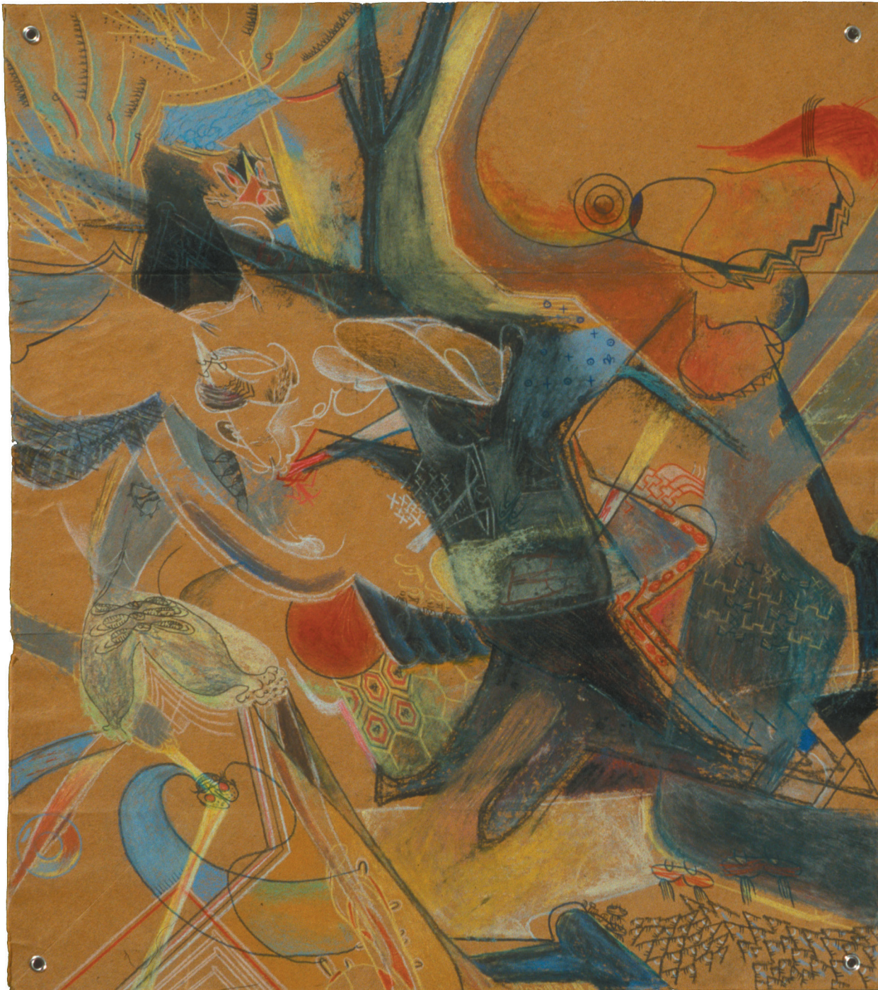
Fig. 19 - Dead Reckoning II | Mixed Media | 19" x 16" | 2003