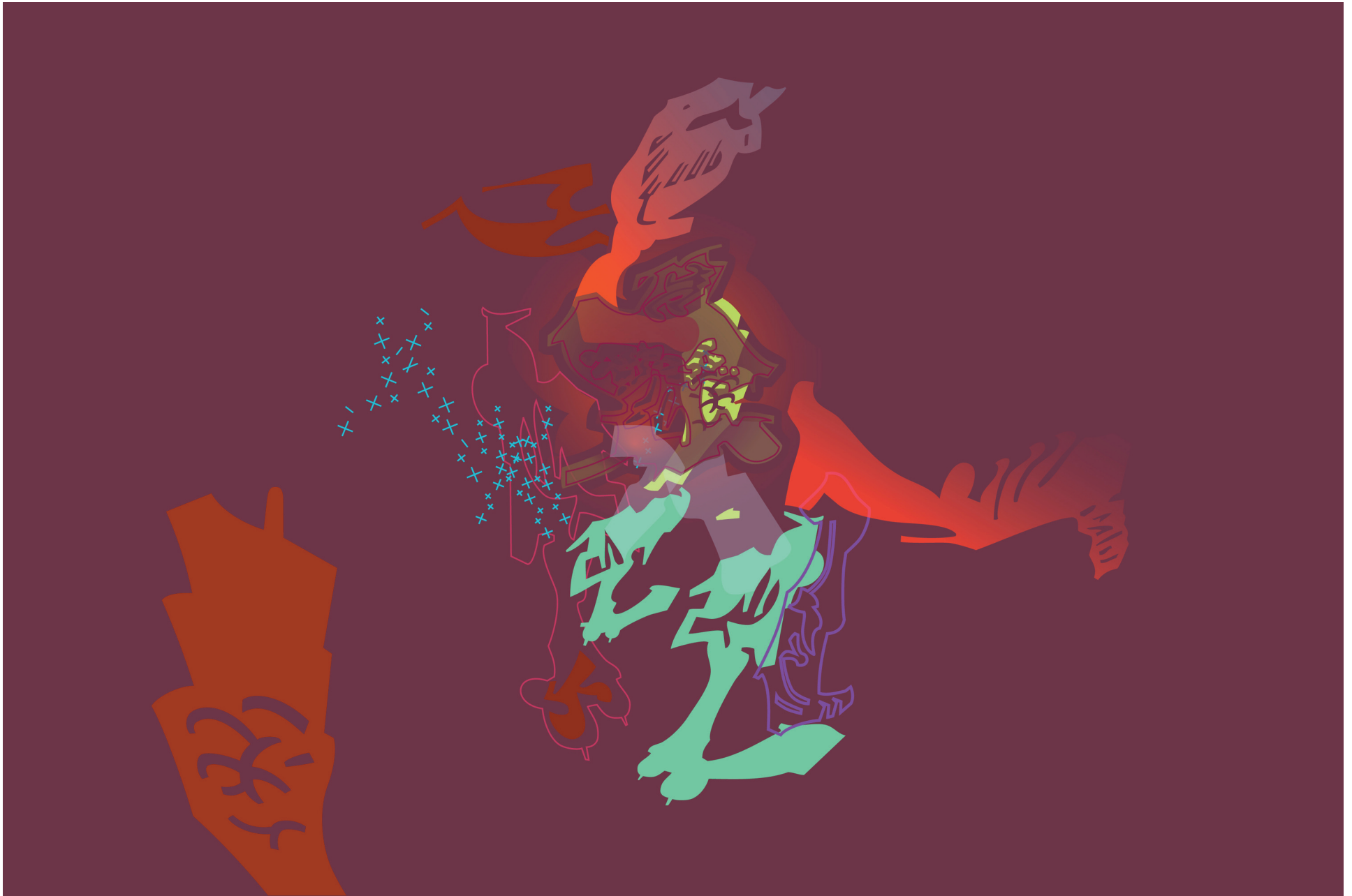
Fig. I - TransSelroc | Digital Drawing | Dimensions Variable | 2005