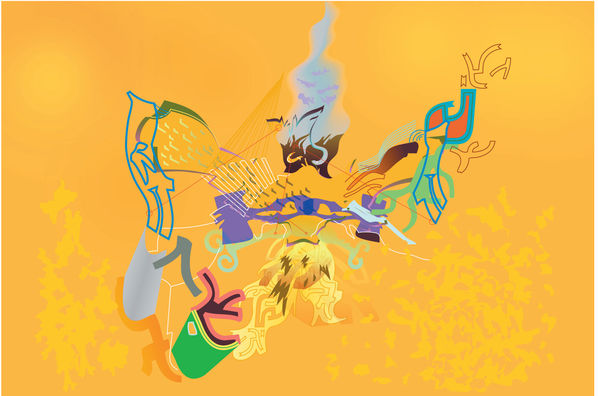
Fig. 5 - TransOwl | Digital Drawing | Dimensions Variable | 2005