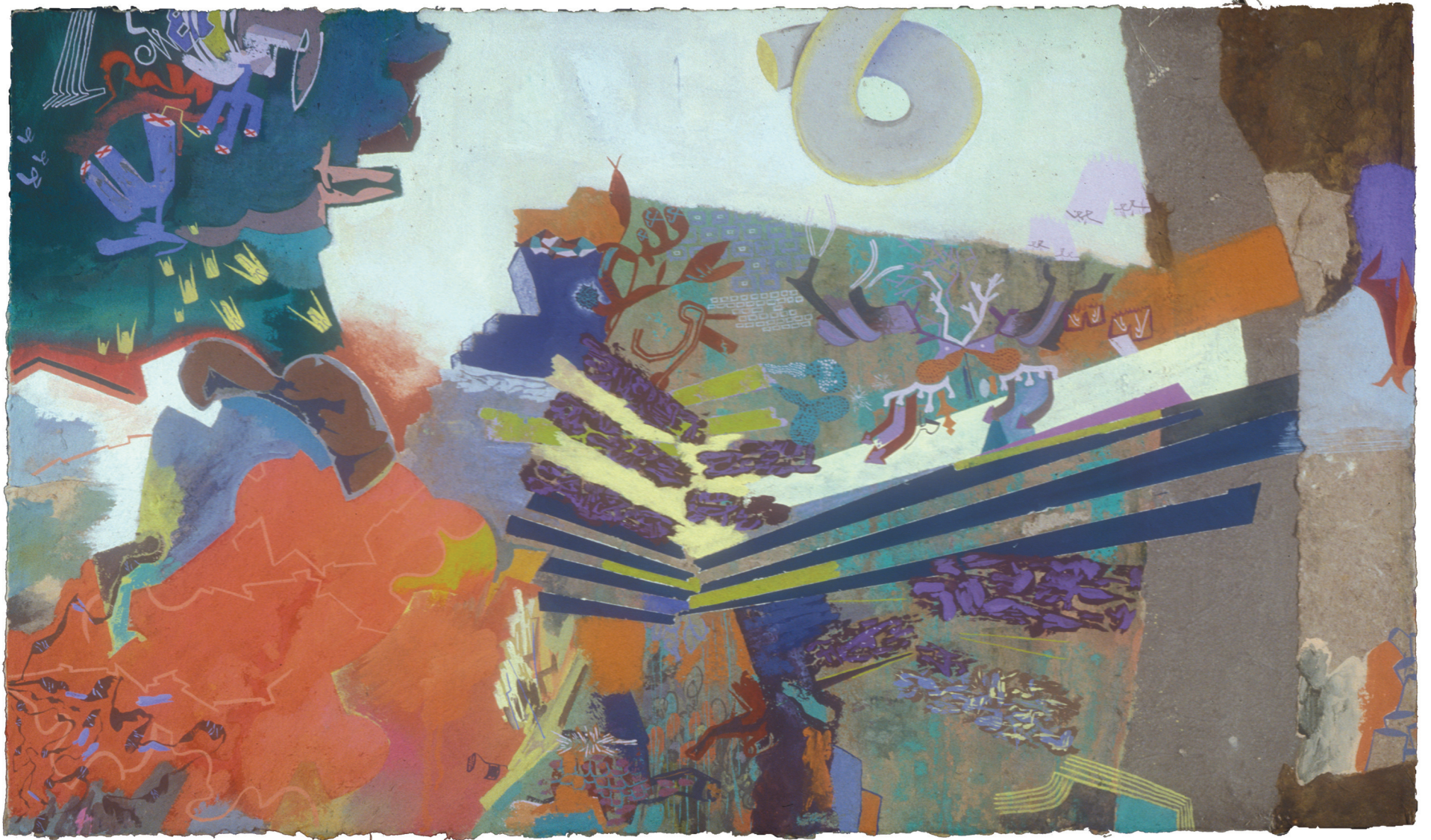
Fig. 29 - The Selroc Cycle IV | Casein on Paper on Panel | 22" x 37" | 2006