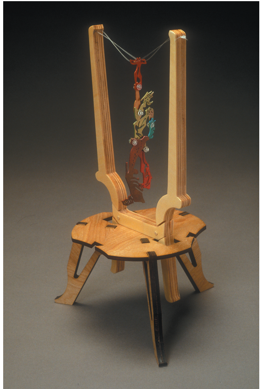
Fig. 7 - Transpinner : Blacksnake | Mixed Media | 15" x 7" x 7" | 2005