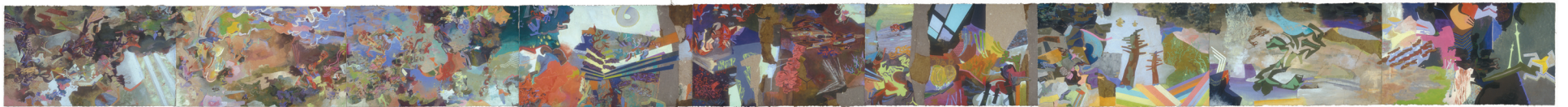
Fig. 25 - The Selroc Cycle | Casein on Paper on Panel | 22" x 333" | 2006