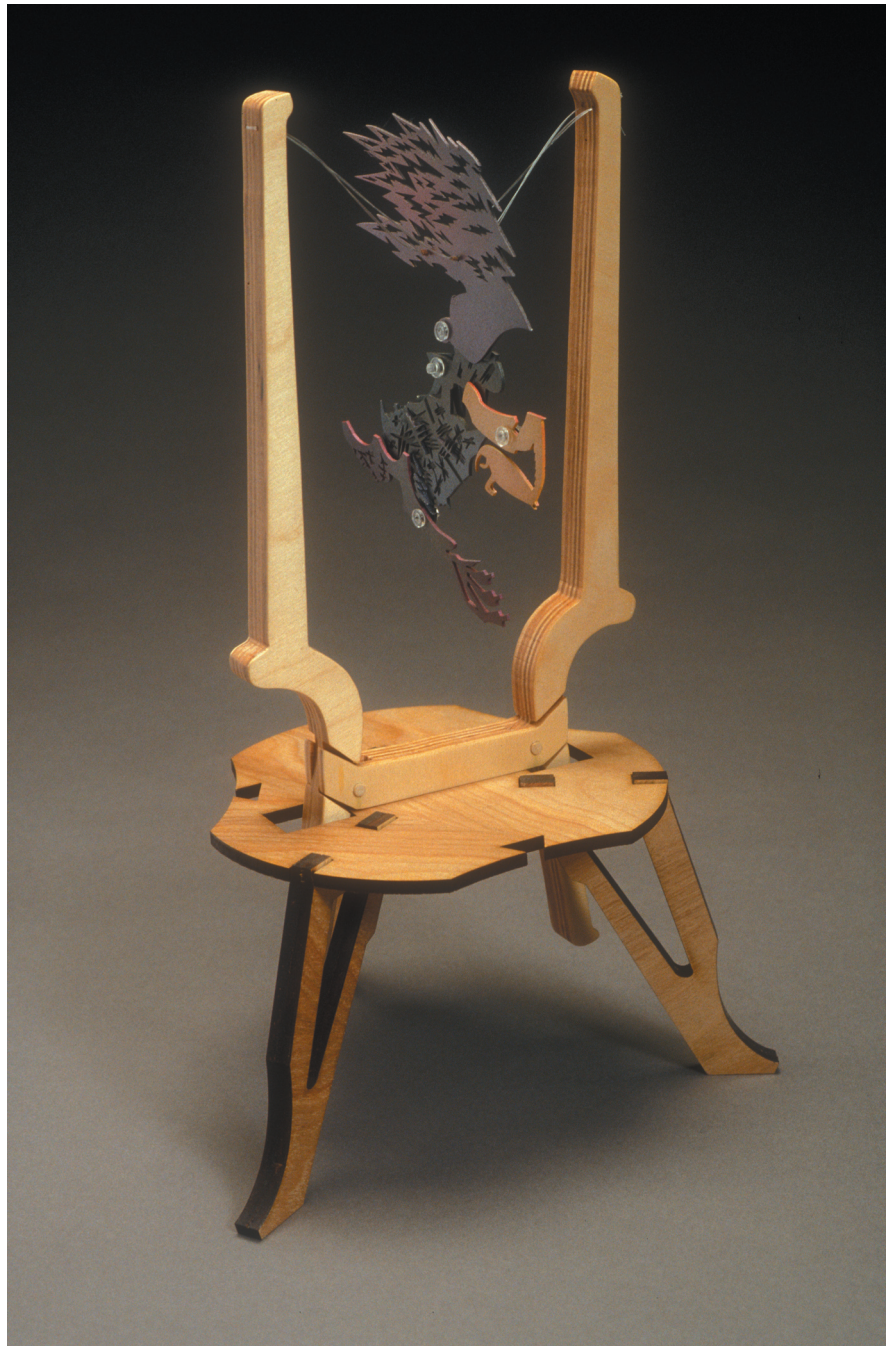
Fig. 12 - Transpinner : Skunk | Mixed Media | 15" x 7" x 7" | 2005