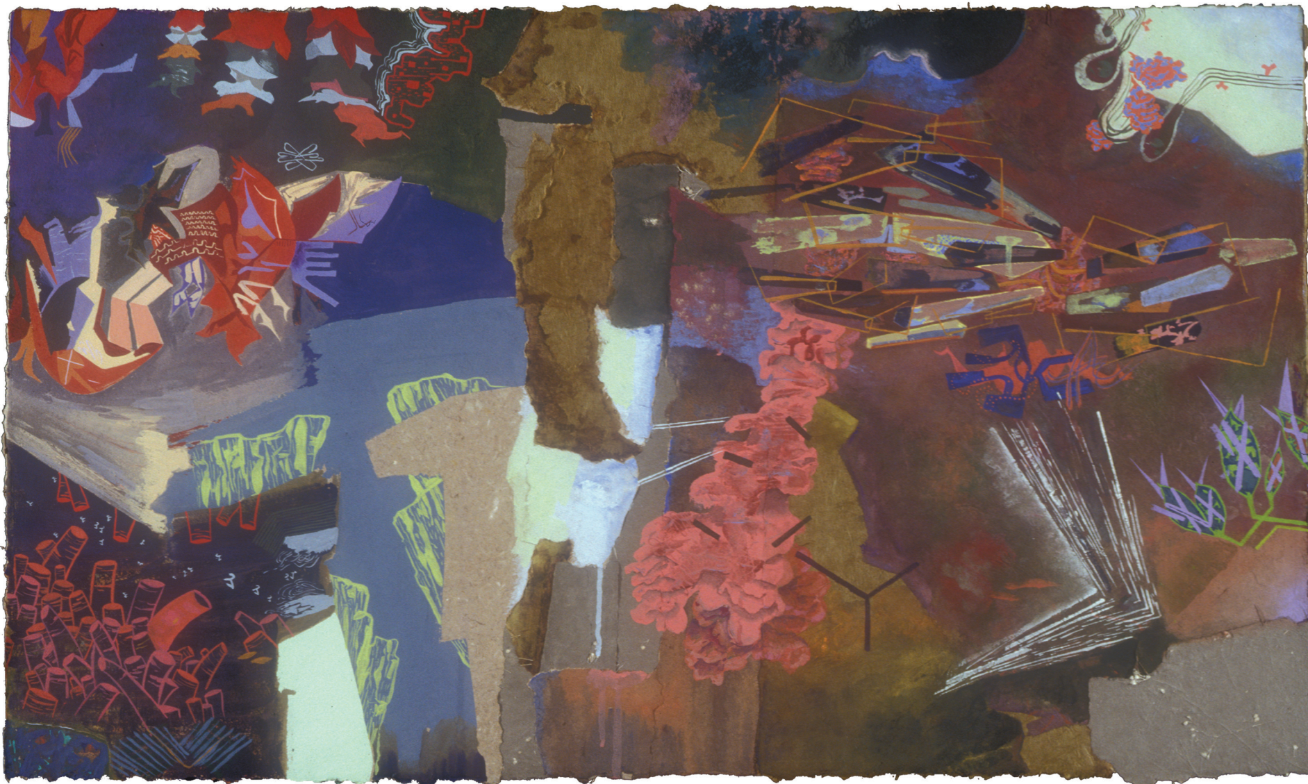
Fig. 30 - The Selroc Cycle V | Casein on Paper on Panel | 22" x 37" | 2006