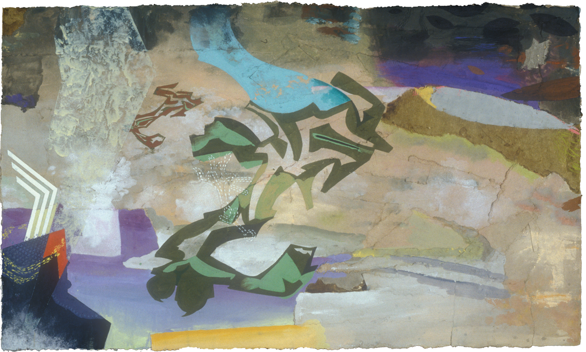
Fig. 33 - The Selroc Cycle VIII | Casein on Paper on Panel | 22" x 37" | 2006