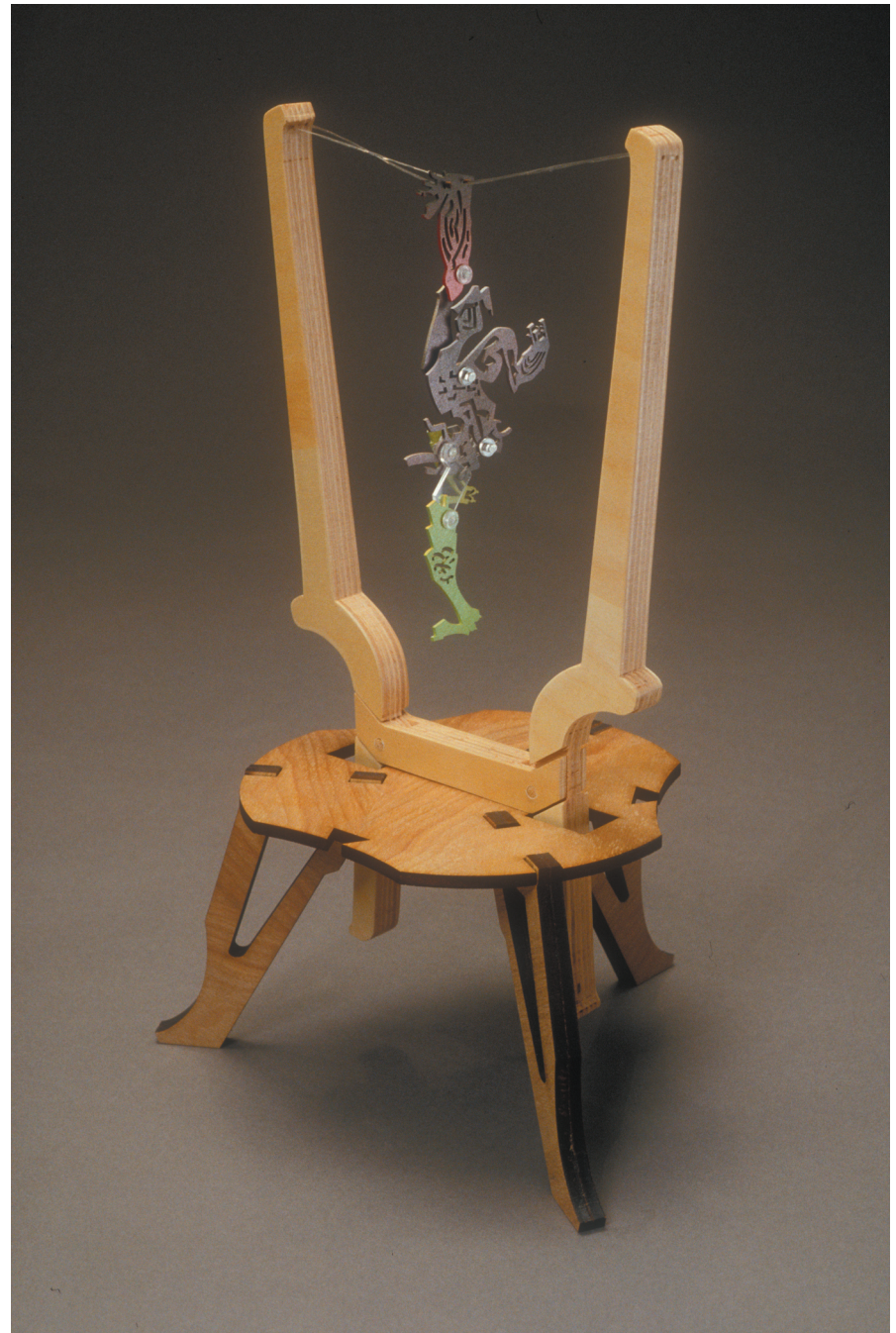
Fig. 11 - Transpinner : Selroc I | Mixed Media | 15" x 7" x 7" | 2005