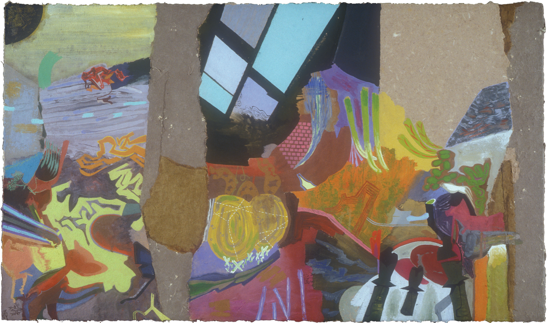
Fig. 31 - The Selroc Cycle VI | Casein on Paper on Panel | 22'' x 37'' | 2006