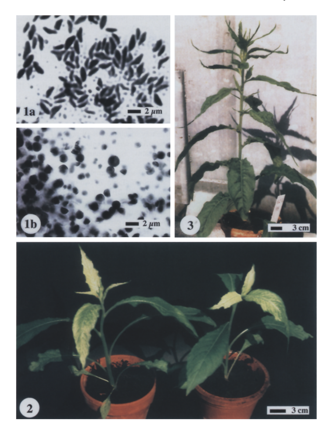
Fig. 1. Oenothera starch grains. a B-III pollen, b B-IV pollen. – Fig. 2. Oenothera BB-IV plants showing the virescens type of chloroplast deficiency. – Fig. 3. Oenothera BB-IV plant of strain Stockton 1 with an irregular contour of the upper leaves

becomes possible to compare the BB-IV plants with the original O. grandiflora strain with regard to phenotypic differences. This proved worthwhile especially for chloroplast development. Namely, in several of the strains a bleaching called virescens (Fig. 2) occurs similar to that known in the combination AA-III