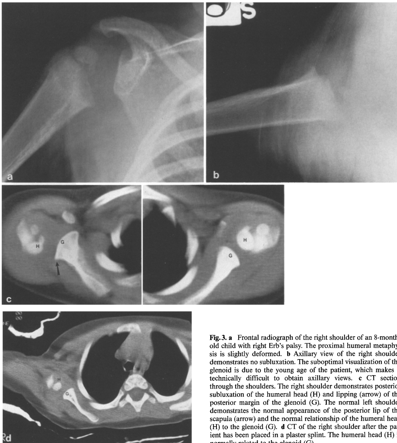
Fig. 3. a Frontal radiograph of the right shoulder of an 8-month-old child with right Erb's palsy. The proximal humeral metaphysis is slightly deformed. b Axillary view of the right shoulder demonstrates no subluxation. The suboptimal visualization of the glenoid is due to the young age of the patient, which makes it technically difficult to obtain axillary views. c CT section through the shoulders. The right shoulder demonstrates posterior subluxation of the humeral head (H) and lipping (arrow) of the posterior margin of the glenoid (G). The normal left shoulder demonstrates the normal appearance of the posterior lip of the scapula (arrow) and the normal relationship of the humeral head (H) to the glenoid (G). d CT of the right shoulder after the patient has been placed in a plaster splint. The humeral head (H) is normally related to the glenoid (G)