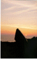
"Sunrise at Campobello"