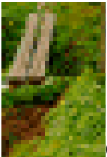
On the SunSweep Trail; 1 km path from parking area to sculpture.