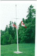
Flags of the Campobello International Park