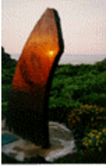
SunSweep, Campobello International Park