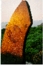
Arch is made of etched Canadian granite