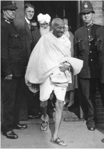
Figure 1 | Winners don't punish. Mahatma Gandhi is a prime example of the maxim that Dreber et al. establish in their social-dilemma games 6 : that those who do not punish come out on top in societal interactions.

A strategy that emerges is 'tit-for-tat' 7 : players begin cooperatively, and then copy their partner's last move, cooperating with cooperators and defecting with defectors — thus avoiding being the sucker.