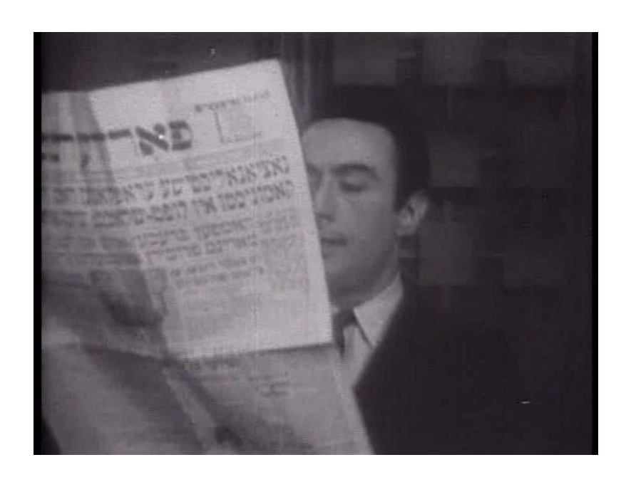
Figure 2.2. Lenny Bruce using the Forverts as a prop on "The Steve Allen Show."

audience roared.<sup>215</sup> His implication was, of course, that in Jewish circles, his art met no resistance—an exaggeration, certainly, but not one without a hint of truth to it.