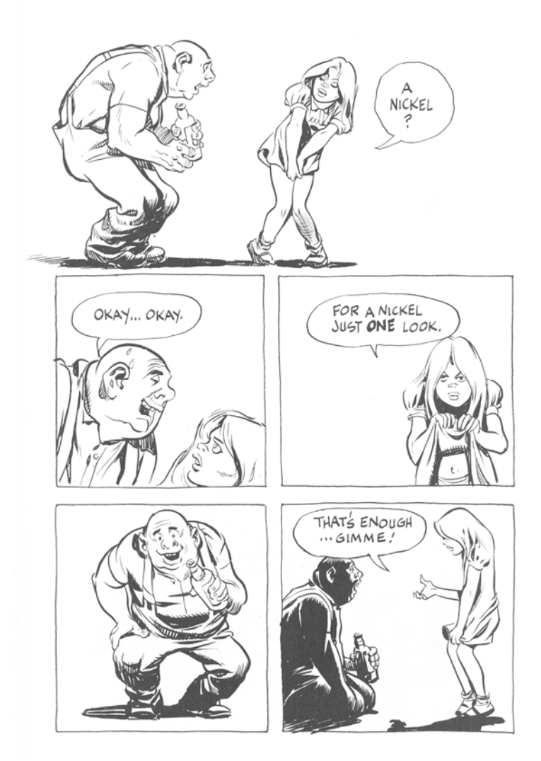
Figure 5.6. Detail from Contract (111).

A similar dynamic obtains in "Cookalein," in which one of Eisner's youngest characters asks another, "Wanna watch the grown-ups doin' dirty things?" (167), one of the clearest references to Eisner's concern with the relations between children, adults, and obscenity. Throughout "Cookalein," the spectators of " dirty things" encounter highly disturbing images rather than the erotic or arousing ones they may expect. Instead of a titillating display of adult coupling, the two young children who spy on "grown-ups"