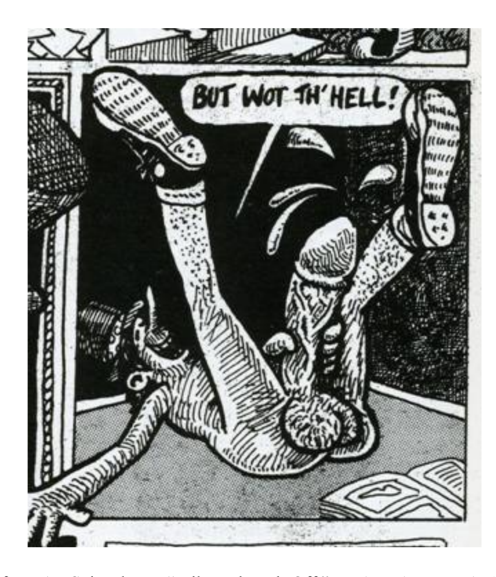
Figure 5.2. Detail from Art Spiegelman, "Jolly Jack Jack-Off," Gothic Blimp Works #7 (1969). Reprinted in Rosenkranz, 104.