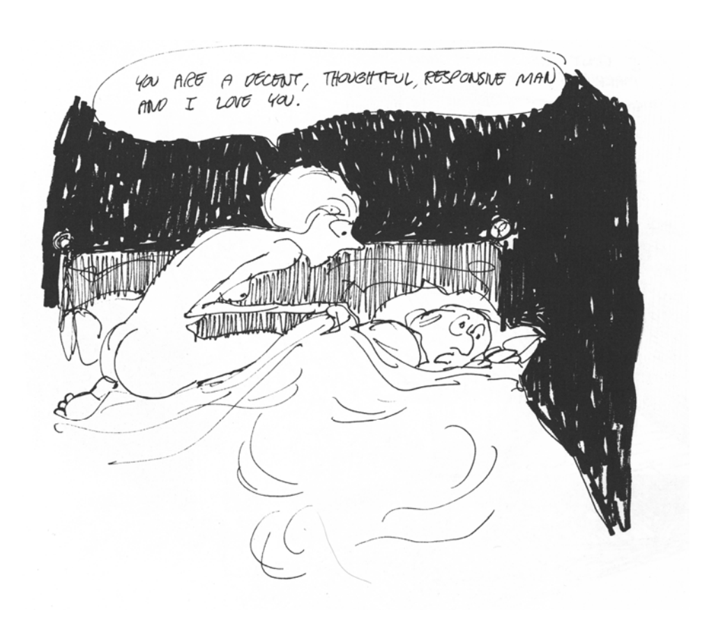
Figure 5.4. Detail from Jules Feiffer, Tantrum (7).

gazing distractedly at the exaggerated curves of a secretary's clothed body (5). Though the panel's emphasis on her breasts, waist, and buttocks suggests Leo's desire, that desire is at best ambivalent (Leo muses, "No danger, no mystery"), and it is in any case associated with the fully-clothed, non-obscene female form. Two pages later, Feiffer depicts Leo's wife Carol in their bed naked, a nipple and the cleavage of her buttocks clearly delineated (see figure 5.4). In this panel, Carol reaches out to Leo lovingly while he cowers, turned away from her, his eyes wild and unfocused. Feiffer's illustration of Carol's naked body does not function as titillation for Leo or for the reader—indeed, her bare breast and nipple disturbingly echo, in size and shape, her unmet eye—but rather signals Leo's isolation and inability to derive sexual satisfaction from his marriage.