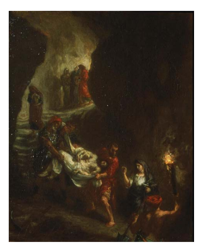
Figure 3: Eugène Delacroix, Descent into the Tomb, 1859