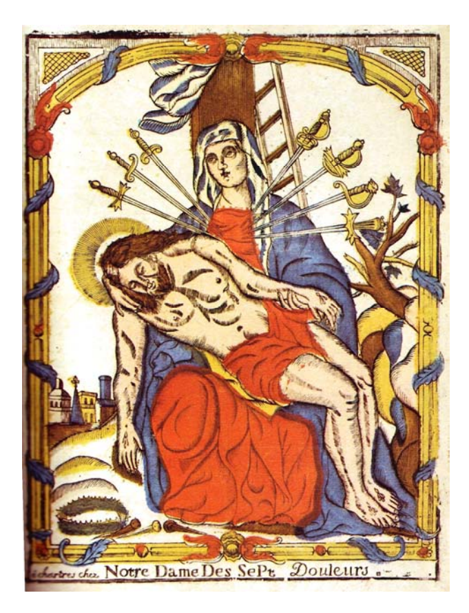
Figure 4: Chartres Cathedral, Jesus in the Arms of Mary, 1830