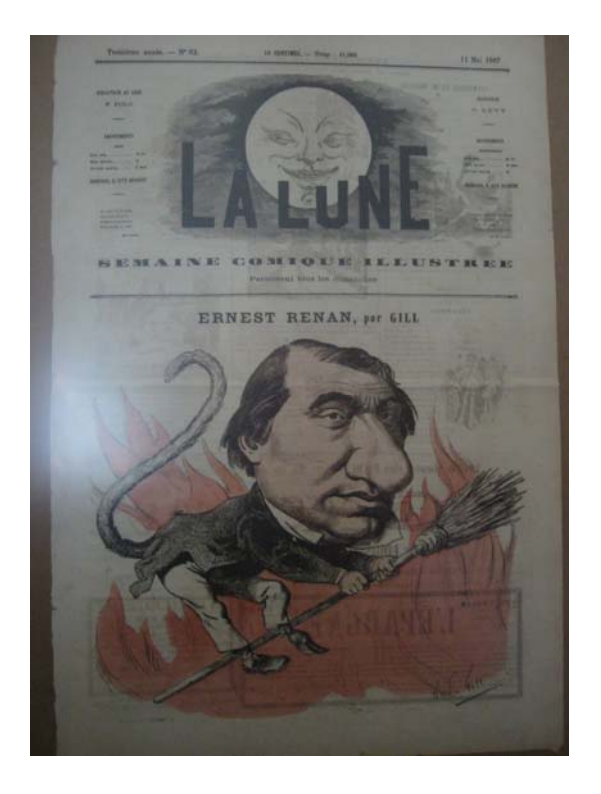
Figure 15: Andres Gill, Ernest Renan, par Gill from La Lune, 1867