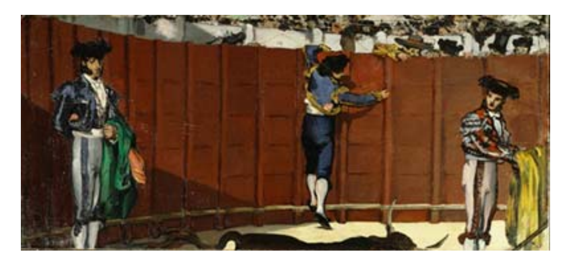
Figure 7: Detail, Manet's The Incident at the Bull Ring, 1864