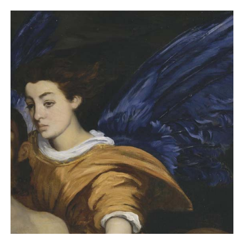
Figure 10: Detail, Manet's Dead Christ with Angels, 1864