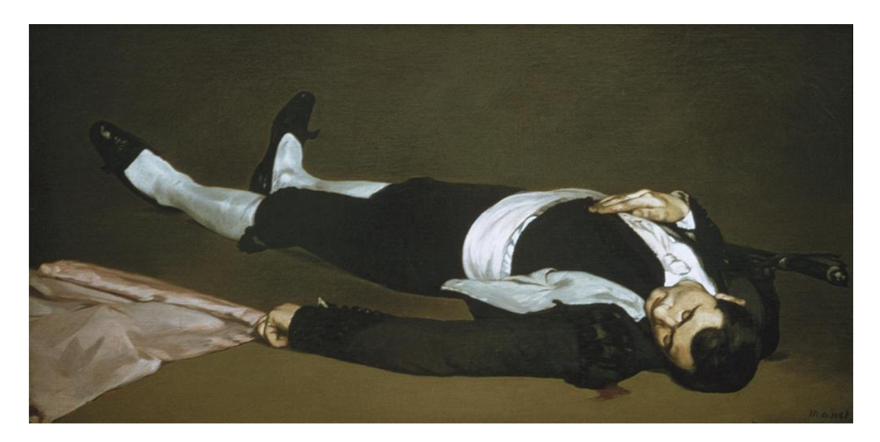
Figure 8: Edouard Manet, Dead Toreador, 1864