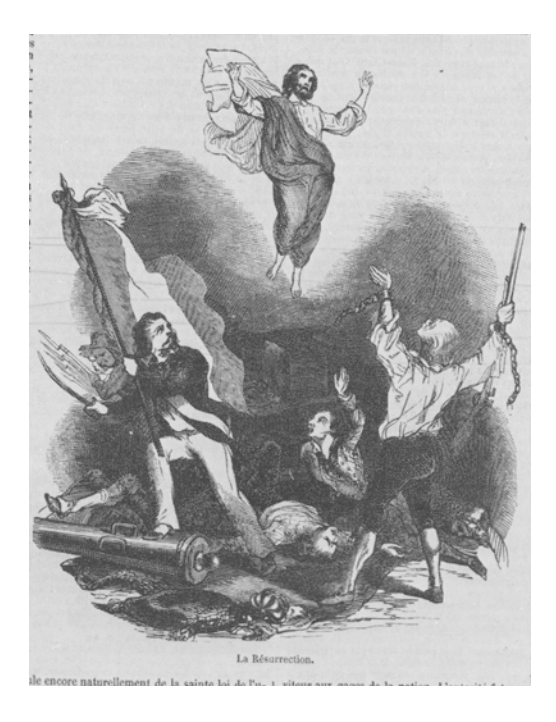
Figure 5: Alphonse Esquiros, La Résurrection from Evangile du Peuple, 1849