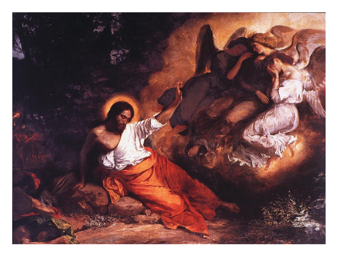
Figure 2: Eugène Delacroix, Christ in the Garden of Olives, 1827