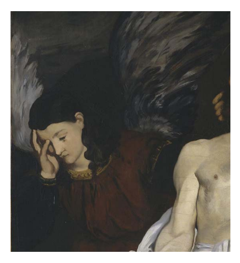
Figure 11: Detail, Manet's Dead Christ with Angels, 1864