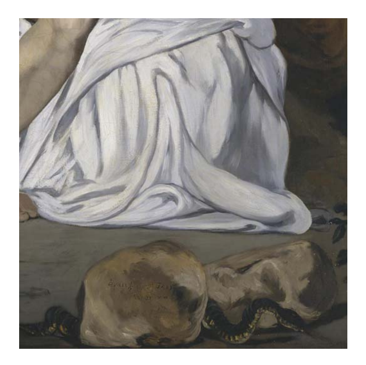
Figure 14: Detail, Manet's Dead Christ with Angels, 1864