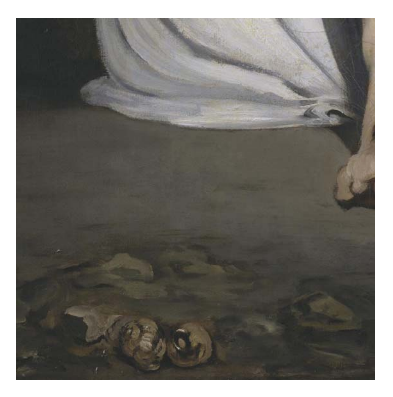
Figure 13: Detail, Manet's Dead Christ with Angels, 1864