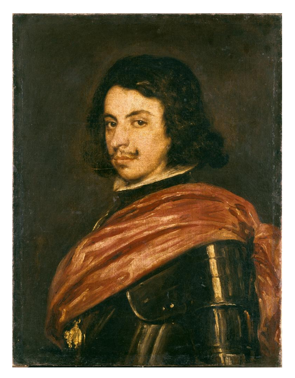
Figure 9: Diego Rodríguez de Silva y Velázquez, Portrait of Francesco I D'Este, 1638