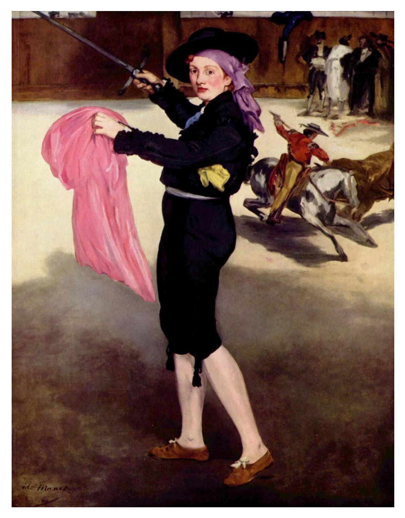
Figure 6: Edouard Manet, Mademoiselle Victorine as an Espada, 1863