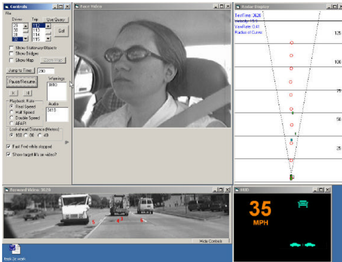
Figure 1. Screenshot of the UMTRI Software Used for Data Analysis. (Displays the driver number, clip number, playback speed, driver's face, forward radar display, speed, and forward scene)

A team of 3 analysts coded the video clips. Clips were distributed among the analysts in such a way that 2 of the analysts coded each clip. The second-generation UMTRI coding scheme (Appendix B) was used to determine: (1) where the driver was looking, (2) where the driver's head was pointed, (3) what the driver's hands were doing, and (4) which (if any) distracting activities the driver was engaged in.