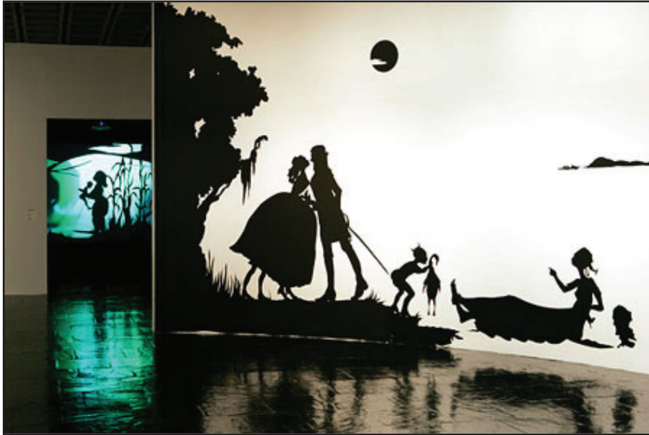
My Complement, My Enemy, My Oppressor, My Love by Kara Walker

sulate, to simplify complicated things...And some of it spoke to me as: 'it's a medium...historically, it's a craft... and it's very middle-class'" (Walker, 1999). I can relate to Miss Walker's feelings; it felt appropriate to create art from modest materials while working with the stories of ordinary people. One of my other inspirations for this project, Rob Ryan, says "To me papercutting means that everything is stripped down as much as possible. There is...no pencil mark, no brush strokes. There is only one piece of paper, broken into by knives; within this is the picture, the message, the story, written and traced in silhouette. Such simplicity...makes my work more readily accessible and easier to digest" (Museum of Arts and Design, 2009). Additionally, the practice of paper cutting is commonly found in the histories of various cultures all over the world, grounding the medium in storytelling and in the creation of art.