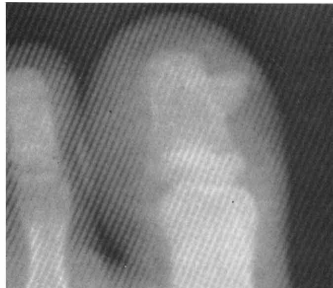
FIGURE 2. Close up of x-ray of left first toe. Note the small projection of bone arising from the terminal tuft.