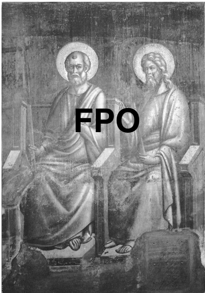
UNIVERSAL JUDGMENT— Apostles (detail), Pietro Cavallini Basilica di S. Cecilia in Trastevere, Rome