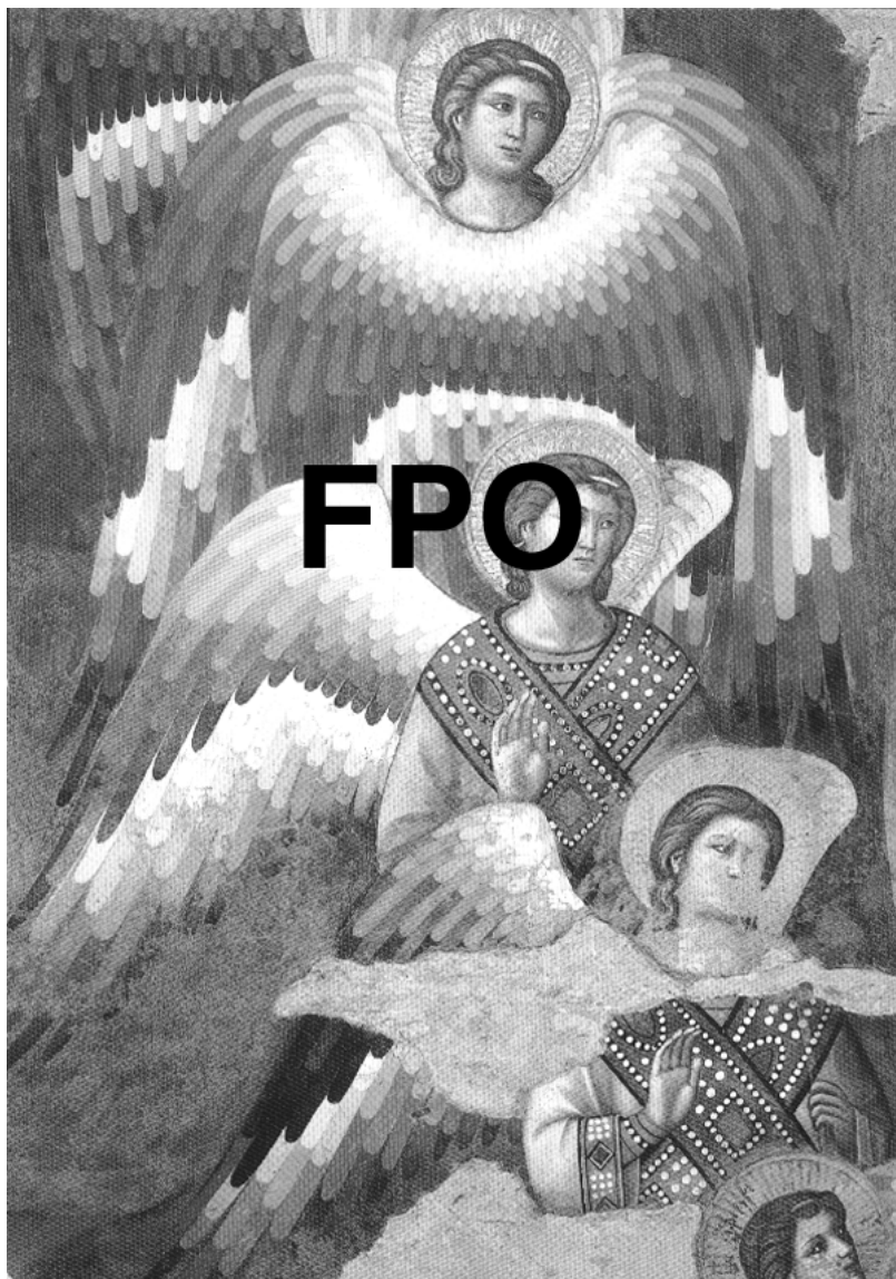
UNIVERSAL JUDGMENT— Angels (left detail), Pietro Cavallini Basilica di S. Cecilia in Trastevere, Rome