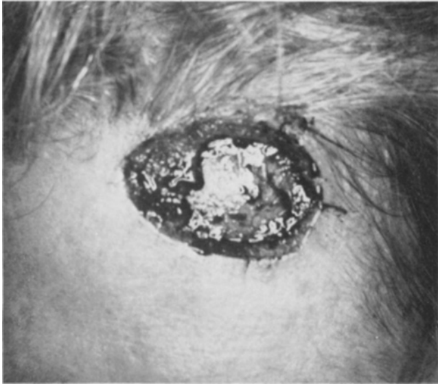
FIGURE 1. Length and width of the primary defect are measured.