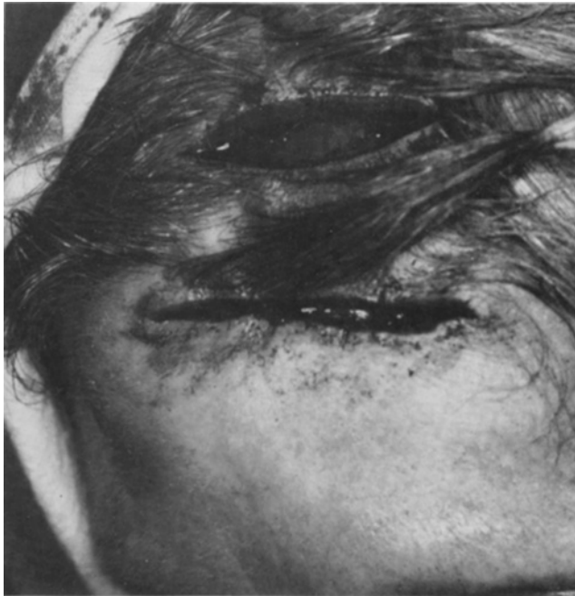
FIGURE 2. The flap has been elevated and advanced anteriorly. The primary defect has been partially closed with subcutaneous sutures.

the width of the wound, corresponding to the amount of tissue movement needed to close the primary defect. The length of this incision corresponds to the long axis of the original defect and parallels the wound. The flap is then further undermined in the subgaleal plane, elevated, and advanced anteriorly. This enables closure of the original defect primarily, maintaining the entire suture line within preexisting skin lines (Fig. 2). The resultant dog-