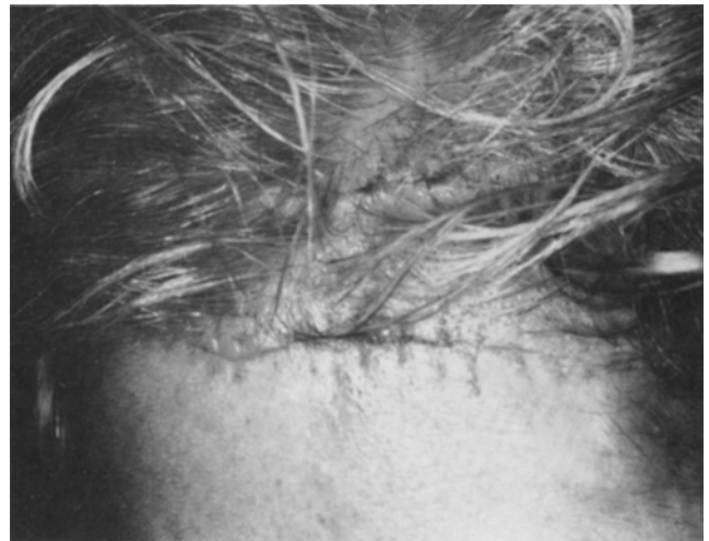
FIGURE 4. One week postoperative. Suture line over primary defect has been placed in existing skin line. Suture line of secondary defect is hidden within the hair.

ears created at the lateral wound margins can then be excised and sutured in the usual fashion, curving the closure to correspond to forehead skin creases (Fig. 3).