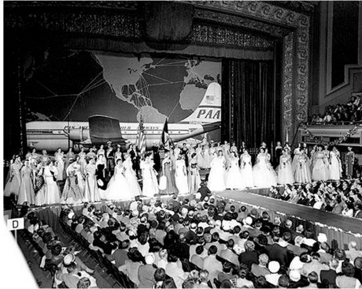
Figure 3.3. “ ...And World Peace. ” Miss Universe and Miss USA participants onstage in 1952 offer a literal depiction of mapping the world on the bodies of contestants. In this rendition of the world, which centers the Western Hemisphere, note that the North American and European continents are the only ones entirely visible. The rest of the map is interrupted by an ad for sponsor Pan American Airways. Capitalism overtakes the world, as the tail of the oversized vessel cuts Africa and Central Asia in half, its body hides most of South America, and its nose renders Oceania and most of the Pacific Islands invisible.

http://www.bellezavenezolana.net/MU/52/pics3.htm