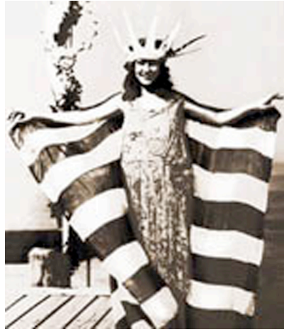
Figure 2.4. Margaret Gorman. Here, the first ever Miss America appears dressed as "Liberty." For the sake of comparison, notice the striking similarity between Gorman's stance and costuming, and that of the suffragette below. Also striking is a contrast: the suffragette appears together with a number of women and girls behind her, while Gorman appears notably alone. The photographs were taken a mere three years apart. http://www.cliohistory.org/films/american/missamerica/