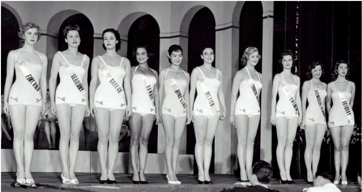
Figure 3.2. Woman = Nation. The first ever Miss Universe semifinalists in 1952 are seen here, all in Catalina swimsuits. They are not identified by their own names or even the names of the companies that sponsored them. Instead, what appear on their sashes are the names of the nations they represent (written in English). Among these are Finland, Germany, Hawai‘i, and Hong Kong, the finalists against whom Miss Italy later leveled public complaints. Note that the only African contestant, Miss South Africa—who stands at a remove from contestants directly around her—is white. http://www.bellezavenezolana.net/MU/52/pics3.htm