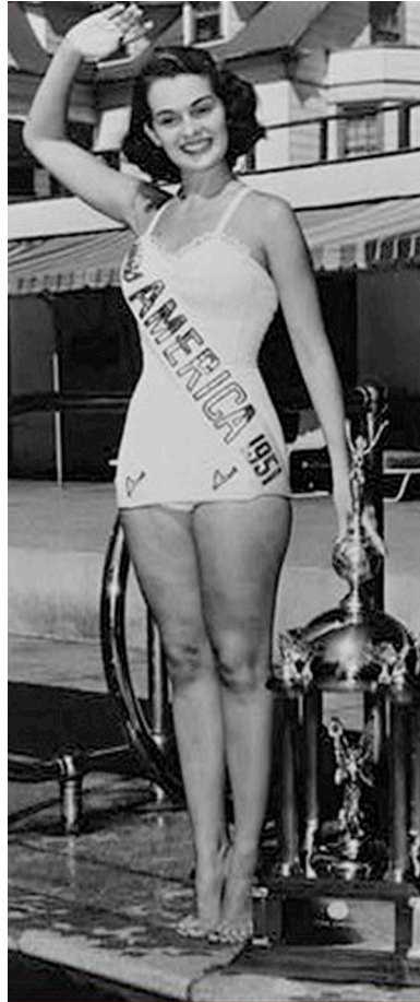
Figure 3.1. Yolande Betbeze. In Miss America pageant lore, it was Yolande Betbeze’s refusal to pose in a swimsuit that served as the catalyst for sponsor Catalina Swimwear to start its own beauty contests: Miss Universe and Miss USA. Though Betbeze’s refusal was allegedly premised on her assertion that she was “an opera singer, not a pinup,” some photographer nonetheless managed to snap a shot of Betbeze posing in a Catalina swimsuit before the company pulled its sponsorship from the Atlantic-City-based Miss America competition and took off to start its own pageants in California.