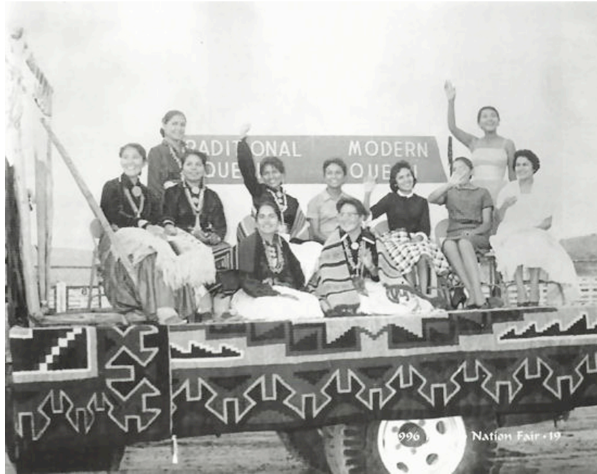
Figure 4.1. Miss Navajo Nation. Throughout the late 1950s and early 1960s, the Miss Navajo Nation pageant was bifurcated into separate contests, one to select a “Traditional Queen” and the other to select a “Modern Queen.” The contestants for both contests in the same year are pictured together here. The group shot is a striking illustration of how young women embody “authenticity” and “modernity” through pageantry.

http://www.missnavajocouncil.org/history/pageanthistory.htm