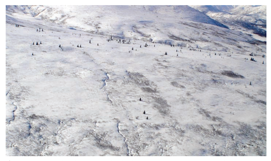
Fig. 2. Sparsely distributed spruce considered to be analogous to glacial-refuge populations. DNA and fossil pollen data suggest that such small populations survived the Last Glacial Maximum in Alaska and that they were important for boreal-forest development after the end of the last glaciation (7).

environments probably tens of kilometers from ice sheets (8, 9) and even in ice-free areas north of ice sheets (7). Thus, it appears that small populations of trees can endure extreme climatic conditions for tens of thousands of years (Fig. 2).