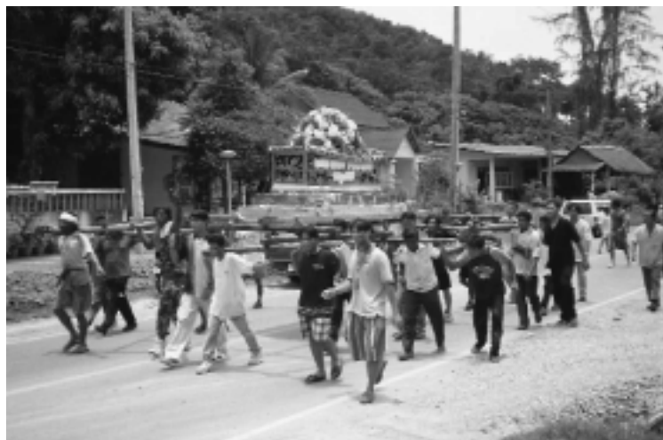
Funeral procession for a young man who died of AIDS, Thailand.