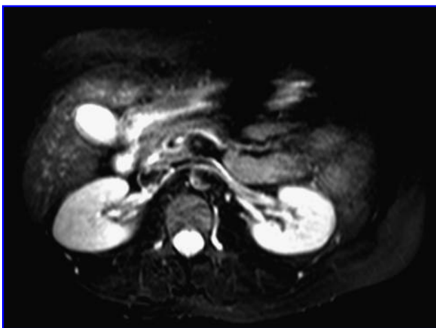
FIG. 3. Patient 3, six-year follow-up magnetic resonance imaging showing no abnormalities in the left renal collecting system.

Amyloidosis refers to a group of diseases characterized by the extracellular deposition of amorphous, insoluble, proteinaceous material. Of the four major forms (primary, secondary, hereditary, and \beta_2 -microglobulin-associated), the two most frequently encountered forms are primary and second-