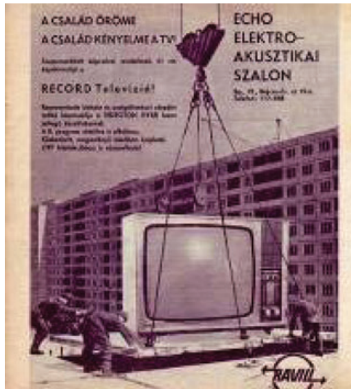
FIGURE 4. Electronics advertisement, circa 1970, of a giant television replacing a prefabricated concrete panel as it is hoisted into place on a new building.

functional strength compared to wood or porcelain: “PLASTIC! Even if you jump on it, it’s UNBREAKABLE!” ( Lakáskultúra 1967).