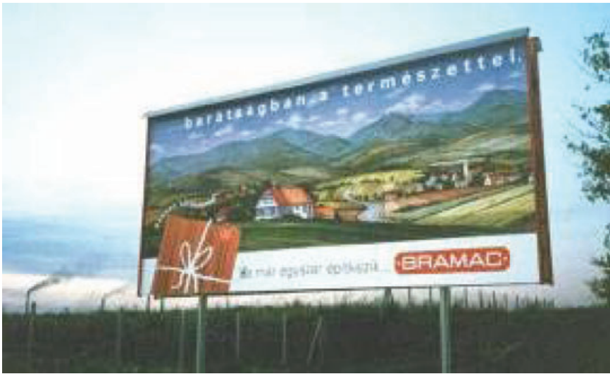
FIGURE 1. Billboard advertising roofing tiles, 1997.