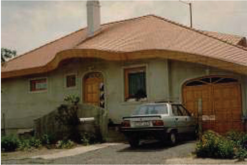
FIGURE 2. Organicist architecture for new house in a suburbanizing village outside Dunaújváros.

it was the color of red meat—a reference to the organic explored in this article. Although most roofs were made of the red tile featured in the Bramac ad, some were also roofed with thatch, a prestigious material used in the retrofitting of old, peasant houses into modernized spaces.