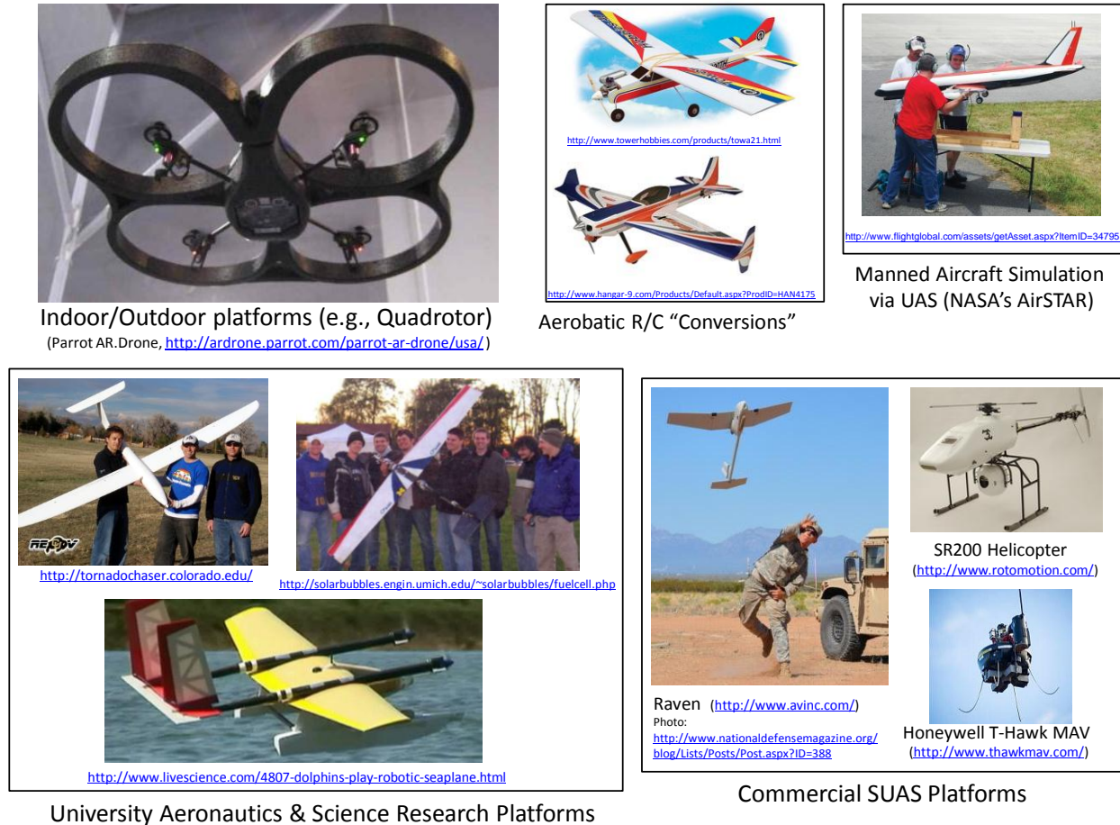
Figure 2: Example Small UAS Platforms.

summarizes a candidate metric set we propose for consideration, with some data acquired from the Cambone et al UAS Roadmap. 2 Figure 2 shows a cross-section of small UAS applicable for a wide variety of local-area operations, while Figure 3 shows two of the most common long-range, high-altitude large UAS models operated by public and civil US agencies, Predator and Global Hawk. Figure 4 shows an example UAS ground control station developed by NASA; while this example is intentionally similar to a transport aircraft cockpit, the UAS pilots remain necessarily separated from the UAS, a critical distinction that will impact numerous CFRs as illustrated above for 23.143. As is clear from these figures, the set of possible UAS configurations is perhaps even more varied than the set of manned aircraft configurations for which the CFRs were defined. Their operational uses are equally diverse. While UAS CFRs must be responsive to the formidable set of possible attribute-value combinations depicted in Table 2, the number of distinct classifications must be minimized to avoid attempts to develop an unmanageable set of UAS CFRs.