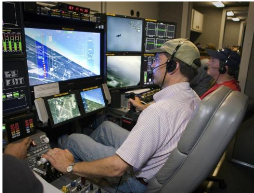
Figure 4: Example UAS Ground Station (NASA's AirSTAR) § http://www.nasa.gov/centers/langley/multimedia/iotw-airstar.html