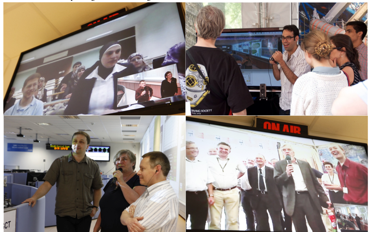
Figure 2. Clockwise from top-left: Visit from Birzeit University, Palestine; Visit from World Science Fair, New York City; CERN Director General attending Festival of Science in Cracow, Poland; ATLAS members from Cracow hosting Virtual Visit in ATLAS Control Room.