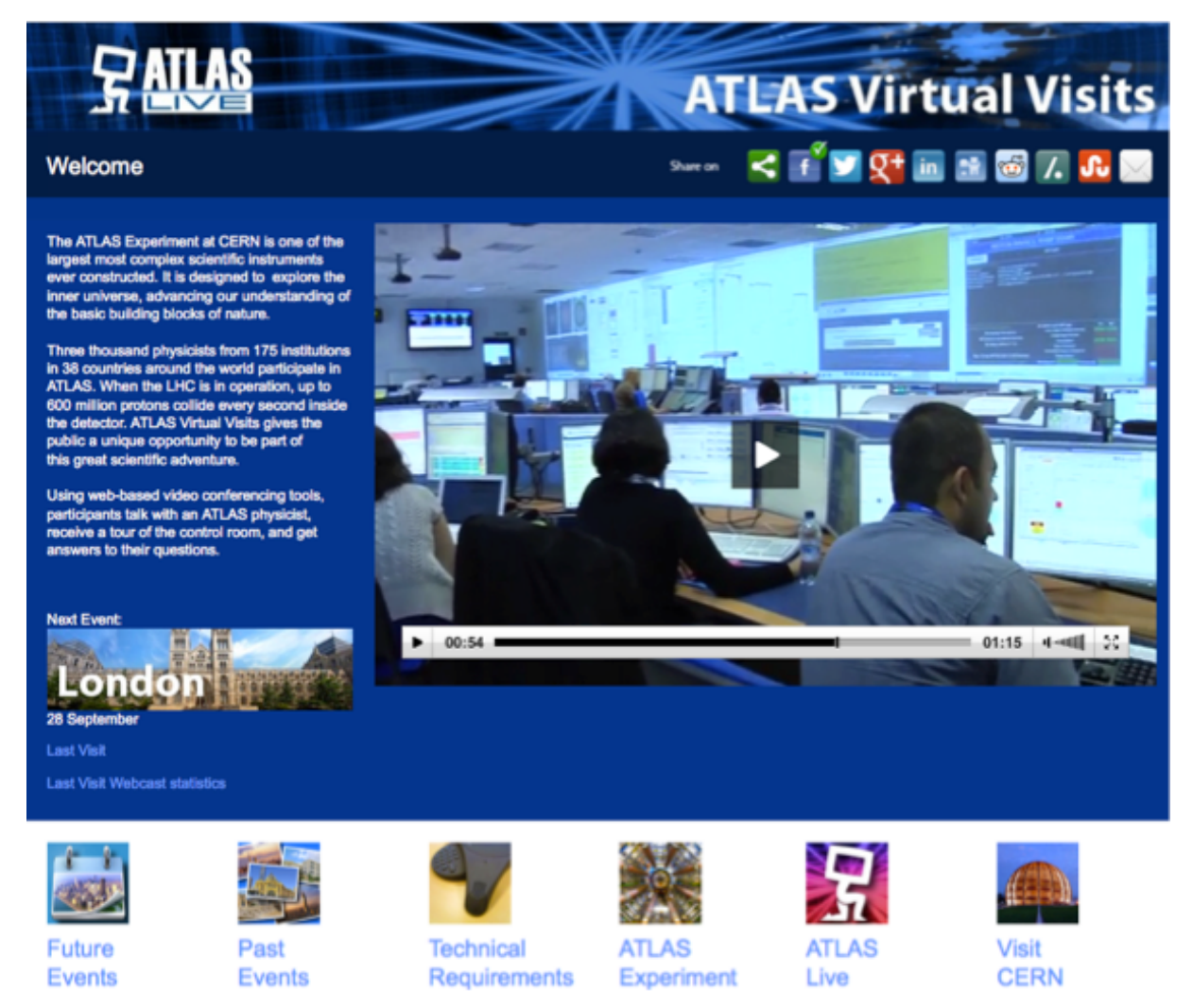
Figure 3. Virtual Visit webcast and recording interface.

No specific strategy has been devised to recruit visits, as the current number of requests is already reaching the limits of the existing human resources. However, an emphasis has been placed on giving priority to visits from locations that would be challenged to organize physical visits to CERN. This includes institutes with limited resources and those located far from Geneva. Events involving ATLAS institutes or associated to events organized by those institutes are also given a high priority, as are events that promise to reach wide audiences, such as science fairs or museum shows.