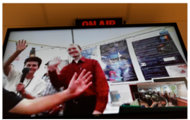
Figure 4. So long and thank you for taking this virtual trip (visitors from Cracow, Poland)!

To address Point 3, we have defined a set of equipment for the remote location that is minimal for an effective visit. For schools and other potential visitors without access to that equipment, we suggest the creation of a program that could subsidize the donation or lending of Virtual Visit kits to schools or school districts in need. Our next steps will include an effort to identify resources to support a widescale, Virtual Visit campaign, targeting locations that could most benefit from exposure to the excitement of the LHC physics program, but that currently cannot afford to make the virtual trip.