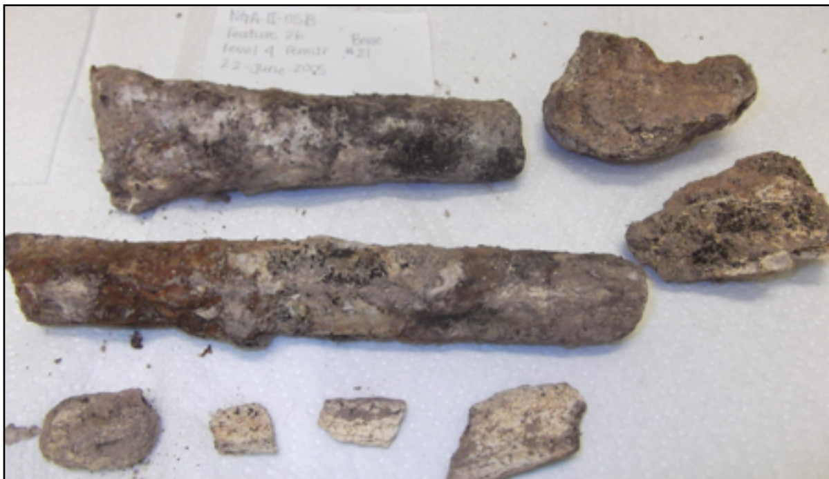
Figure 2. Bone # 21, femur. Pre-cleaning

Each bag was left slightly open to let air out slowly so the bones would not warp or crack with rapid changes in temperature. Florian (1997) has also found that the slower the thawing process, the fewer dormant fungal spores will remain. I also made sure to check for any condensation forming on the inside of the bags, indicating the bones had been wet when frozen and were therefore more fragile. I was prepared to change the bags if condensation occurred to prevent an increase in relative humidity that might activate remaining fungal spores (Chemello personal communication 2012). Every hour, I weighed each individual bone bag to determine if the bones were losing weight, which would also indicate that the bones had been wet when frozen and would require an even slower defrosting process to ensure ice crystal retraction did not damage the skeletal remains (Florian 1997). After four hours, the bones did not sustain any damage from the defrosting process; they were mostly likely moist but not saturated when put into the freezer, preventing any serious damage from occurring. I transferred the bones to fresh bags once more, still partially closed to allow any humidity to escape, and then left the remains in the fume hood for 48 hours to completely dry and acclimate to room temperature.