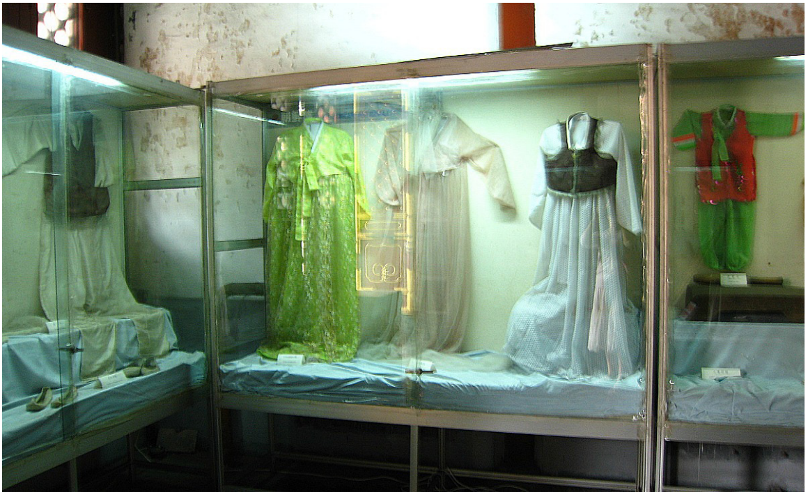
Figures 6a, b. The Heilongjiang Provincial Nationalities Museum.