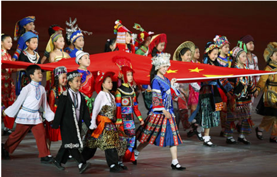
Figure 1. Children representing China's 55 minority groups by wearing costumes and holding China's flag during opening ceremony of the Beijing 2008 Olympic Games.