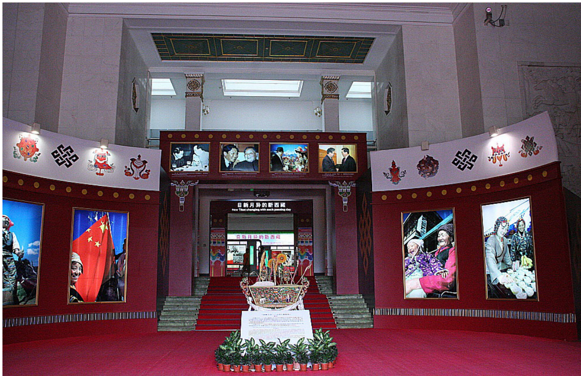
Figures 11a, b. The Exhibition Hall of the Cultural Palace of Nationalities in 2008.