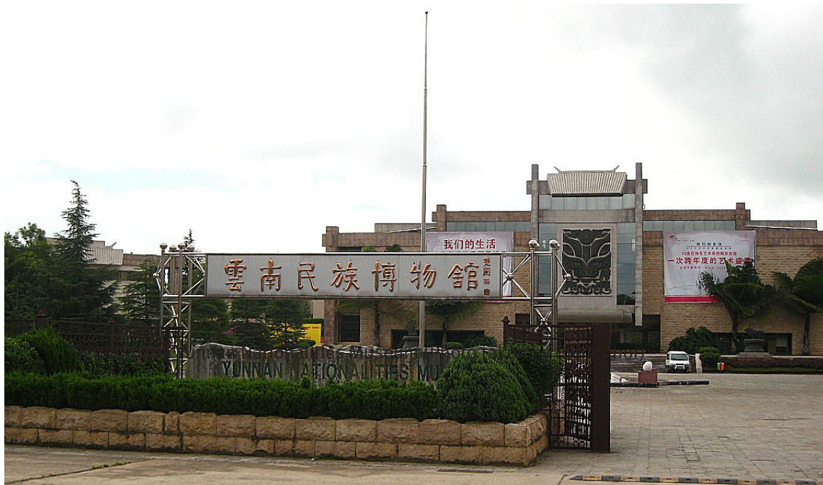
Figure 7. The Yunnan Nationalities Museum.