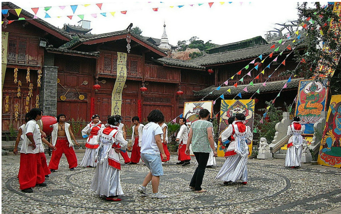
Figures 9a, b. The Zhonghua Minzuyan , also called the China Nationalities Museum or the China Ethnic Museum.