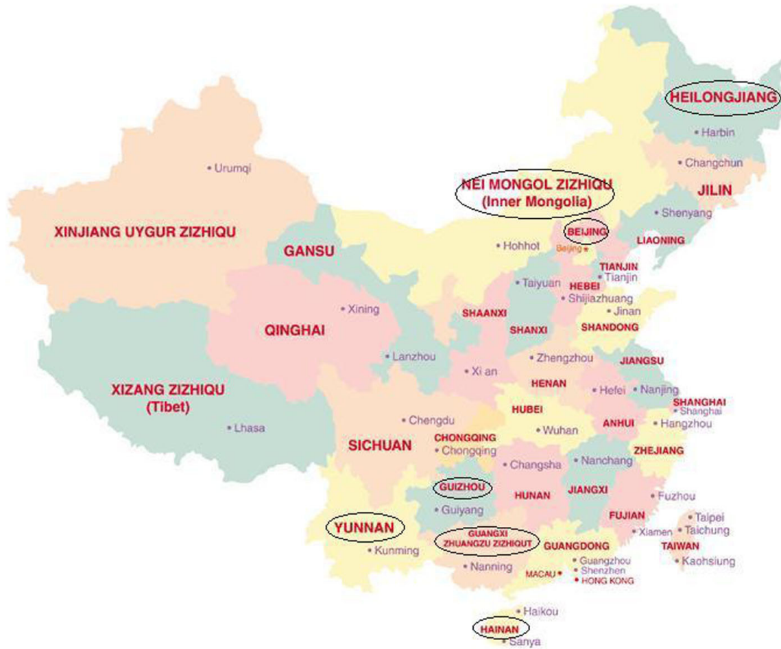
Figure 5. Provinces where minzu museums are located (circled by author).