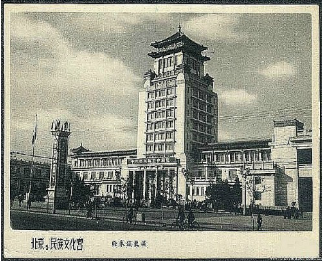
Figure 10. The Cultural Palace of Nationalities in 1959.