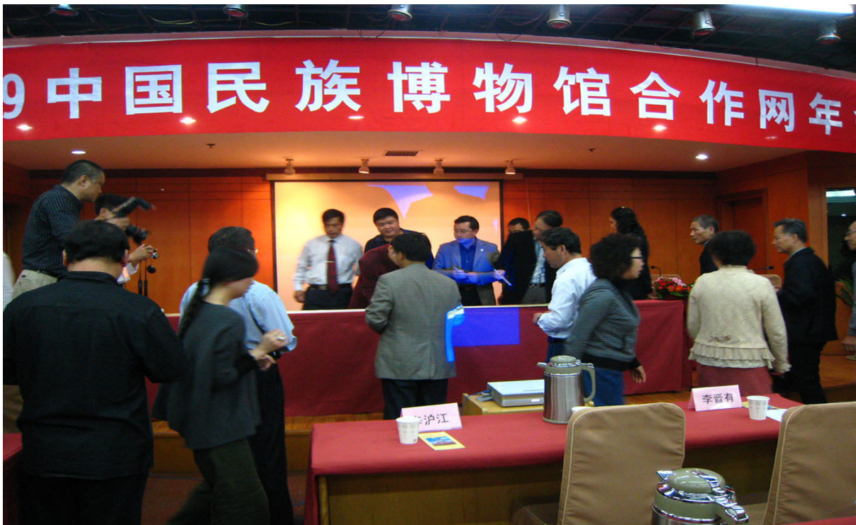
Figure 13. At the annual meeting of the Minzu Museum of China in 2008, participants line up to sign the Hezuowang banner.