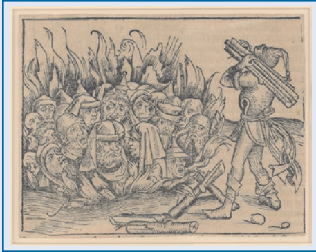
"The Burning of the Jews", Nuremberg Chronicle , 1493