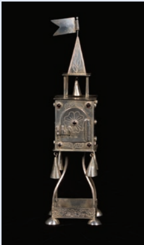
Silver Besamim (spice) container, ca. 1900

From the candles lit on Friday night to begin the Sabbath to the braided havdalah candle burned at the conclusion of the Sabbath to distinguish the day of rest from the workaday week, from the recitation of prayers in the mahzor (High Holiday prayer book) on Rosh Hashanah and Yom Kippur to the reading of Ekhah ( The Book of Lamentations ) in the late summer, from the bris ceremony for infant boys to the recitation of the Mourner's Kaddish to mark the death of a loved one, Jewish life is filled with intricate, established practices and ceremonies to mark seasonal observances and cycles of life. Festivals, fast days, births, bar- and bat-mitzvahs, weddings, and deaths all require the participation of the kehillah , the community, and the people who make up that community need books and objects to fulfill many of the mitzvot , or commandments, of the Jewish religion.