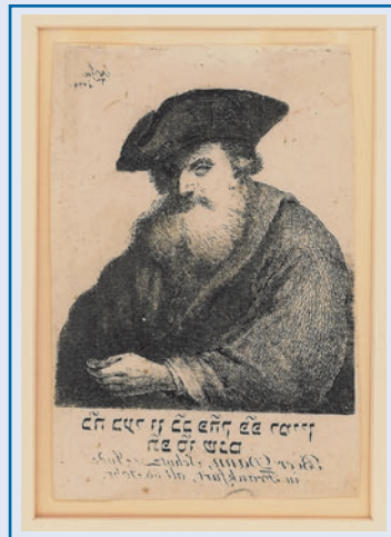
Nothnagel, Portrait of the Frankfurt Jew , Baer, Counterproof

Jewish art did not develop as a universally coherent phenomenon. In its earlier years it borrowed styles from the many places and times where Jews lived, often provoking charges that Jews were simply freeloaders lacking creative intuition. However, with the spread of internationalism at the end of the nineteenth century, art crossed global and native borders and Jewish artists began to shape progressive visions of their own. Those visions have often been credited with capturing the spiritual values of social justice and societal responsibility, and, if only subliminally, penetrating the Jewish psyche.