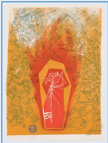
Gropper, Warsaw Ghetto Memorial , ca. 1963