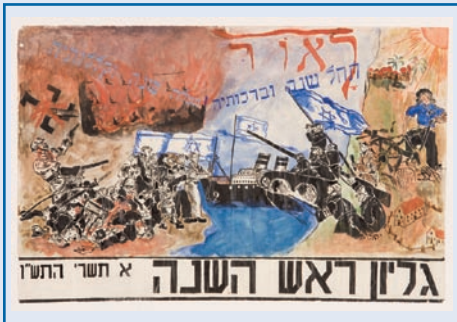
Anon. Le'or , 1946

Jewish history has been marked by persecution, oppression, expulsion, and, in the twentieth century, the systematic annihilation of one-third of the world's Jewish population by the Nazis and their collaborators. This nadir in Jewish history did not spring from a vacuum, as antisemitism was neither invented in Nazi Germany nor vanquished with it. There were centuries of precedent in Europe and elsewhere, and, unfortunately, continuing evidence of it today.