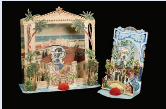
Rosh Hashanah pop-up cards, ca. 1900