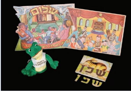
Simchat Torah flags, alphabet puzzle, toy frog