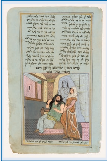
Leaf from Judeo-Persian Manuscript, ca. 1900

While Jews worldwide feel a collective bond based on shared religious or historical links that transcend political boundaries, most American Jews share a more specific heritage of collective identity as descendants of ancestors who lived in Central or Eastern Europe. Places such as Russia, Poland, and former states of the USSR are understood as the “old country” or ancestral home for many. While many parts of the Jewish Heritage Collection underscore the kinship of Jewish culture, there are also items in it that remind the viewer of the cultural diversity present within the religious commonalities of Judaism.