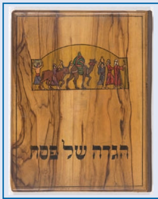
Haggadah , 1927, Bezalel painted binding

The Jewish Heritage Collection contains some one hundred and fifty Haggadahs, ranging in date from 1712 to the present, and demonstrating the rich variety of presentations of this text. This text has long offered artists the opportunity to make their work known to a wide audience, and so some Haggadahs contain illustrations by great artists. Others contain reprints of illustrations from Haggadahs of previous eras as time-honored traditions that evoke memories of childhood. The Jewish Heritage Collection includes simple Haggadahs given away free to customers by grocery stores and coffee companies, and fine facsimile editions of beautiful manuscript Haggadahs. It also demonstrates the range of modern Jewish practice with a notable group of Haggadahs from Israeli kibbutzim that reflect various degrees of secularization, as well as versions intended for particular sects of Judaism and specific groups such as schools and units of the armed forces.