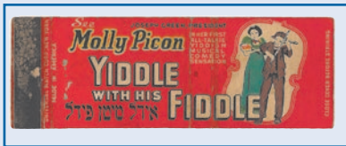
Matchbook cover, 1936

Permanent Jewish settlement in what is now the United States began in September 1654 when twenty-three Sephardic Jews fled the Inquisition in Brazil and landed in the Dutch colony of New Amsterdam (now New York City). Several waves of immigration followed over the next 350 years. After the Sephardim came the German Ashkenazim from the 1830s until 1870. The first mass immigration occurred when Russian Jews fled the pogroms in the 1880s, but Jewish immigration greatly slowed when strict quotas for Eastern and Southern Europe were introduced in the 1920s. Not until after World War II, when remnants of European Jewry who had survived the Holocaust were finally permitted entry, did Jewish immigrants in sizeable numbers find their way to America again. Although these immigrants, who referred to America as di Goldene Medine (“Golden Land”), brought many customs and manners of their old countries with them, most were then quickly acculturated, forging a vibrant and unique Jewish way of life in their new country.