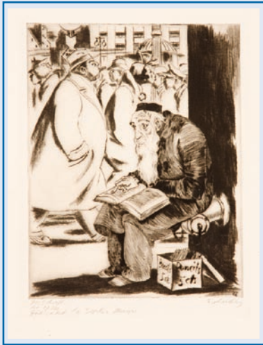
Eichenberg, Die Schrift , 1930