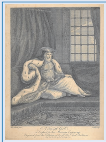
White, Jewish Girl Dressed for her Marriage Ceremony , 1768

Collections do not assemble themselves. They are the product of choices based on principles of organization in the minds of the collectors, and so reveal their assemblers as well as