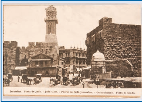
"Jaffa Gate", postcard in Souvenir de Jerusalem , ca. 1900