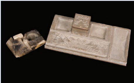
Soapstone carvings, Cyprus, 1946.