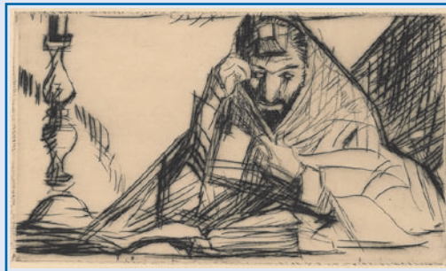
Brangwyn (attrib.), Untitled, n.d.

Printing made it easy to learn from inexpensive books and to carry them, if necessary, wherever one might settle – a boon, in particular to the peripatetic Jew. Soon all kinds of secular and religious material – as well as anti-Jewish and proselytizing tracts – was readily available. Prints that described religious observances and holiday celebrations, that depicted costumes and worldly goods, that paraded everyday faces and forms, or that offered nostalgia, common traditions, and sincere piety have provided the principal visual documentation of Jewish life. Yet much has been erased from the Jewish memory because so many works were periodically destroyed in bonfires and pogroms, and because much of folk art was neither highly esteemed nor preserved. But the supply of printed pictures and books that remains recalls an entire Jewish culture – in its accomplishments and in its battles to exist. It is through such works that the Jewish experience from the fifteenth through the twentieth centuries is reflected.