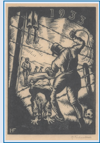
Fechenbach, Escape , 1940

Though Haggadot were the most popular, many other examples of religious importance