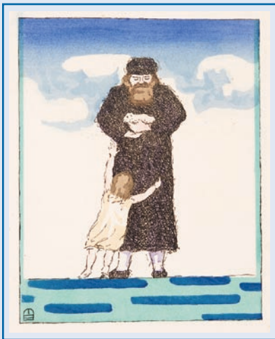
Birnbaum, Had Gadyah , 1920

The Haggadah, the text used to guide the celebration of the Passover Seder, tells the story of the Exodus of the Jews from Egypt and the passage from slavery to freedom. Since celebrants are urged to make the story as real as possible for themselves and their children – to relive the Exodus, so to speak – and the story is rich with possibilities for visual images, Haggadahs are usually lavishly illustrated.