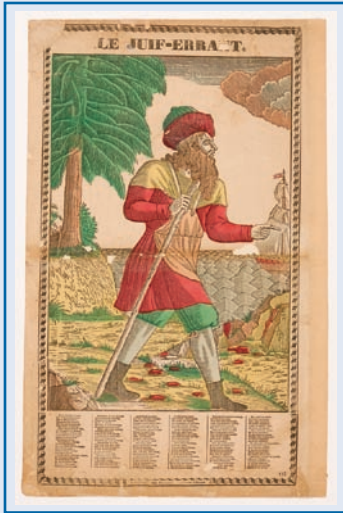
Le Juif-Errant , French broadside, ca. 1800

The drive to establish parameters of Jewish art dates to the Second Commandment: “Thou shalt not make any graven (or sculpted) image, or any likeness of anything that is in the heaven above, or that is in