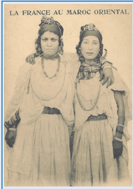
Postcard, ca. 1930

How cultural groups envision the women among them provides a view into how they conceive of themselves as a whole. In traditional Eastern European religious circles women were often more “worldly” than men; while the latter sat indoors and studied sacred texts in Hebrew, the women were out in the market square, conversing with the surrounding gentile population in their languages and inevitably encountering and navigating ideas outside their intimate community. On the other hand, Jewish women in America were at times charged with guarding the neshome , or Jewish spirit, of the domestic sphere while men became part of the broader community through their professional occupations.