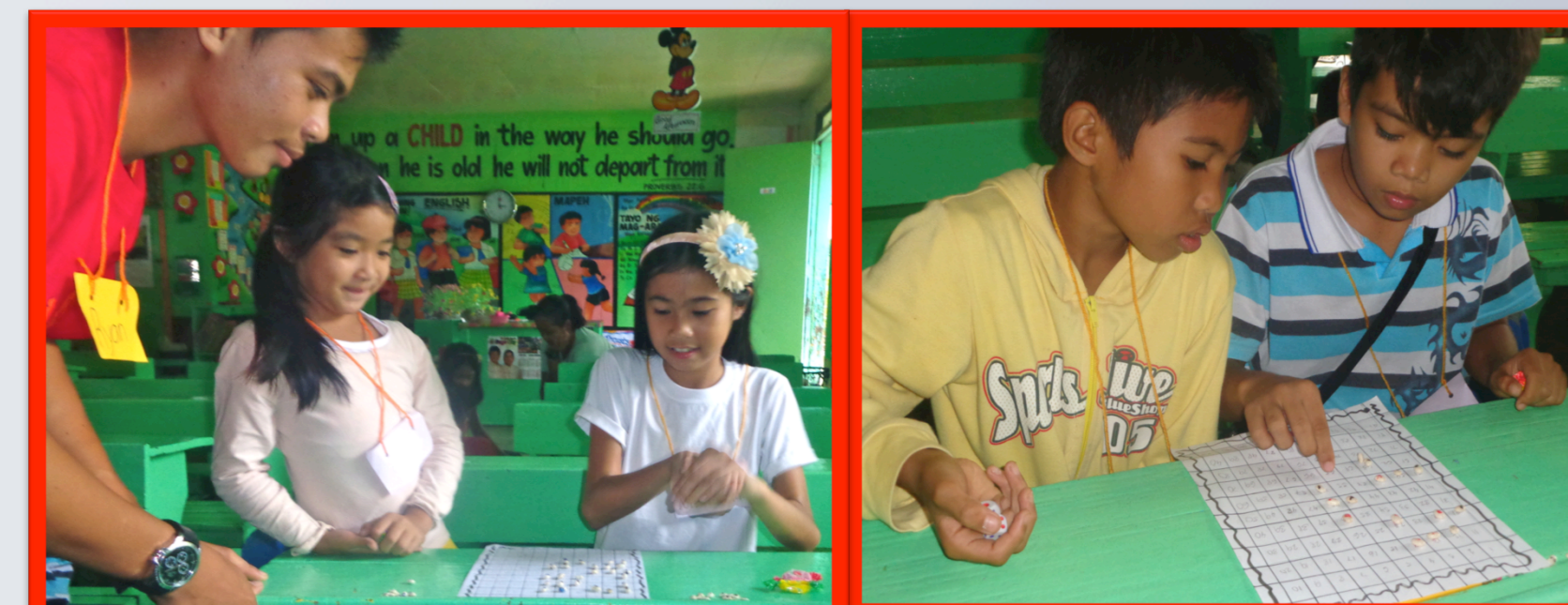
Children get extra help in Catch Up Program

Career Connections: I am committed to an assets based approach to community development and will use this approach in my future career.