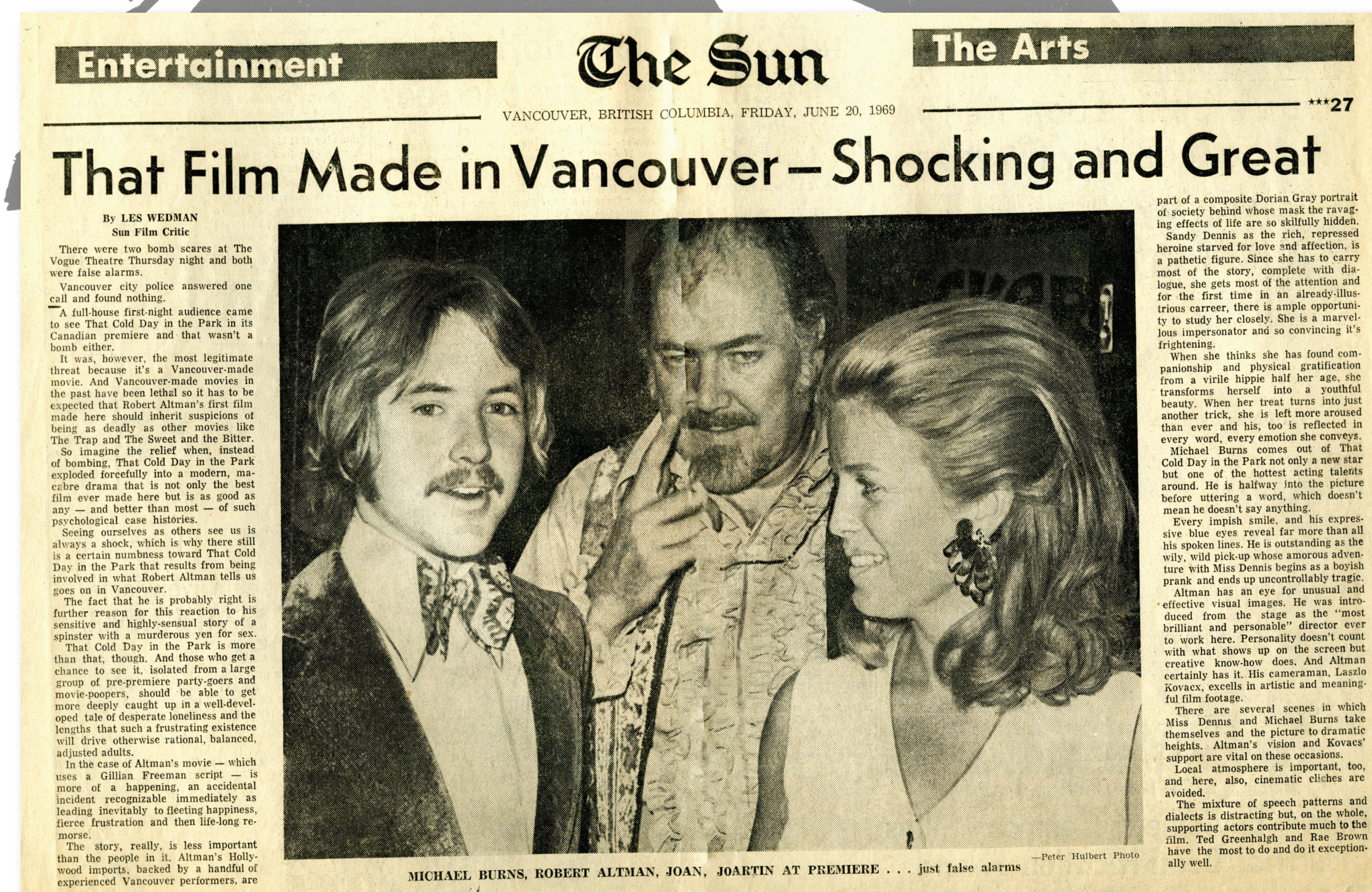
Les Wedman, "That Film Made in Vancouver - Shocking and Great," Vancouver Sun , June 20, 1969