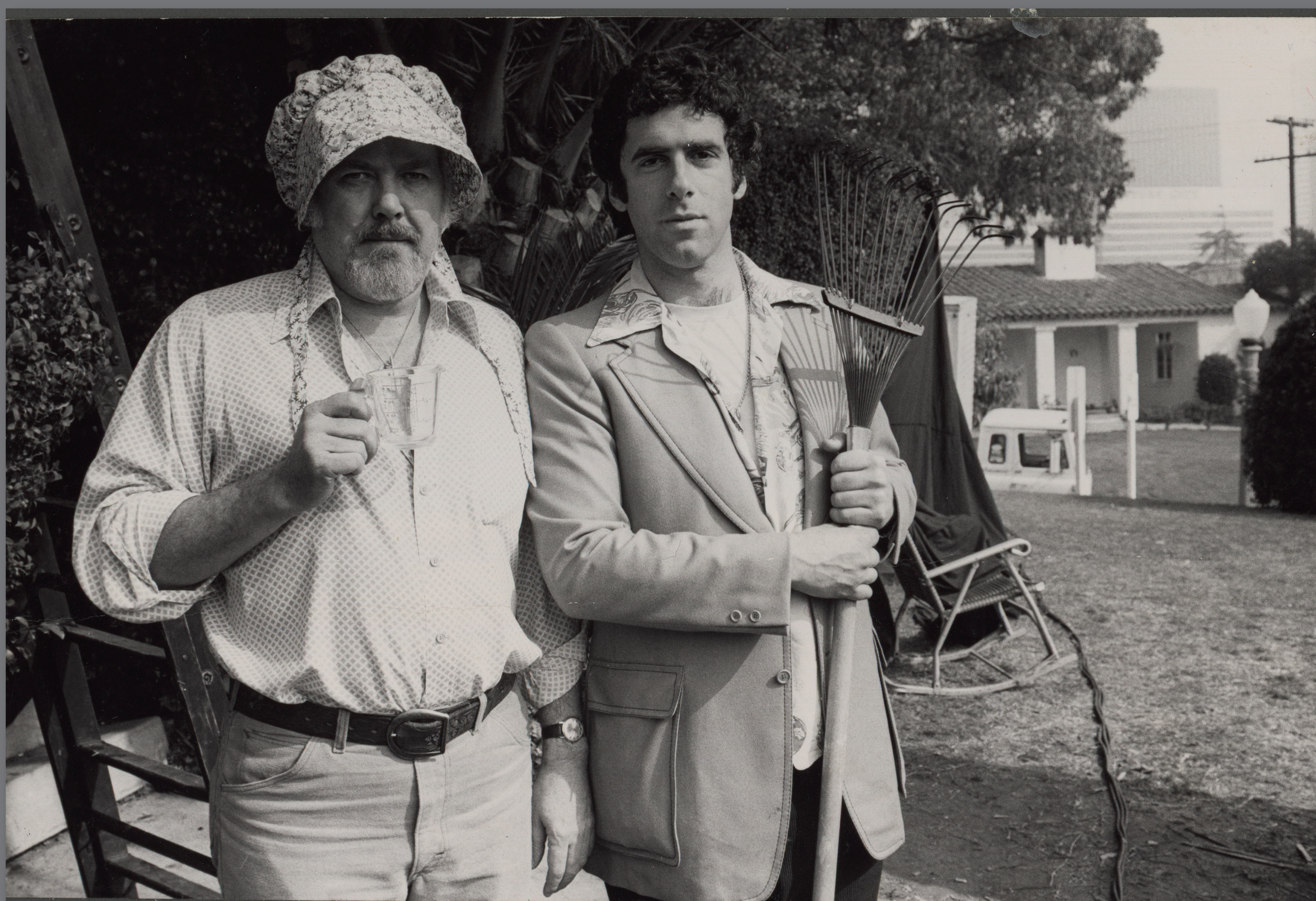
Photograph of Robert Altman and Elliott Gould on the set of California Split (1974). From the "Altman Calendar," June. Robert Altman and Elliott Gould playfully reenacting the classic Grant Wood painting, "American Gothic" on the set of California Split , a film that follows two gamblers to a high-stakes poker game in Reno.