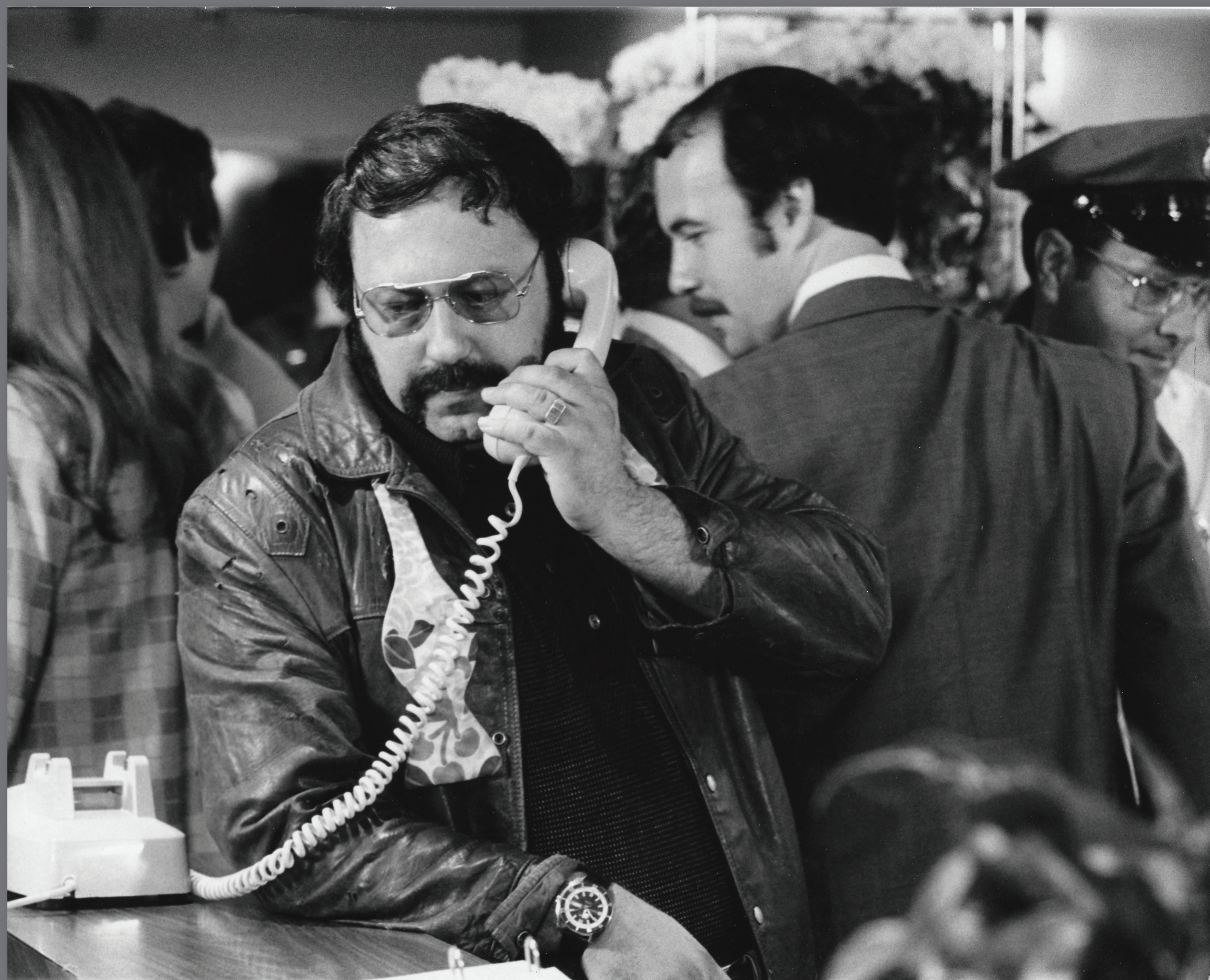
Photograph of Allen Garfield on the set of Nashville . This letter from Allen Garfield, one of the actors comprising the 24-person ensemble cast of Nashville , shares his feeling that his part was improperly edited and he didn't enjoy his on-screen performance. Despite this dissatisfaction, he could not bring himself to deny the film's brilliance.