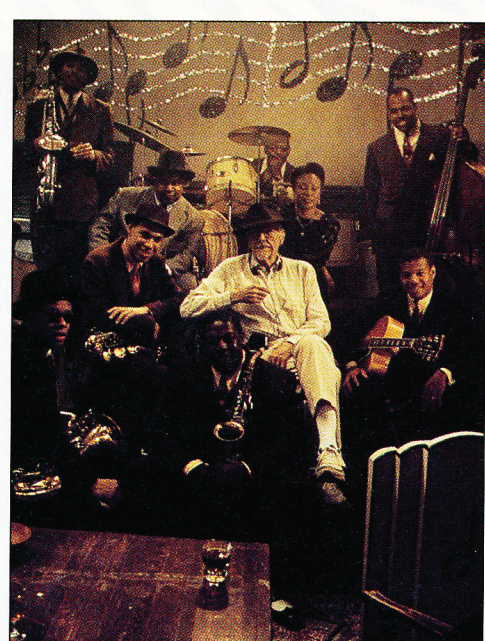
Altman, in his element, with the Hey Hey Club Musicians, directing Kansas City .

in which the silver normally lost during the negative processing is re-bonded to the release prints. (Some of Seven's original prints were given this rare treatment, which increases the luminosity in light portions, increases the density of dark tones, and subtly mutes the color.) "The process makes it look richer, which is important because most of it was shot at night, at jazz clubs, and the shooting of the music was very important." It's not like Nashville . The story here is simple. The film is constructed like jazz, and I see it as a jazz film," Altman adds, stretching between the grating sets of a long press junket at a New York hotel. "The story is a melodrama, and the film is, in a sense, the way jazz musicians would play their respective instruments. The structure of the dialogue is elliptical, like jazz solos, spherical. The jazz complements the picture and vice versa." "It's all based on sense memories," Altman says in a mellotone. "The people I remember, the stories I heard, the things I heard. So for me it's truthful stuff. When I returned there, I knew all the places and the streets. But I don't know any of the people there. It was a cold nostalgia, not unpleasant in any way, but walking around had a dream-like quality."