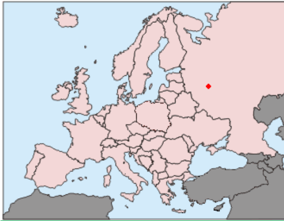
Location of Moscow in Europe