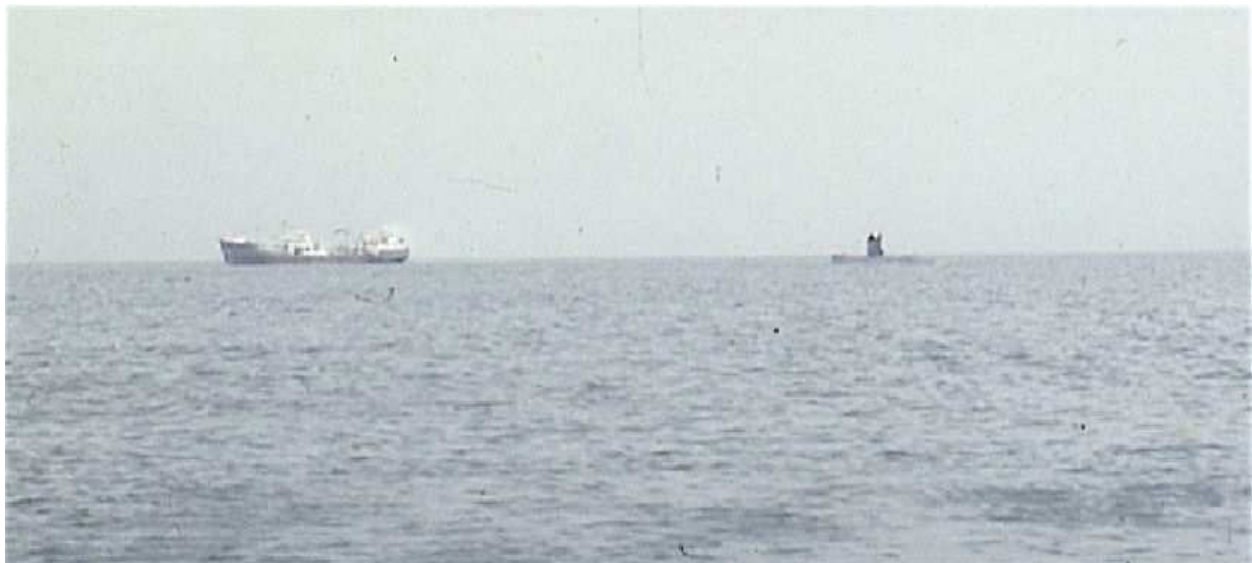
Odessa boat trip