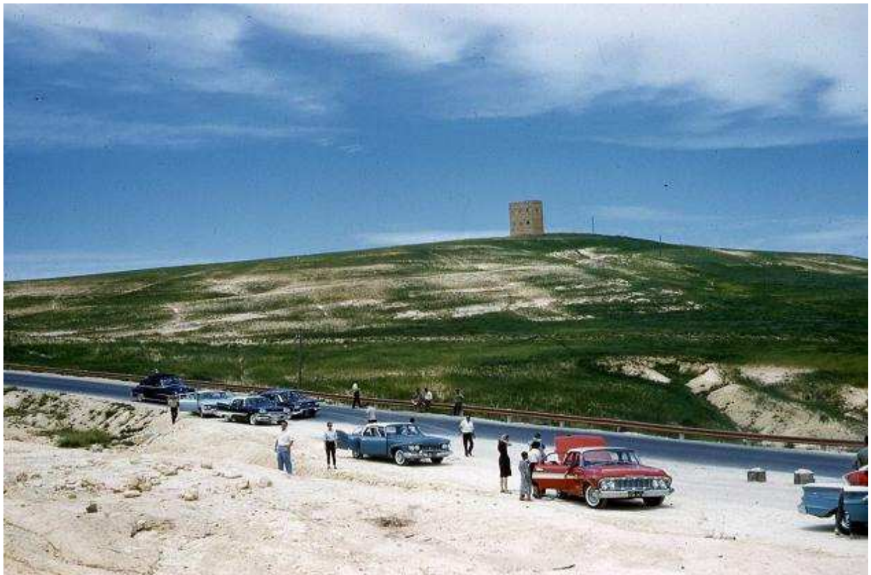
Petra Taxi Caravan