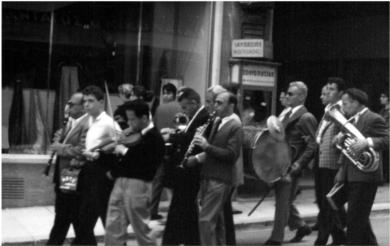
Marching band for the blind.

Saturday, May 13, 1961, 87 th Day Athens, Greece