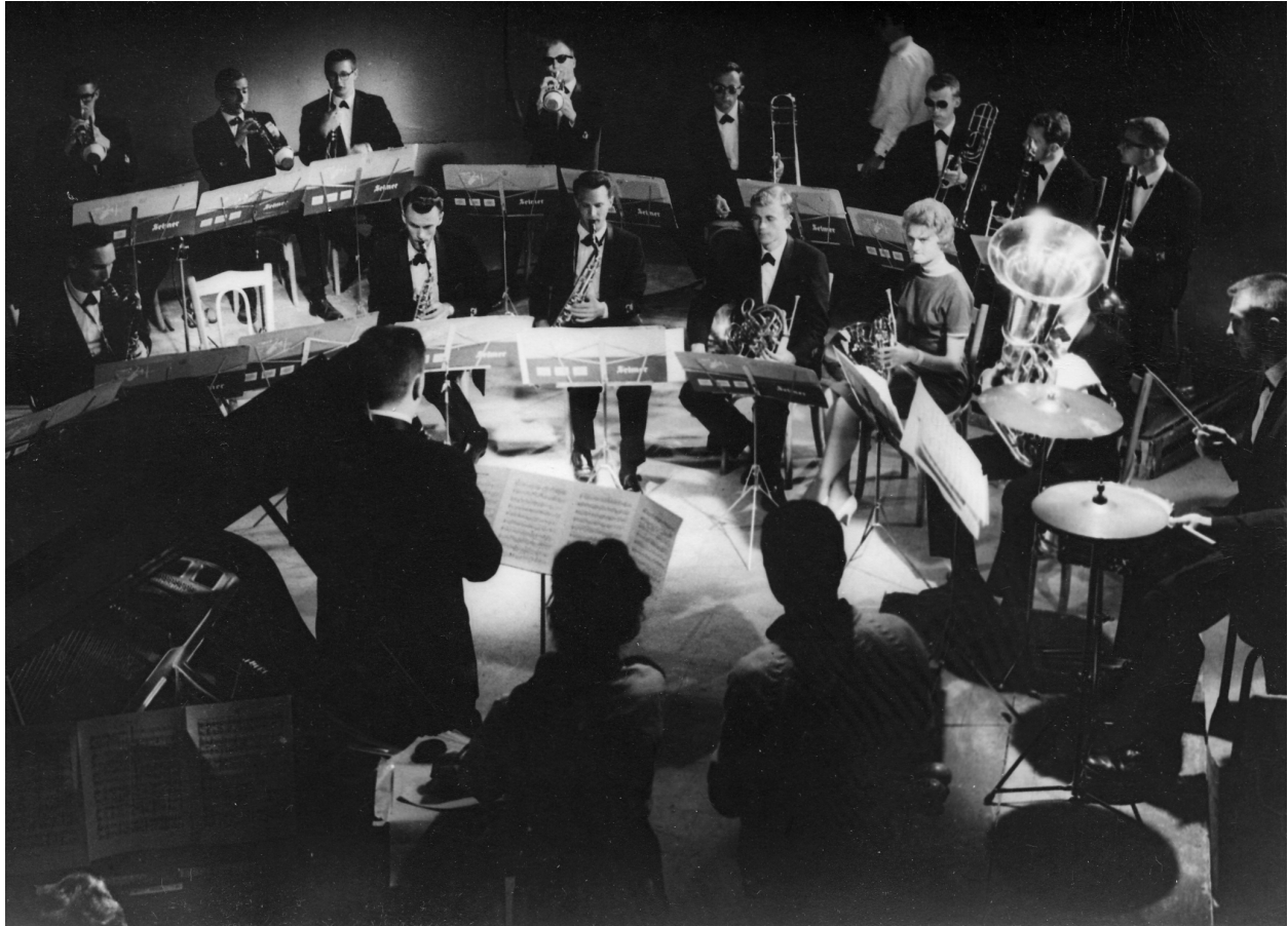
Russian Tour Dance Band