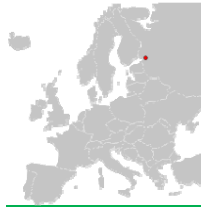
Location of Leningrad in Europe