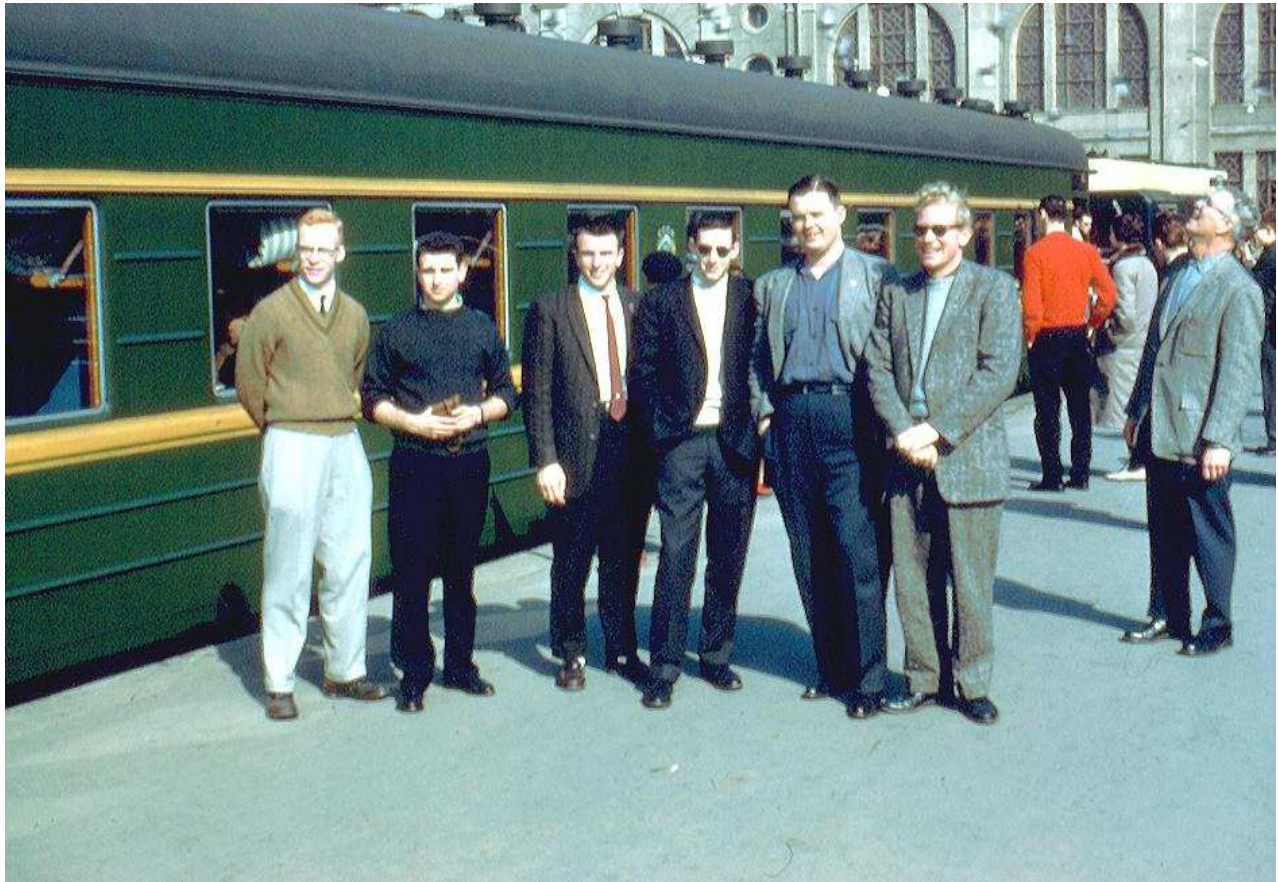
Boarding the train to leave Odessa

Saturday, March 25, 1961, 38 th Day Odessa, Ukraine, USSR