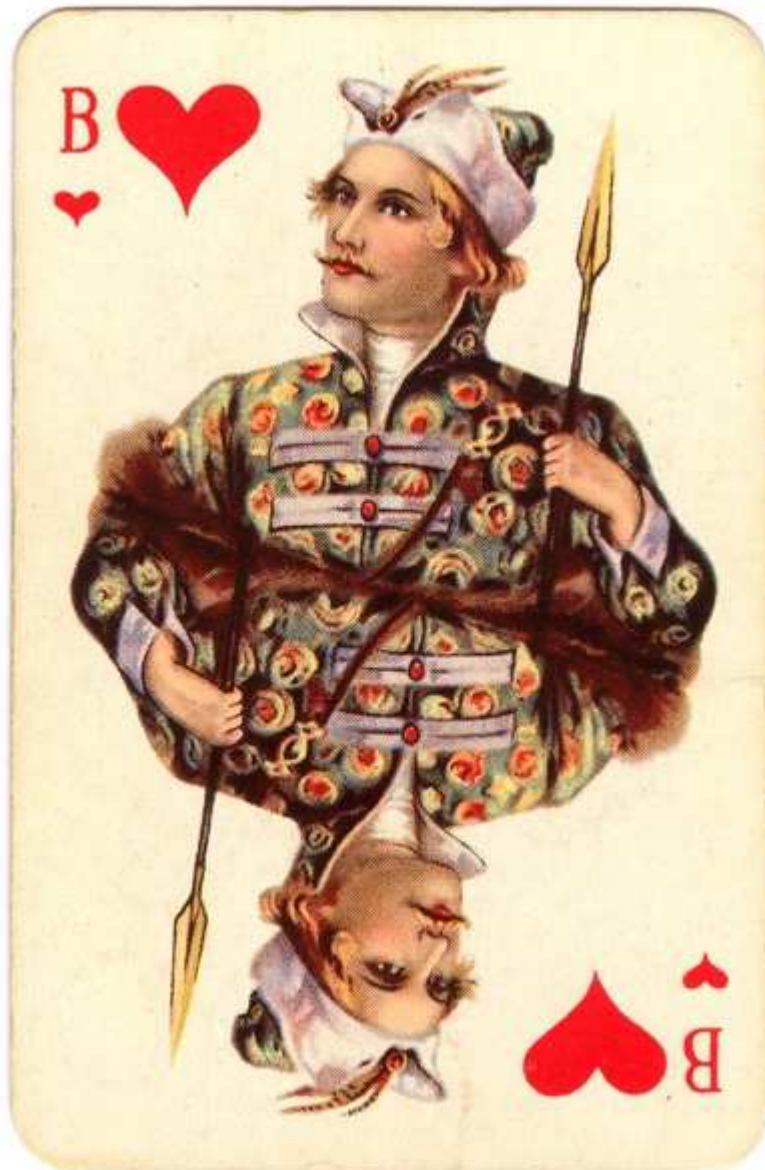
Russian Playing Card, Jack

Collected memories, letters, notes and diaries from the famous, 1961 108 days (15 weeks) cultural exchange tour of the University of Michigan's Russian Tour Band to the Soviet Union, Middle East and Eastern Europe.