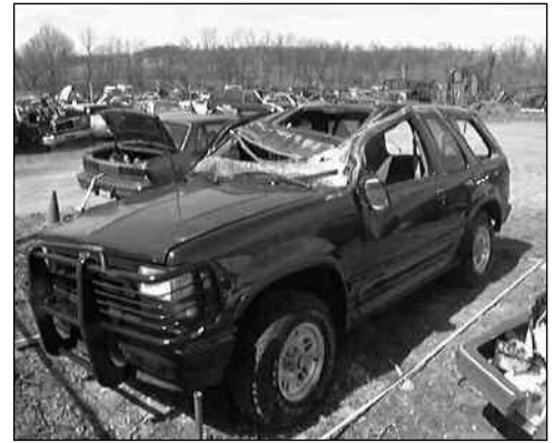
NHTSA/NATIONAL AUTOMOTIVE SAMPLING SYSTEM

Researchers analyzed data from NHTSA's Fatality Analysis Reporting System (FARS), General Estimates System (GES), and National Automotive Sampling System (NASS) to determine factors that affect rollover. They found that in single-vehicle crashes, 29.9 percent of SUVs rolled over. Factors associated with higher rollover probability included driver age under 25, driver drinking, three or more occupants in the vehicle, traversing a curve, road speed limits greater than 50 mph, roadway grades, ice on the roadway, and (for multiple vehicle accidents) travel between midnight and 6:00 a.m.