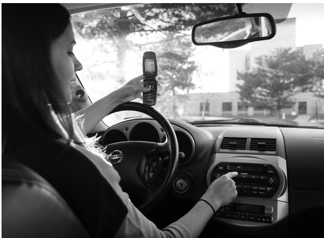
UMTRI YOUNG DRIVER BEHAVIOR AND INJURY PREVENTION GROUP

Likewise, if a teen’s parent reports looking for something in the vehicle while driving or reports eating or drinking while driving, the teen is twice as likely to do the same, but is four times