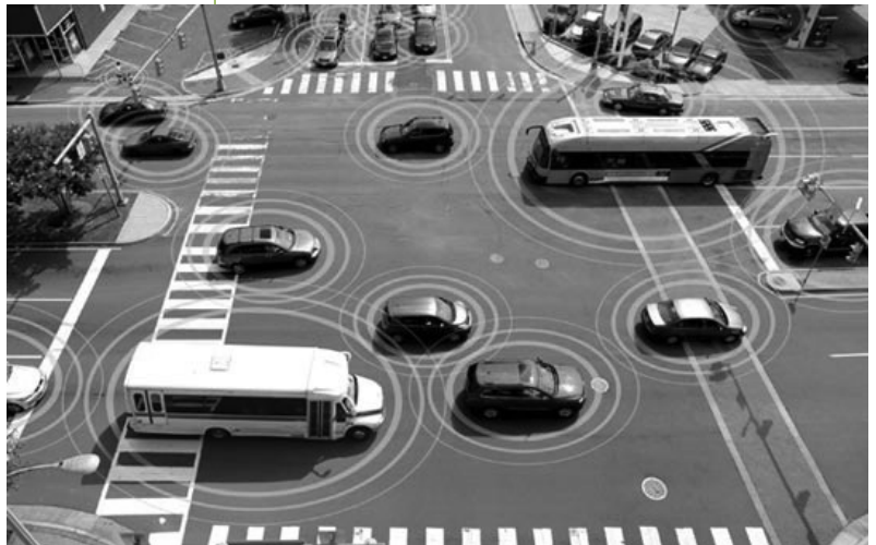
The UMTRI-TTI collaboration capitalizes on UMTRI's expertise in vehicle research and TTI's expertise in infrastructure.

"Currently we are identifying the areas that make the most sense to begin the collaboration on," says Maddox. "But clearly, connected and automated vehicles and transportation data would be prime examples of where the two institutes could interface together very well."