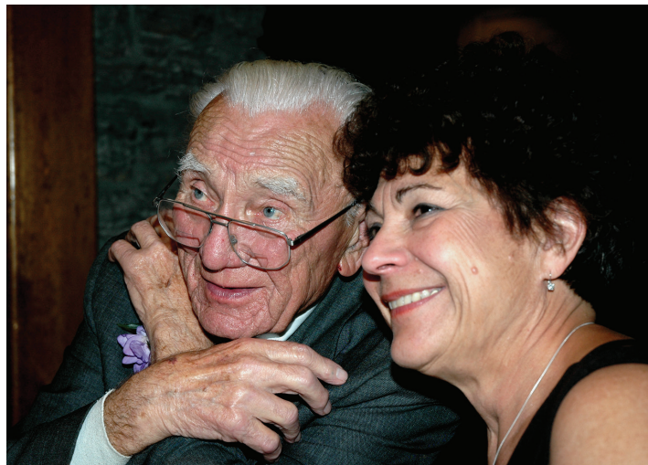
UMTRI BEHAVIORAL SCIENCES GROUP

Further analysis of recent statewide travel survey data shows that about one-third of adults age seventy and older lived alone, and 12 percent did not have access to a car. Among adults age eighty-five and older, 43 percent lived alone, and 16 percent did not have access to a car. Project findings indicate that adults age seventy and older made, on average, 2.6 trips per day. The most frequent trip purposes were for personal business, everyday shopping, eating out, picking up or dropping off passengers, and accompanying another person. Most trips were made by car, either as a driver (73 percent) or passenger (23 percent).